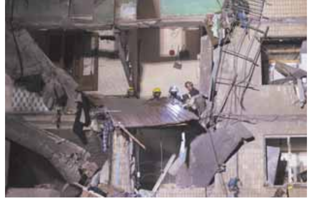
Rescue workers clear the rubble inside a building damaged by a Russian airstrike in Kharkiv, Ukraine, Thursday.

A Russian glide bomb struck a five-story apartment block in Kharkiv, Ukraine's second-largest city, injuring at least 12 people including a 3-year-old girl, local officials said Thursday. The bomb hit between the third and fourth floors of the building on Wednesday night, igniting blazes, Kharkiv regional Gov. Oleh Syniehubov said. Firefighters searched for survivors through smoke and rubble.