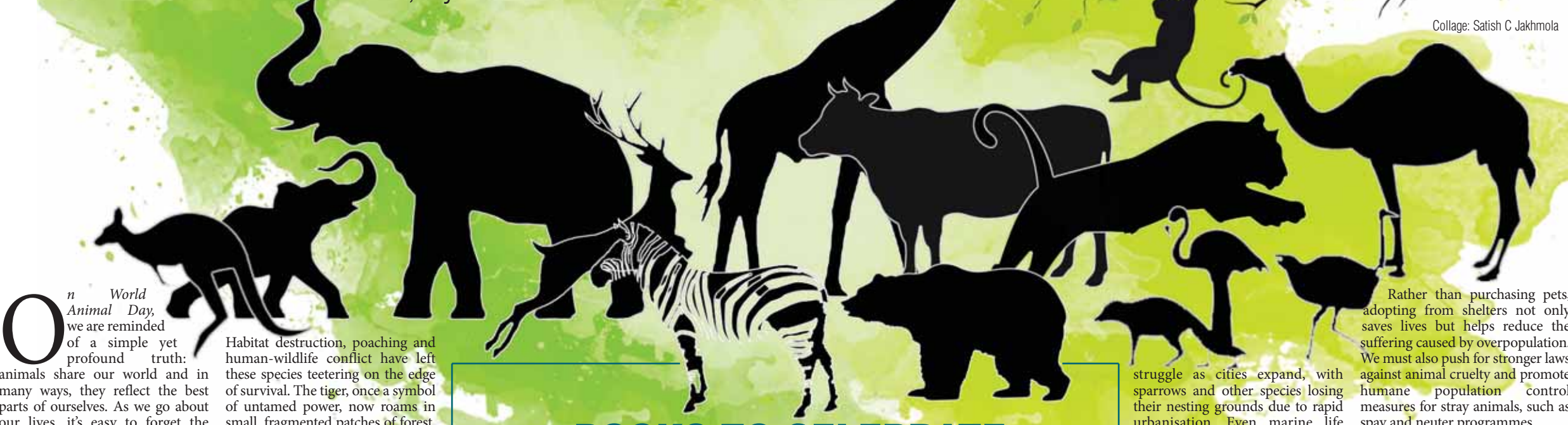
Collage: Satish C Jakhmola

As we observe World Animal Day 2024 , we embrace the theme, "The World is Their Home Too" This day serves as a powerful reminder that animals share our planet and deserve our care and protection. Let's come together to ensure that every creature feels safe and loved in the world we all inhabit, says SAKSHI PRIYA