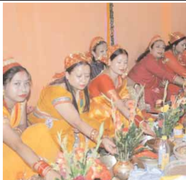
Nepali devotees during Kalash Sthapana on the first day of Navaratri festival at JAP 1 Doranda in Ranchi on Thursday.