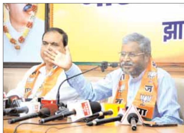
State BJP President Babul Marandi addresses media persons at the party office in Ranchi on Thursday.

Marandi said that the slogan given in the yatra was, 'Na kahenge na sahege, badal kar rahenge'. This went on for a long time. This slogan will continue in the future as well. Another slogan given in this was 'Hemant Soren jawab do, 5