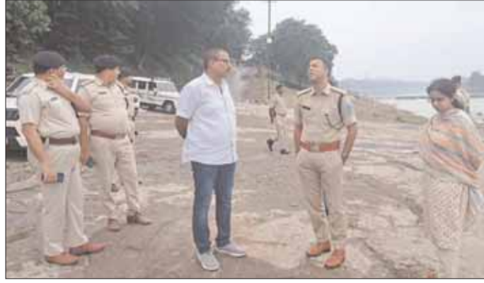
lines for barricading the ghats to manage crowd control effectively. "Proper barricading will ensure that devotees do not enter unsafe areas, particularly near the

Mittal also issued strict guidelines for barricading the ghats to manage crowd control effectively. "Proper barricading will ensure that devotees do not enter unsafe areas, particularly near the