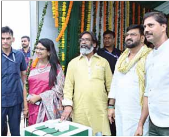
Chief Minister Hemant Soren inaugurates the newly constructed Transport Nagar Phase-1 and laid the foundation stone of the construction work of phase 2 at Sukurhutu in Ranchi on Thursday. Rajya Sabha MP Mahua Majhi and Sports Minister Hafizul Hassan and others are also seen in the picture. PNS

The Chief Minister said that Transport Nagar will provide a lot of convenience to the common citizens. This will provide relief from the traffic jam in the city to a great extent. The traffic system will be smooth. Heavy vehicles will not come to the city, which will ease the movement on the roads. At the same time, activities related to transport business including parking of heavy goods vehicles, loading-unloading, accommodation of drivers will be possible at one place.