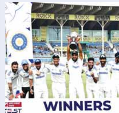
Team India creates Test history on October 1. Kudos to Team India for defeating Bangladesh by 7 wickets on the fifth day of Kanpur Test and winning the Test series by

2-0. Team India has set a record of never losing to Bangladesh so far and has created a record on home ground by achieving a thrilling victory in the 18th series. With this extremely brilliant and powerful performance of Team India, India has reached the top position in the ICC World Test Championship table (WTC).