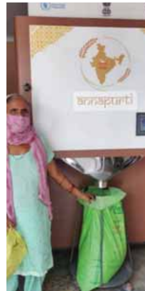
instance, if someone from Bihar or Uttar Pradesh trav-

Union Minister of State for Consumer Affairs, Food, and Public Distribution, Nimuben Bambhaniya, recently inaugurated Gujarat's first grain ATM in Bhavnagar, facilitating 24/7 ration distribution under the Central Government's Public Distribution System (PDS). The grain ATM, called Annapoorti, was installed in the Karchaliapara area of Bhavnagar city to free the poor from India's outdated, bureaucratic ration distribution system. According to Minister Bambhaniya, the grain ATM represents a global success story. She expressed pride in the Annapoorti scheme, a globally awarded solution developed in India, which is set to be operational in multiple states. Based on a year-long pilot program, the Annapoorti technology, developed by WFP India, is an important step toward improving food security and ensuring that people receive their rations efficiently and accurately. The new system allows people to obtain their ration from any PDS shop, reducing dependence on shop owners and minimising corruption. After the 'One Nation, One Ration Card' system, the biggest beneficiaries of grain ATMs will be migrant laborers and disadvantaged communities who live outside their home states for extended periods or are unable to reach grain shops. For