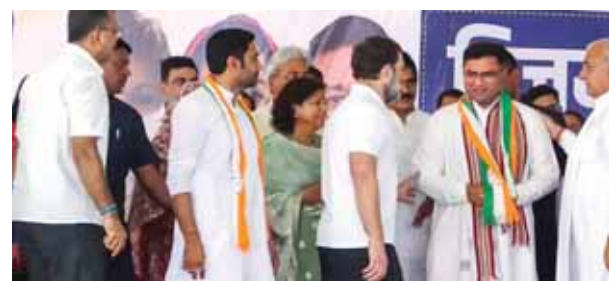
Leader of Opposition in Lok Sabha and Congress leader Rahul Gandhi with former BJP leader Ashok Tanwar as the latter joins Congress during a public meeting ahead of Haryana Assembly elections, in Mahendragarh district.

The high-voltage campaign for a cut throat finish in Haryana for the October 5 Assembly polls came to an end on Thursday evening. The ruling Bharatiya Janata Party (BJP) suffered a major blow as its senior leader and former Member of Parliament Ashok Tanwar, who was the party's candidate from Sirsa for the Lok Sabha elections a few months ago, re-joined Congress at a rally of Rahul Gandhi in Mahendragarh district in Haryana on Thursday. Interestingly, shortly before joining the grand old party, the former Sirsa MP, who represented it as a Congress member, was campaigning for the BJP candidate in Safidon Assembly constituency. As Rahul Gandhi finished his speech, an announcement was made from the stage asking the audience to wait for a few minutes. To their surprise Tanwar walked on to the stage and greeted Rahul.