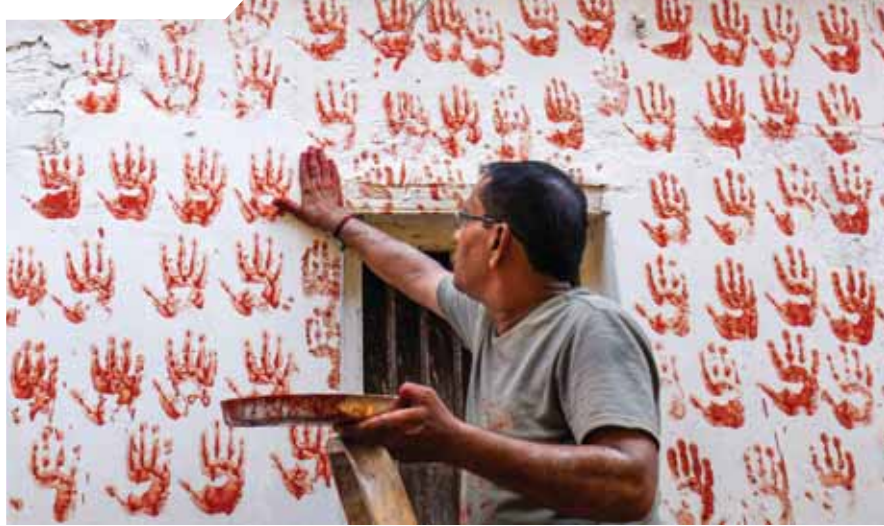
A man makes red handprints on a wall as part of a tradition on the first day of the 'Navratri' festival, in Ahmedabad