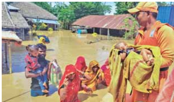
NDRF personnel conduct a rescue operation at a flood affected area, in Bihar's Supaul district

Flood situation in several parts of Bihar worsened on Monday as embankments of Kosi river in Darbhanga district and Bagmati river in Sitamarhi were breached, officials said.