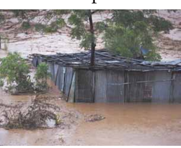
A tin shed lies partially submerged at the edge of the Bagmati River in spate after heavy rains in Kathmandu, Nepal, Saturday.

Search and rescue operations continued in Nepal for the third consecutive day on Monday after monsoon-induced floods and landslides killed more than 200 people in one of the worst rain-related disasters in the Himalayan nation in recent years.