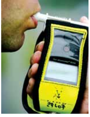
a motorist travelling on the roads of the National Capital are among the most prone to road fatalities as data reveals

In a bid to tackle problems regarding road safety and discourage habitual offenders, the Delhi Traffic Police has written to the Secretary of the Delhi Transport Department to cancel the driving licences of owners of vehicles, which have had three violations relating to dangerous driving and drink and driving or more than five relating to normal challans. This comes in the light of a recently released Delhi road crash report of 2023, which revealed that a pedestrian or