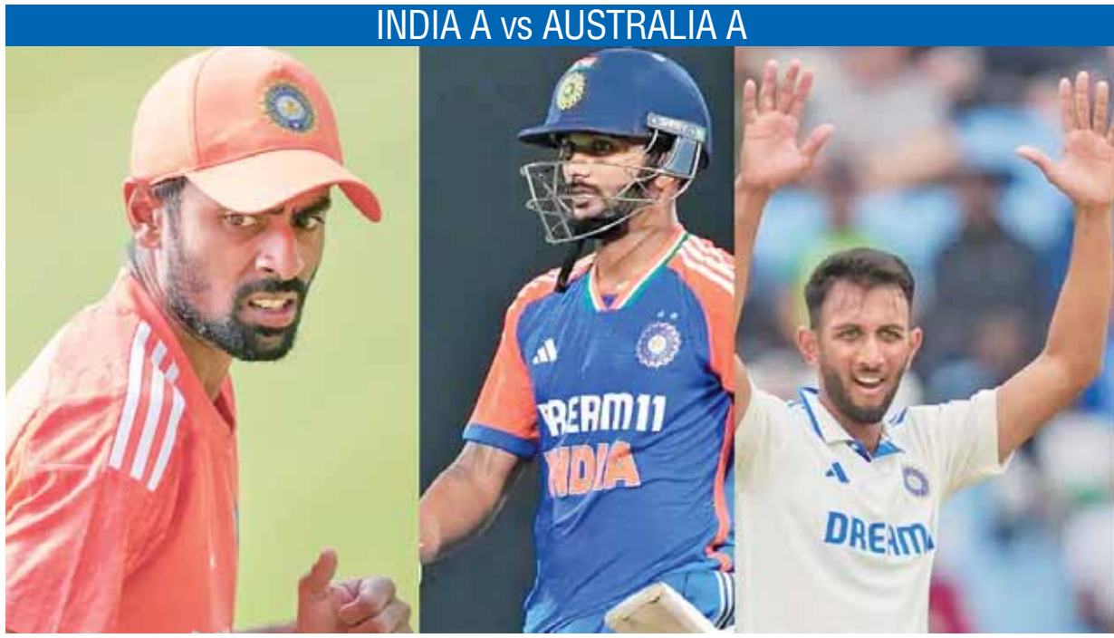
INDIA A vs AUSTRALIA A

recent form in First-Class matches. The right-hander struck 157 and 116 for India B in the Duleep Trophy before making a 191 against Mumbai for Rest of India in the Irani Trophy and made another hundred in his final red-ball game before flying out to Australia - an unbeaten 127 against Uttar Pradesh in the Ranji Trophy. So, he has the body of work to feel in fine fettle ahead of the match against Australia A, though the conditions here will be vastly different from what he has experienced so far this season in India. On the other hand, Nitish does not boast of such impressive First-Class numbers, as he has been drafted into squad for his perceived ability as a pace-bowling all-rounder and, even in that, batting is his stronger suit. In the Duleep Trophy earlier this year, Nitish made two ducks with a highest of 40 in five matches while grabbing just two wickets. But the selectors have backed him ahead of senior names such as Shardul Thakur, who has resumed playing domestic