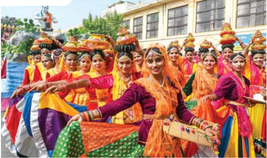
Artists dance on the Rampath ahead of Deepotsav celebrations, in Ayodhya