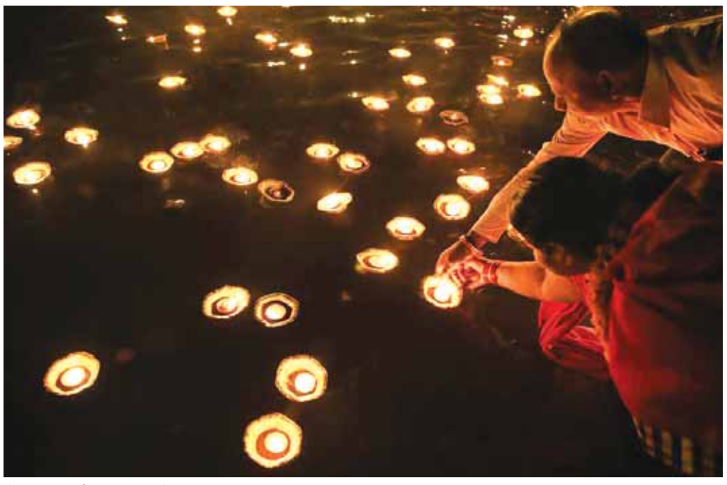
A view of the Saryu river on Deepawali eve