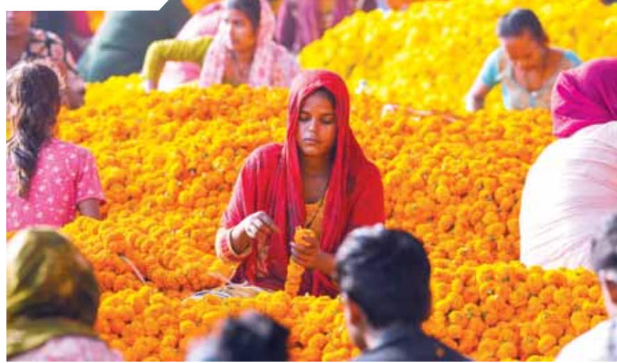
A Vendor sell flowers ahead of the Diwali festival, at the Ghazipur flower market in Delhi