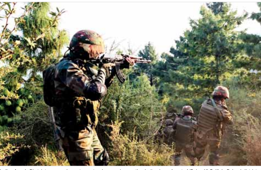
Indian Army's Ghatak team carrying out an extensive search operation in the dense forest of 'Dehra Ki Galli', in Rajouri district, Jammu and Kashmir