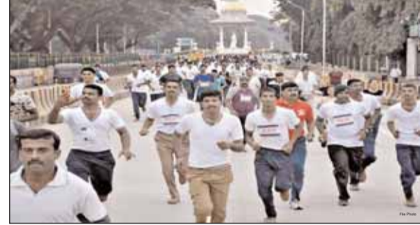
players and dignitaries will take part in the races. The district Collectors have urged people to

Common citizens, public representatives, government officials and employees, sports