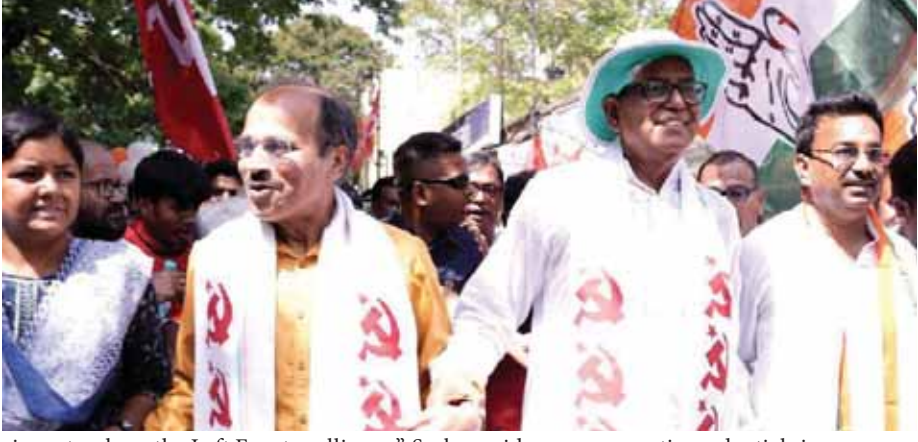
six seats where the Left Front is contesting. The Left is contesting is all but one seat of Haroa which it has set aside for Indian Secular Front. On why there was no alliance between the two parties that jointly contested several elections together since 2016, the new PCC president said since Congress was not a member of the Left Front it had every right to take its own decision. "Is the Congress a part of the Left Front... we had fought together parliamentary elections but situations continue to change in politics... there is no compulsion that every time there has to be an