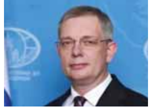
happy that it took place in Kazan... We wholeheartedly welcome the meeting." On October 23, Prime Minister Modi and the Chinese president had endorsed the agreement on patrolling and disengagement along the Line of Actual Control (LAC) in eastern Ladakh during their bilateral meeting on the sidelines of the BRICS Summit. They had also issued directions to revive various bilateral dialogue mechanisms, signalling attempts to normalise ties that were hit by a deadly military clash in 2020.