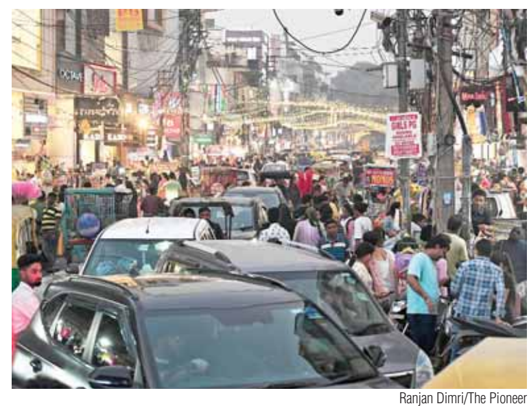
Ranjana Dimri/The Pioneer

colonies, encroachment and consequent traffic congestion in markets like Kamla Nagar." Another such market is also in the Govindpuri area where the weekly market, where day to day items are sold at affordable prices, on Wednesday creates a complete breakdown of traffic, making it extremely hard for not just vehicles but pedestrians to move. Further exacerbating the issue, are the encroachments by vendors who set up their shops on the roadsides, and the consumers who lead to limited space on the road for free flow of traffic on a street which is situated close to Govindpuri metro station and residential apartments. "I live in Govindpuri extension and every Wednesday, the roads that are already narrow due to encroachments and parking on the roadside become even worse. There are vendors with their shops and the customers are standing on the roads making it very