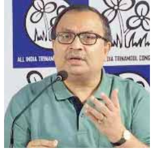
jurisdiction of BSF has been expanded from 15 km to 50 km along the border but still they have failed to reign in infiltration... whose failure is this... is TMC or Bengal Police responsible for this." Calling the senior BJP leader a "political tourist" who came during the elections and returns with "failed agenda," Ghosh said "he used to be a daily passenger during the 2021 State elections and 2024 General elections... still the BJP suffered a humiliating defeat... this is because the people of Bengal despise the BJP's culture of hatred and love Chief Minister Mamata Banerjee's leadership, her people friendly schemes... As a Home Minister he is an impor-