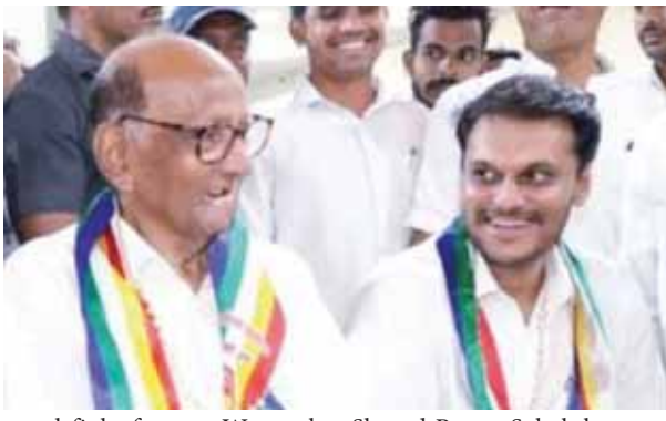
Sharad Pawar Sahab because he is the founder of the NCP, he is the patriarch of the family and it is because of him that not only Baramati but everybody around also pro-