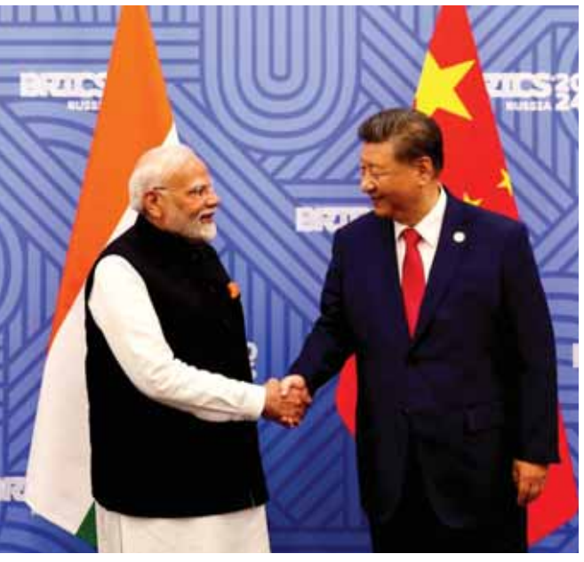
representatives on the India-China boundary question have a critical role to play in the resolution of the issue and for the maintenance of peace and tranquillity in border areas.

PTI ■ KAZAN In their first structured bilateral talks in nearly five years, Prime Minister Narendra Modi and Chinese President Xi Jinping on Wednesday agreed that India and China can have a "peaceful and stable" relationship by displaying maturity and mutual respect, and endorsed the pact on the resolution of the dragging eastern Ladakh border row. In the meeting, Modi underscored the importance of properly handling differences and disputes and not allowing them to disturb peace and tranquillity. In a post on 'X', Modi said, "India-China relations are important for the people of our countries, and for regional and global peace and stability." "Mutual trust, mutual respect and mutual sensitivity will guide bilateral relations," he said. Foreign Secretary Vikram Misri said at a media briefing that the two leaders noted that the special