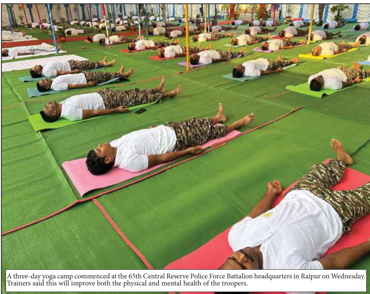
A three-day yoga camp commenced at the 65th Central Reserve Police Force Battalion headquarters in Raipur on Wednesday. Trainers said this will improve both the physical and mental health of the troopers.