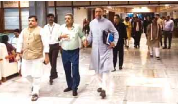
Members of Joint Parliamentary Committee on Waqf (Amendment) Bill leave after a meeting at Parliament House Annex, in New Delhi, Tuesday

PIONEER NEWS SERVICE ■ NEW DELHI In a bizarre incident, All India Trinamool Congress Member of Parliament Kalyan Banerjee created a ruckus during a crucial Waqf meeting in Parliament on Tuesday where he smashed a glass water bottle and hurled it towards the Chair. Banerjee injured himself and jeopardised the safety of other