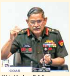
Chief of the Army Staff General Upendra Dwivedi during a press conference, in New Delhi

humanity. India is ready to provide all possible cooperation in times to come," he said. "We have the opportunity to discuss all these issues," he added. On his part, Putin noted the "good condition" of trade turnover between Russia and India. In his remarks, Modi also referred to his summit talks with the Russian leader in Moscow in July. Our annual summit resulted in strengthening cooperation in every field, he said. The Prime Minister also congratulated Putin on Russia's successful presidency of BRICS. Many countries want to join the grouping now, he added. "It is a matter of great pleasure for me to have the opportunity to visit a beautiful city like Kazan for the BRICS summit. India has deep and historical ties with this city," Modi said. "The opening of India's new consulate in Kazan will further strengthen these ties," he added. It is learnt that the Ukraine conflict figured prominently at the meeting. In the summit talks on July 9 in Moscow, Modi told Putin that a solution to the Ukraine conflict is not possible on the battlefield and peace efforts do not succeed in the midst of bombs and bullets. Weeks later he travelled to Ukraine. In his talks with Zelenskyy, Modi said both Ukraine and Russia should sit together without wasting time to end the ongoing war and that India was ready to play an "active role" to restore peace in the region. India has been maintaining that the conflict in Ukraine must be resolved through dialogue and diplomacy.