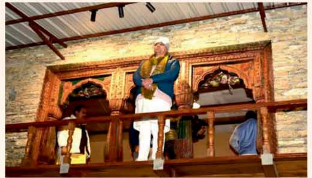
In 2024, the Ministry of Tourism, Government of India, awarded the title of Best Tourism Village to four villages in Uttarakhand: Jakhoul village and Harsil village in Uttarkashi district, Gunji village in the border area of Pithoragarh district, and Supi village in Bageshwar district.

Prime Minister Narendra Modi has stated that rural areas are becoming centers of tourism. Additionally, every tourist destination can develop its own revenue model. To boost the rural economy, we need to promote businesses like homestays and small hotels.