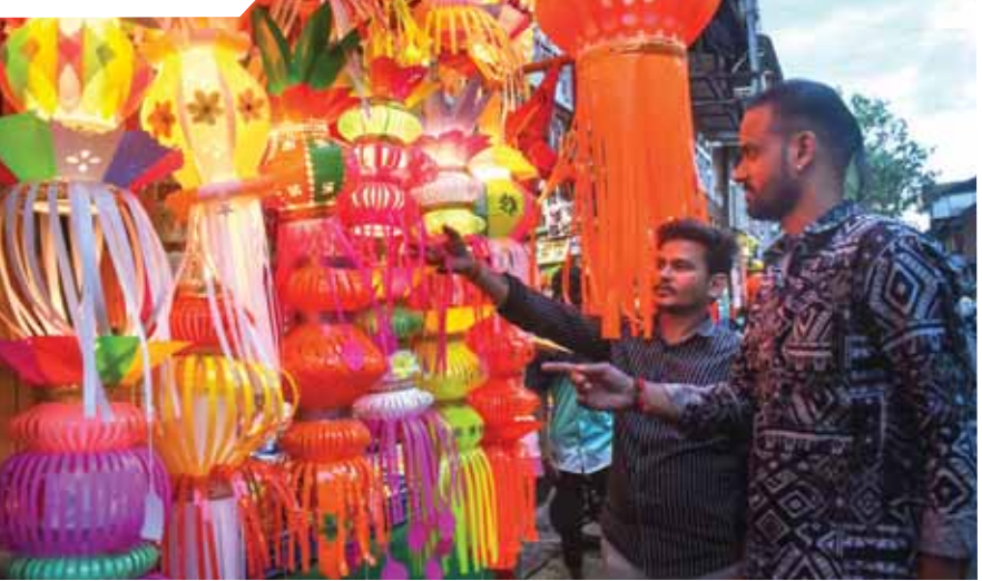
People buy lanterns ahead of the Diwali festival, in Solapur