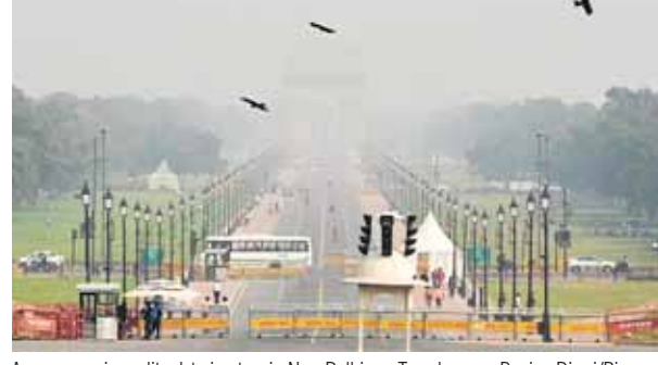
A smog as air quality deteriorates, in New Delhi, on Tuesday

Even before the arrival of winter, Delhi along with several cities of north India is gasping for clean air as air quality has degraded to alarming levels over the past few days. Based on the real time data, Delhi ranks top on the list of most polluted cities in the country. It was the second-most polluted city in the world on Tuesday, a live ranking on IQAir's a Swiss based air quality monitoring website indicated, after only Lahore in neighbouring Pakistan. AQI in Lahore recorded 394. A layer of smog engulfed Delhi and surrounding areas, including Noida, on Tuesday morning, even as the air quality plummeted to the 'very poor' category at 327, followed by Haryana's Jind where the AQI stood at 311. Meanwhile, out of 36 monitoring stations in the National Capital, 26 are in the red zone, with the AQI recorded in the "very poor" category, according to data from the Central Pollution Control Board. These stations