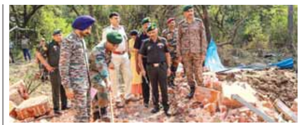
Officials at the blast site of Ordnance Factory Jabalpur (OFJ), in Jabalpur district, Madhya Pradesh, Tuesday

Jagdambika Pal of the Bharatiya Janata Party (BJP), during a heated exchange of words with BJP's Abhijit Gangopadhyay, a former Calcutta High Court judge. This is the second time Banerjee has made news for odd reasons, the last time he had mimicked a presiding officer of the Parliament. The act was condemned by the President of India, Prime Minister and his Cabinet colleagues. According to sources, the panel voted nine-eight on a resolution moved by BJP MP Nishikant Dubey to suspend Banerjee for a day for his choice of words for the panel chairman, and for smashing a glass bottle and throwing it towards Pal. After the meeting concluded, Banerjee refused to talk to reporters about the incident. After being administered first aid, Banerjee was seen being escorted back to the meeting room by AIMIM chief Asaduddin Owaisi and AAP leader Sanjay Singh. Continued on page 2