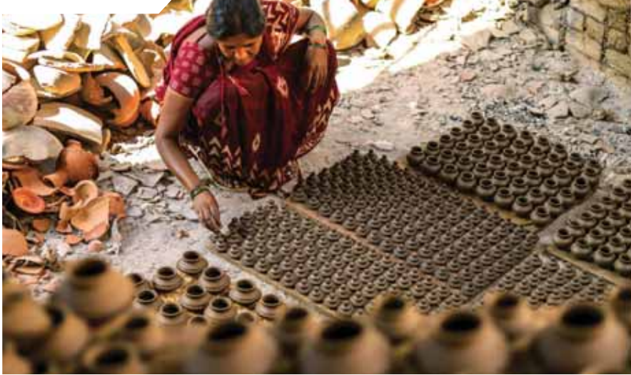
A potter arranges freshly-made 'diyas' (earthen lamps) ahead of the Diwali festival, in Hyderabad