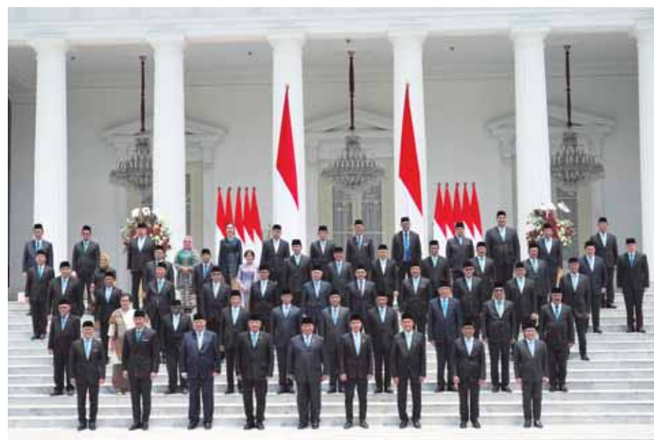
Indonesian President Prabowo Subianto, front centre, and Vice President Gibran Rakabuming Raka, front row fourth from right, pose for a group photo with newly-appointed cabinet ministers after their swearing-in ceremony at Merdeka Palace in Jakarta, Indonesia, on Monday.

Newly inaugurated President Prabowo Subianto swore in Indonesia's largest Cabinet since 1966 on Monday, with 109 members representing his pledge for a strong government. He announced the lineup late Sunday and named his Cabinet of ministers, vice ministers and head of national agencies the "Red and White Cabinet," referring to the colours of Indonesia's flag. Subianto became the eighth president of Southeast Asia's largest economy on Sunday. The Cabinet of Subianto's predecessor, Joko Widodo, had 34 ministers and head of government agencies. Subianto's Cabinet is the largest since 1966 when Indonesia's first President Sukarno formed a lineup of 132 ministers in an extremely tense political situation after a failed 1965 coup.