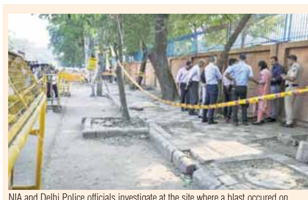
NIA and Delhi Police officials investigate at the site where a blast occurred on Sunday, near a CRPF school at Prashant Vihar, in Rohini area of New Delhi

contact with each other in a variety of forums. As a result of these discussions, agreement has been arrived at patrolling arrangements along the line of actual control in the India China border areas, leading to disengagement and a resolution of the issues that had arisen in these areas in 2020. We will be taking the next steps on this," he said. The foreign secretary said the Indian and Chinese negotiators were in touch over the last few weeks to resolve the remaining issues. It is understood that the agreement pertains to patrolling in Depsang and Demchok areas. It is not immediately clear whether the agreement facilitates the restoration of patrolling rights that were in place prior to the standoff. Tensions flared up at the LAC in Eastern Ladakh in May 2020 when China unilaterally tried to change the status quo on the border. It led to a major clash between the troops of the two armies on June 15 that