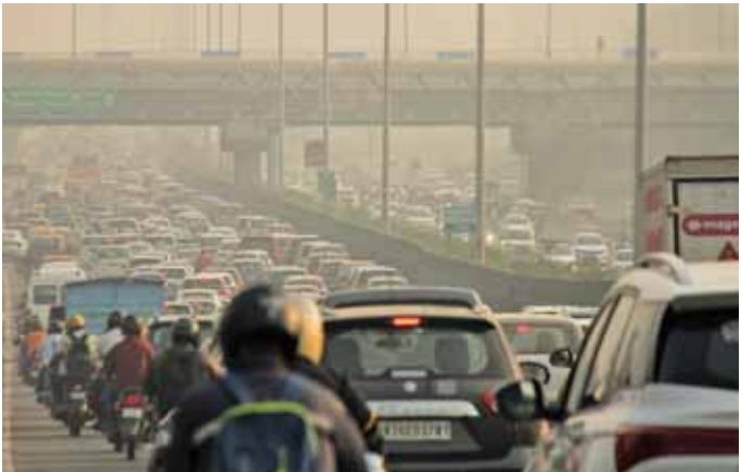
Heavy evening traffic moves amidst a blanket of smog, in Gurugram, Monday

Gate ISBT, Sadar Bazar, Chirag Dilli, roads surrounding major markets including Sarojini Nagar, Chandni Chowk, Lajpat Nagar, Kamla Nagar were among those areas witnessed heavy traffic on Monday. These stretches are the busiest roads known for heavy traffic flow during the week. Lakhs of people commute in and from Delhi to Gurugram, Noida, Faridabad and Ghaziabad daily. Neighbouring Noida has been consistently contributing between 10 and 11 per cent to Delhi's pollution, while Ghaziabad's share ranges from 5 to 10 per cent, as per the DSS -