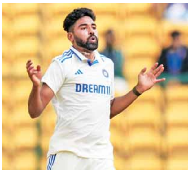
Jasprit Bumrah and Mohammed Shami, who have had the ability to throw pitch and conditions out of equation. To be fair to Siraj, in those 13 Tests, he went wicket-less in four with a couple of them against Australia last year played on rank turners in

Indian skipper Rohit Sharma believes in consistency when it comes to team selection but he will have to take a leap of faith to retain speedster Mohammed Siraj in the playing eleven for the second Test against New Zealand considering his poor run in home conditions. The match starts in Pune from October 24 and inclusion of spin bowling all-rounder Washington Sundar as the fifth slow bowler is an indication that coach Gautam Gambhir and Rohit might go for the jugular on a spin-friendly track. The 30-year-old Hyderabad has so far taken 80 wickets in 30 Test matches but 61 of those scalps have come in 17 away Test matches in three of the SENA countries (South Africa, England, Australia). Only 19 wickets after bowling 192.2 overs in 13 home Tests are figures that imply that Siraj has struggled in sub-continental conditions unlike