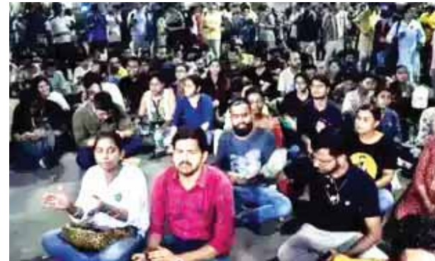
and murdered on August 9 inside the RG Kar Medical College and Hospital ... They are asking for a foolproof system including centralized real system with real time monitoring, enhanced security network, end of mafia and syndicate raj, timely students' union elections so as to keep the corrupt authorities in check ... these can all be done The doctors are The IMA reportedly gave in writing to the Government about the existence of a "mafia

... the Government said that they are taking steps towards resolving issues ... but there was no concrete proposal ... there was no show of intent ... nothing in writing was given to us ... only they said 'we are doing ... we are looking into it' ... the Health Secretary whose resignation the junior doctors have been asking for and who should have been present in the meeting was not present and we were told that he is absent ... this is the most insensitive Government that we have ever seen," the doctors emerging out of the meeting said. The meeting was held in the backdrop of the junior doctors' indefinite fast entering its tenth day on Monday with four doctors already having been shifted to hospital with their parameters falling drastically, sources said. "What illegality is there in the doctors' demands ... they are asking for justice for their lady colleague who was raped