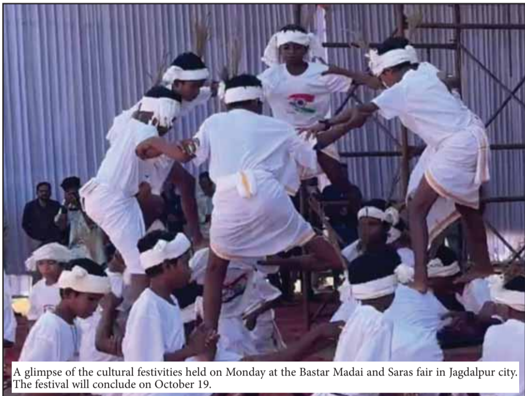
A glimpse of the cultural festivities held on Monday at the Bastar Madai and Saras fair in Jagdalpur city. The festival will conclude on October 19.

Extending his best wishes to employees of the Forest Department in an online video, Chief Minister Vishnu Deo Sai said that it is a matter of great enthusiasm that forest service officers and employees from all over the country participate in the competition to be organised in Chhattisgarh.