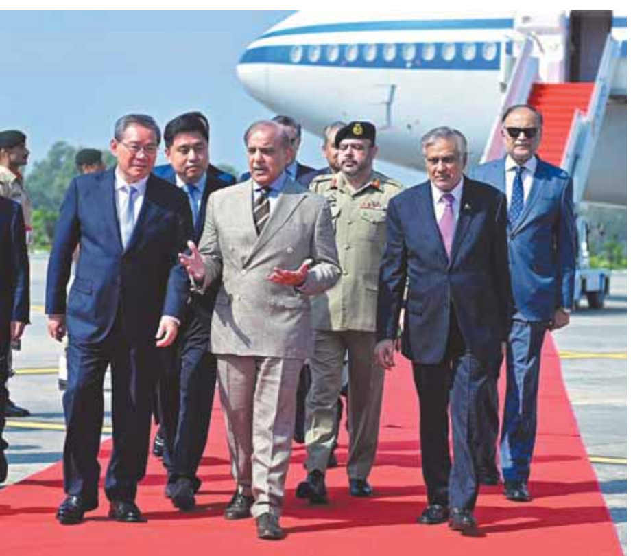
China's Premier Li Qiang (left) walks Pakistan's Prime Minister Shehbaz Sharif (second left) upon his arrival at an airbase in Rawalpindi, Pakistan on Monday.

Government (CHG) meeting of the Shanghai Cooperation Organisation (SCO) here to discuss the ongoing cooperation in economy, trade and environment. The CHG meeting will discuss ongoing cooperation in the fields of economy, trade, environment, socio-cultural linkages and review the performance of the Organisation. The leaders will adopt important organisational decisions to further enhance cooperation among SCO member States and approve the budget of the Organisation. Prime Minister Shehbaz Sharif, in his capacity as the current Chair of the CHG, will preside over the upcoming CHG meeting. According to the Foreign Office, the SCO member States will be represented by the Prime Ministers of China, Russia, Belarus, Kazakhstan, Kyrgyzstan, Tajikistan and Uzbekistan as well as the First Vice President of Iran apart from Jaishankar.