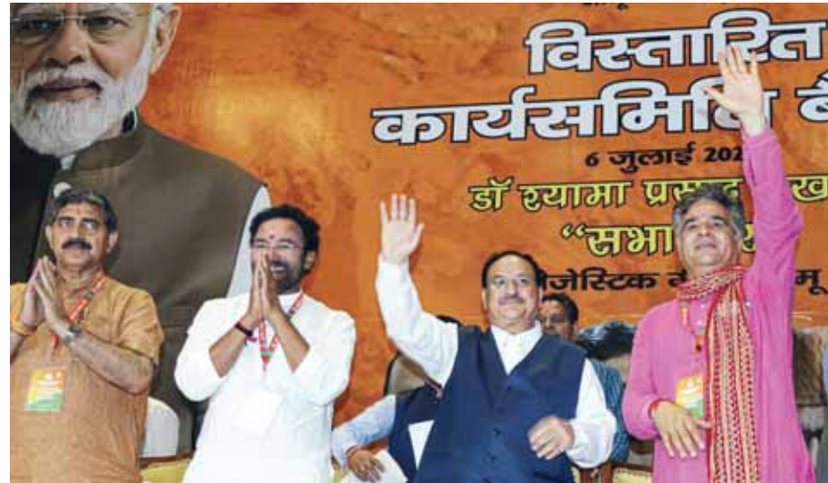
Prahlad Joshi (left) and Tarun Chugh (right) are seen with other party leaders during a meeting. One name in the race for

The BJP Parliamentary Board has appointed Union Minister, Prahlad Joshi and BJP national general secretary, Incharge J and K and Ladakh UTs, Tarun Chugh as Central Observers for Jammu and Kashmir to monitor the appointment of the Leader of the Legislature Party. The Bharatiya Janata Party (BJP), which swept the polls in the Jammu plains winning 29 seats, is second in terms of seats won as well as the number of first-time MLAs. The saffron party has 15 first-