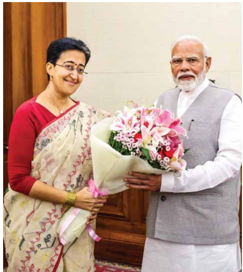
Prime Minister Narendra Modi with Delhi Chief Minister Atishi during a meeting, in New Delhi

city for monitoring. He added that all construction sites larger than 500 square meters must now register on the Construction and Demolition (C&D) portal. "A fine of Rs. one lakh will be imposed on construction projects with an area of less than 20,000 square meters, and Rs. two lakh on projects with an area exceeding 20,000 square meters, for not registering on the C&D portal. A penalty of Rs. 7,500 per day will be imposed for failing to install anti-smog guns at construction sites. For not implementing dust mitigation measures, construction projects with an area of less than 500 square meters will be fined Rs. 7,500 per day, while those with an area exceeding 500 square meters will face a fine of Rs. 15,000 per day. Vehicles transporting construction materials must be properly covered. A fine of Rs. 7,500 will be imposed for any violation of this rule," Rai said.