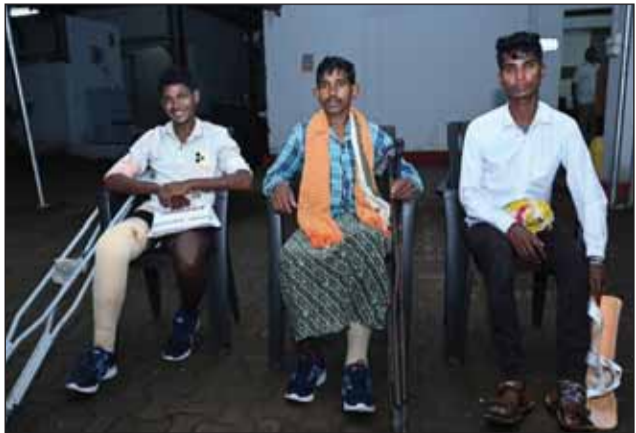
They said that now they could think about moving on, as they won't need anyone else's support at every step.

The rehabilitation centre personnel briefed them how to walk again.