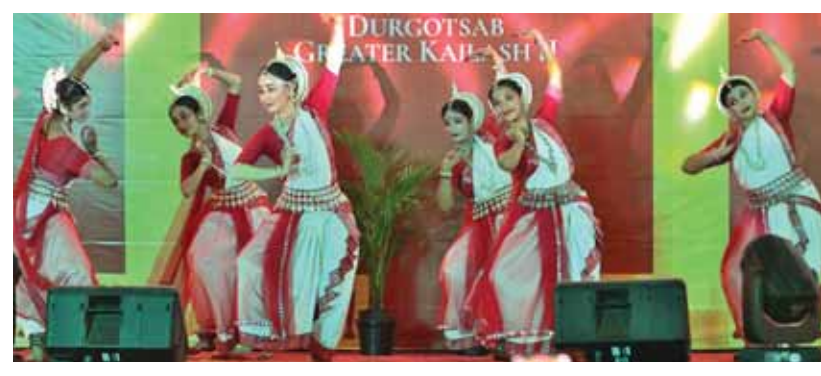
celebrate the victory of good over evil, the triumph of light over darkness.

THE STREETS COME ALIVE The streets of C.R. Park become a celebration in themselves. It's not just about the pandals - it's the whole neighbourhood that transforms. The lanes are filled with people walking from one pandal to another and families taking pictures to capture the beautiful moments. The colourful lights strung across buildings, the sound of Rabindra Sangeet floating through the air and the laughter of people enjoying the festival all come together to create a magical atmosphere. Even if you're not Bengali, it's hard not to get swept up in the energy of Durga Puja in C.R. Park. People from all over Delhi come here to experience the festival and there's a sense of community that goes beyond language and culture. It's a time when everyone comes together to