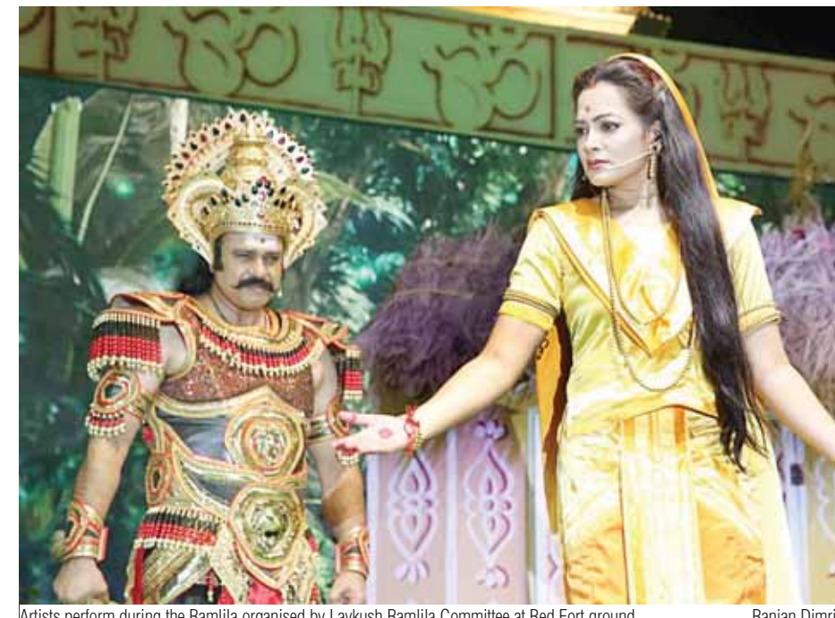
Artists perform during the Ramnala organised by Lavkush Ramnala Committee at Red Fort ground. Ranjan Dimri

dates and their parties be directed to remove the defacement and refurbish the areas and make efforts to beautify the destroyed portions. The court granted time to the candidates, petitioner, MCD, and DMRC to file their status reports and listed the matter for October 21. The court had on September 26 halted the counting of votes of DUSU and college elections till all the defacement material, including posters, hoarding and graffiti, is removed and restoration done. It had said the election may proceed but the counting of votes will not take place till the court is satisfied that defacement of property has been removed.