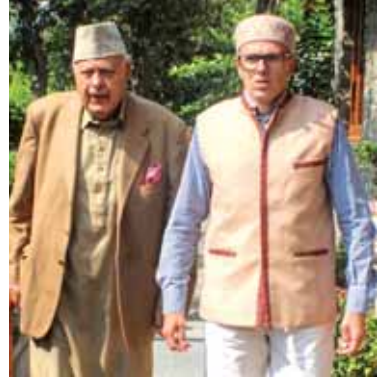
Jammu & Kashmir National Conference (JKNC) President Farooq Abdullah with his son and party Vice President Omar Abdullah during celebrations after the victory of JKNC-Congress alliance in the J&K Assembly elections at their residence, in Srinagar, Wednesday

only to a BJP government or a government that has BJP members. They said the statehood would be restored to J&K and that is what we hope will be done". Responding to a question related to his party's stand on the issue of Article 370 Omar said, "Our political stand will not change. We have never said that we will remain silent on Article 370 or that Article 370 is not an issue for us now. I have said this many times before the elections that hoping for the restoration of Article 370 from the people who snatched it will be foolish." "But we will keep this issue alive. We will continue to talk on this and hope that tomorrow there will be a change of government in the country, there will be a new setup with whom we can discuss this and get something for J&K," he added.