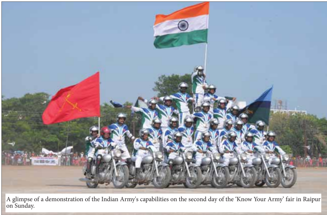
A glimpse of a demonstration of the Indian Army's capabilities on the second day of the 'Know Your Army' fair in Raipur on Sunday.

on both legs and is expected to be discharged in a few days.