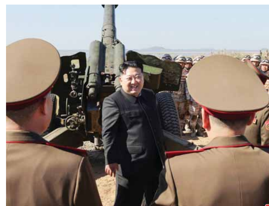
In this undated photo provided on Saturday by the North Korean government, North Korean leader Kim Jong Un, center, visits to watch an artillery exercise at an undisclosed place in North Korea. Independent journalists were not given access to cover the event depicted in this image distributed by the North Korean government. The content of this image is as provided and cannot be independently verified. Korean language watermark on image as provided by source reads: "KCNA" which is the abbreviation for Korean Central News Agency.

North Korea is locked in confrontations with the U.S., South Korea and their partners over its advancing nuclear program. Kim has said he was forced to expand both nuclear and conventional capabilities to cope with US-led security threats. On Sunday, KCNA reported that Kim oversaw a live artillery firing drill by cadets of a military academy. After watching the drill, Kim said training programs at the military academy must focus on "the guerrilla war tactics to wipe out the enemies through rapid mobile and surprise operations," according to KCNA.