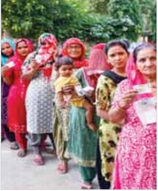
plagued the region in recent years.

A Congress victory in Haryana could be a defining moment in national politics. It would signal that the BJP's stronghold in the Hindi heartland is weakening and Jats (who have significant presence in western UP) are returning to Congress fold and non-Jats — upper castes — the traditional BJP voters are also have also splitted. Congress couldn't be happier as it could also galvanise Congress supporters across other northern states, particularly Rajasthan and Punjab, where state elections are due soon. But it would have a daunting task of keeping the rebels happy as they could turn the tables. In contrast, the outcome in Jammu and Kashmir-if a hung assembly materializes-could deepen political instability in the Union Territory. A coalition government would have to balance the diverse and often conflicting interests of Jammu, Kashmir and Ladakh, complicating governance. Moreover, this result could prompt national parties, particularly the BJP, to reassess their strategies in sensitive regions like Jammu and Kashmir, where identity politics and security concerns dominate. However, as with all exit polls, it's important to approach these predictions with skepticism, given how they have been inaccurate in past elections.