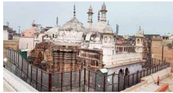
BISWAJEET BANERJEE ■ LUCKNOW

In a development mirroring the Ram Mandir case, a petition has been filed in the Supreme Court requesting that all cases related to the Gyanvapi issue be heard by a three-judge bench of the Allahabad High Court.