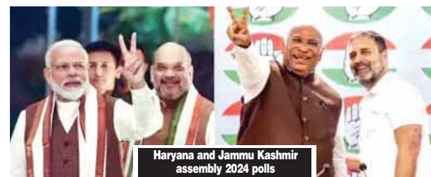
Haryana and Jammu Kashmir assembly 2024 polls

Former Haryana Chief Minister Bhupinder Singh Hooda said he was expecting a