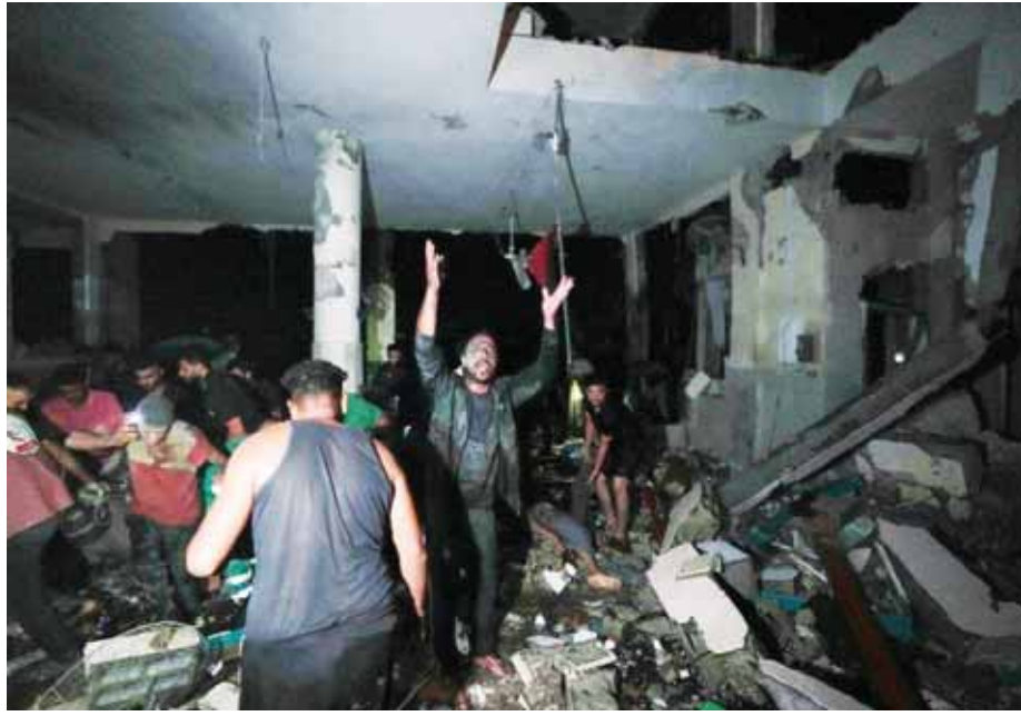
Palestinians search for survivors and bodies in the rubble of a mosque destroyed in an Israeli airstrike in Deir al-Balah, Sunday.

Israel is still battling Hamas in Gaza a year after the group's attack on Israel, and has opened a new front in Lebanon against Hezbollah, which has been trading fire with Israel along the border since the war in Gaza began. Israel has also vowed to strike Iran itself after Tehran launched a ballistic missile attack on Israel last week.