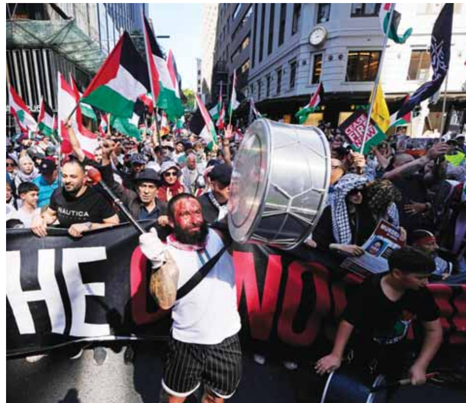
A man bangs a drum during a march as pro-Palestinian supporters rally in Sydney, Sunday.

eral other cities in the United States as well as in other parts of the world, including Denmark, Switzerland, South Africa and India. In the Philippines, dozens of left-wing activists protested near the U.S. Embassy in Manila, where police prevented them from getting closer to the seaside compound. Pro-Israeli demonstrations are expected to be held Sunday because Jews across the world are still observing Rosh Hashana, or the Jewish new year. This year, emotions will be high for many given that the midpoint of the 10 days spanning Rosh Hashana and Yom Kippur is Oct. 7 — the one-year anniversary of the Hamas attack that killed 1,200 Israelis and triggered the ongoing war in Gaza. Security forces in several countries warned of heightened levels of alert in major cities, amid concerns that the escalating conflict in the Middle East could inspire new terror attacks in Europe or that the protests could turn violent.