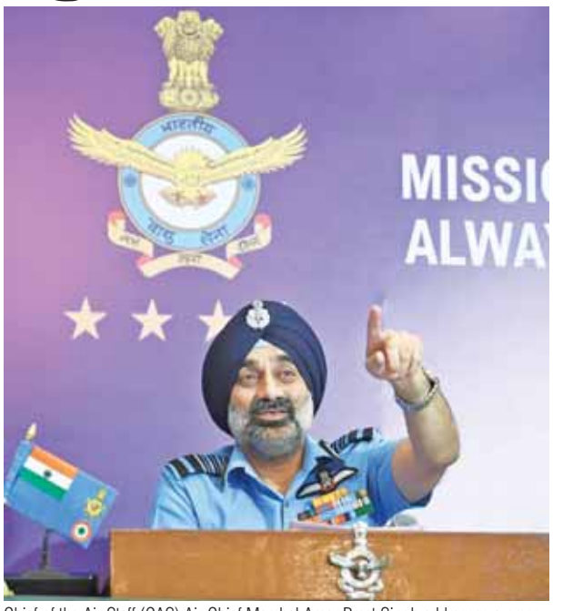
Chief of the Air Staff (CAS) Air Chief Marshal Amar Preet Singh addresses a press conference at Akash Air Force Mess, in New Delhi on Friday

China is rapidly developing infrastructure on its side across the Line of Actual Control (LAC) and India is also matching up by improving its airfields in the border areas, IAF chief AP Singh said here on Friday.