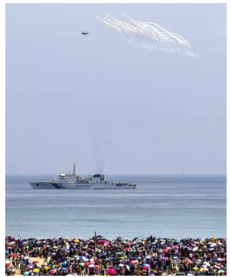
People watch the final rehearsal of Indian Air Force (IAF) aircrafts ahead of its 92nd anniversary celebrations, in Chennai