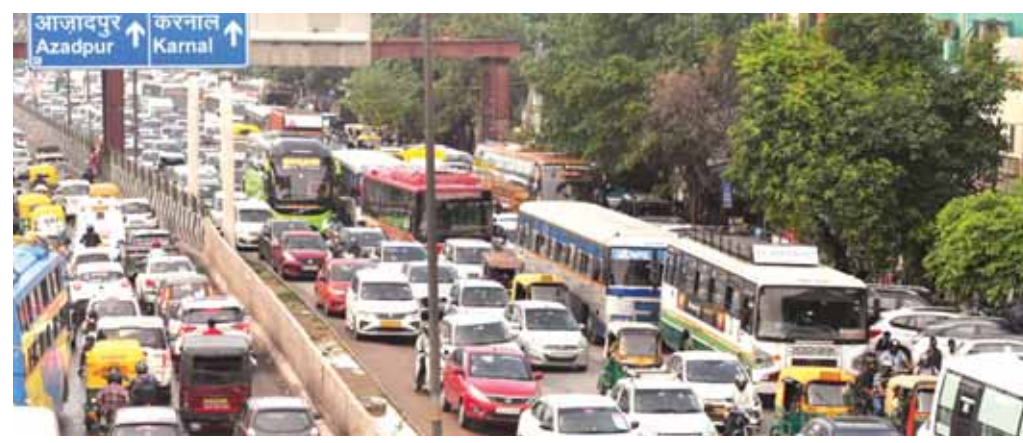
A Traffic Jam Vehicles move on road at isbt kashmiri gate