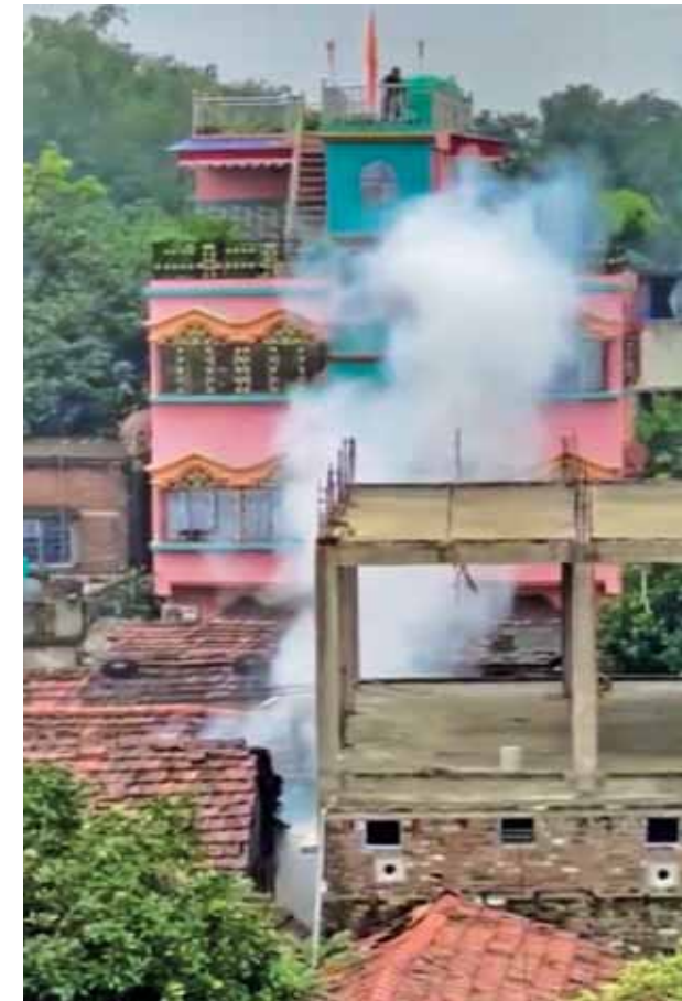
Smoke rises after bombs were allegedly hurled at the office-cum-residence of BJP leader Arjun Singh, in North 24 Parganas district, Friday, October 4, 2024. Singh alleged that a group of people threw stones, hurled bombs and fired multiple gunshots around 8.30 am on Friday

number of 28 seats in the previous polls while BJP has touched the tally of 25 in the 2014 Assembly polls. Congress has touched 20 before hitting the lowest number of 12 seats in 2014. The like-minded political parties will have no other option but to join hands together to cobble up a majority. Meanwhile, Congress has strongly objected to the move of the ruling BJP to get five of its leaders nominated to the Legislative Assembly, from LG before the process of Government formation in J and K and termed any such move as undemocratic and against the mandate of people and asked the LG to desist from any such move.