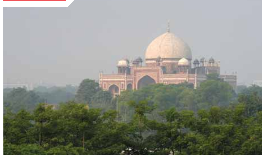
A view of Humayun's Tomb, a UNESCO world heritage site, in New Delhi