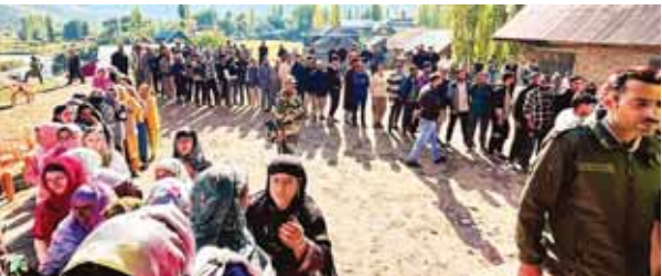
People wait in queues to cast their votes at a polling booth during the third and final phase of Jammu & Kashmir Assembly elections, at Gurez valley in Bandipora district, J and K, Tuesday