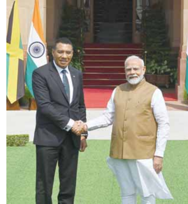
Prime Minister Narendra Modi with his Jamaican counterpart Andrew Holness prior to their meeting at Hyderabad House, in New Delhi on Tuesday.