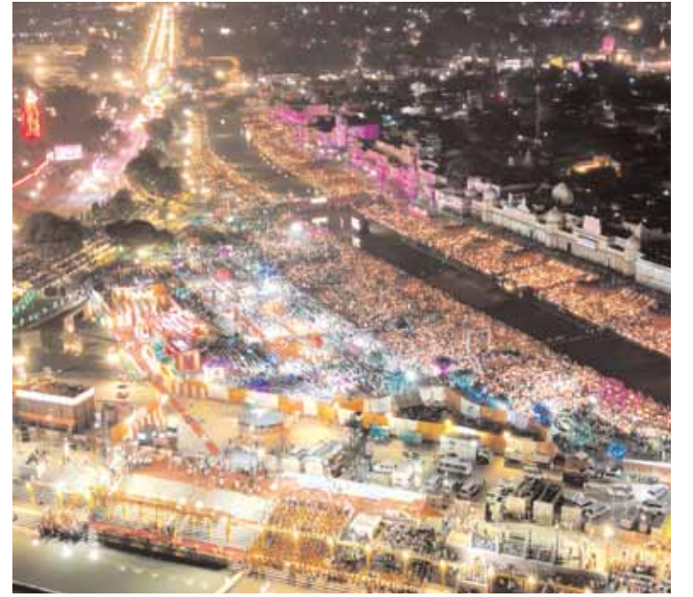
A top view of the banks of the Saryu River during 'Deepotsav 2024' on the eve of the 'Diwali' festival, in Ayodhya.