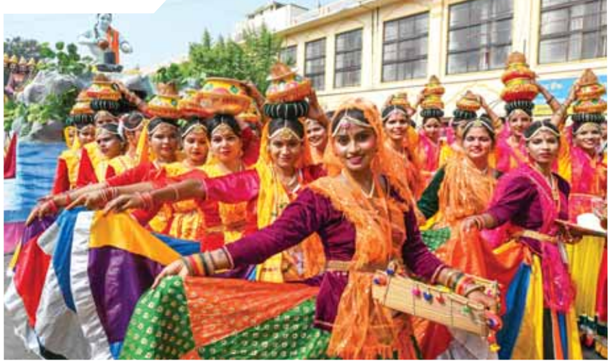
Artists dance on the Rampath ahead of Deepotsav celebrations, in Ayodhya