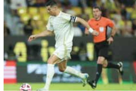
behind leader Al-Hilal after eight games of the Saudi Pro League and have seven points from three games in the group stage of the Asian Champions League. "Technically we performed well but we couldn't win the game," Pioli said. "We feel disappointed to be out of the cup. But we still have two trophies to go for and we will give our best in them."