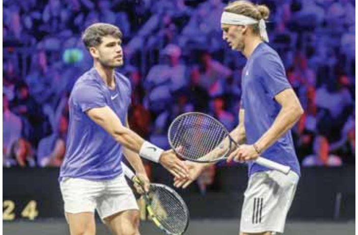
season-ending ATP Finals for the Turin, Italy, next month. Seventh-seeded Casper Ruud of Norway, a three-time Grand Slam runner-up, started well before losing 7-6 (3), 3-6, 6-4 to unseeded Australian Jordan Thompson.

AP ■ PARIS Carlos Alcaraz overcame some crusty moments on his serve to beat Nicolas Jarry 7-5, 6-1 and reach the third round of the Paris Masters. The second-seeded Spaniard was troubled by Jarry's strong forehand at times. The Chilean broke his serve in the ninth game and held for 5-5. But Jarry double-faulted in his next service game to lose the first set. "It was a little bit complicated, really happy to get through the first set," Alcaraz said. "I have to get used to the speed of the court. It's really fast for me." Alcaraz saved a break point in the third game of the second set with an ace and broke for a 4-1 lead with a crisp forehand winner.