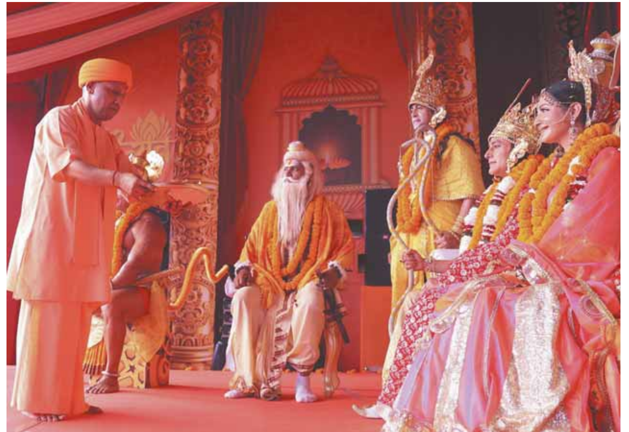
Uttar Pradesh Chief Minister Yogi Adityanath applies 'tilak' to the artistes dressed as Lord Rama, Lord Lakshmana and Goddess Sita and others during 'Deepotsav 2024' on the eve of the 'Diwali' festival, in Ayodhya and various events being held on the occasion (below)

each scene to life through skillful portrayals. Folk artistes enhanced the spectacle, engaging the audience with live narrations between tableaux. For this year's Ayodhya Deepotsav, Saket Mahavidyalaya crafted 18 stunning tableaux, 11 were prepared by the Information department and seven by the Tourism department. The Tourism department's tableaux beautifully depict scenes from the seven chapters of Tulsidas' 'Ramcharitmanas' - Bal Kand, Ayodhya Kand, Aranya Kand, Kishkindha Kand, Sundar Kand, Lanka Kand and Uttar Kand - bringing the essence of the Ramayana to life for devotees. The eighth Deepotsav included special displays illustrating key episodes in Shri Ram's life: from his education and marriage to Sita, the forest exile, Bharat Milap, Shabri's devotion, Ashok Vatika, Hanuman's journey to Lanka, Laxman's injury from Shakti arrow, Ravana's defeat, and the grand return to Ayodhya for Deepotsav.