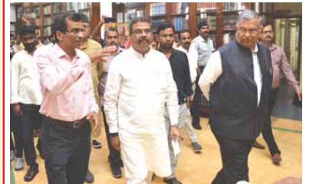
Union Education Minister Dharmendra Pradhan at BHU's Central Library in Varanasi on Monday.