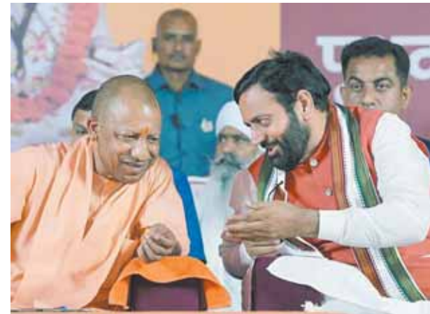
Kurukshetra: Haryana Chief Minister Nayab Singh Saini and Uttar Pradesh Chief Minister Yogi Adityanath during the 3-day Aatham, Batis Dhuni and Shankhadhal Bhandara, organized at Dera Siddh Baba Garib Nath Math, at Pehowa in Kurukshetra district, Haryana.

Yogi Adityanath explained that religion has two core objectives: 'abhyudaya' and 'nishreyas'. 'Abhyudaya' represents worldly progress, where one channels energy toward public welfare in alignment with individual capabilities, requiring wise decision-making. "For progress, we need good saints in the religious field and the right people in development efforts. Positive results stem from choosing virtuous individuals," he remarked. Praising the people of Haryana, Chief Minister Yogi Adityanath said, "The people