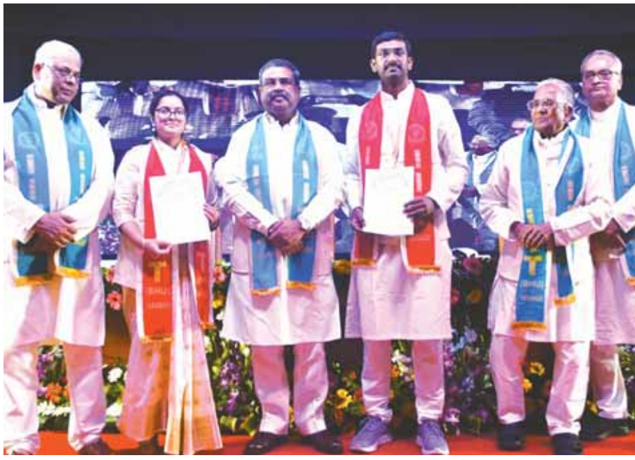
Union Education Minister Dharmendra Pradhan with meritorious students during the 13th convocation of Indian Institute of Technology (BHU) in Varanasi on Monday

Union Education Minister Dharmendra Pradhan said the 21st century is India's century. "In the fourth industrial revolution, India has a wonderful opportunity to lead the world's public welfare", he said while addressing the engineering graduates and others at the 13th convocation of Indian Institute of Technology (Banaras Hindu University) organised at Swatantrata Bhawan, BHU, here on Monday. Speaking as the chief guest, the education minister said he believed that the students of IIT (BHU) will fulfil their responsibility in this direction. "The kind of talent that IIT (BHU) has, I expect that our students will work towards becoming job providers more than job seekers", he said adding that the next 25 years are going to be the golden period of India's progress. "Destiny has written in our fate to become the number one economy in the world", Pradhan said, adding that the whole world is looking at India with great hope today. "The key to solving the world's problems lies in the indestructible Kashi and national institute like IIT (BHU). With their intellectual capacity, our students will fulfil the needs of India and the entire world", the education minister stated. According to him, Avinasi Kashi (Indestructible Kashi) is one of the few lively cities in the world. "Kashi is a confluence of India's philosophy and ancient languages like Pali, Prakrit,