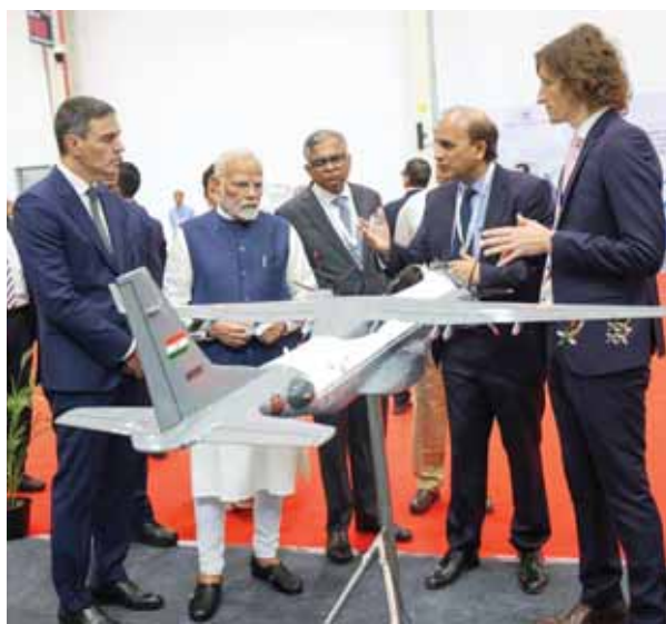
Prime Minister Narendra Modi and Spanish PM Pedro Sanchez being briefed about an aircraft as they visit the TATA Aircraft Complex after its inauguration, in Vadodara, Gujarat, Monday, October 28, 2024. Tata Sons Chairperson Natarajan Chandrasekaran is also seen

India on Monday set in motion the manufacture of C295, an ultra modern tactical transport aircraft which can carry troops and logistical supplies from main airfields to forward operating airfields of the country. The aircraft will be made in partnership with Spain, and can also operate on short unprepared airstrips as it is capable of Short Take-off and Landing (STOL). The aircraft can additionally be used for casualty or medical evacuation, performing special missions, disaster response and maritime patrol duties while it can operate from short airstrips just 2,200 feet long and can fly low-level operations for tactical missions flying at a low speed of 110 knots according to parent manufacturer Airbus. Prime Minister Narendra Modi and his Spanish counterpart Pedro Sanchez inaugurated the Tata Aircraft Complex in Vadodara, India's first private facility to build these military planes, where C295 aircraft will be produced. PM Modi and Spanish PM Pedro Sanchez on Monday inaugurated the Tata Aircraft Complex for manufacturing C295 aircraft in Vadodara. Noting that the partnership between India and Spain is finding a new direction, Modi said the project would not only strengthen the relations between the two nations but also give momentum to the mission of 'Make in India, Make for the World'. PM Modi conveyed his best wishes to the team of Airbus and Tata, and also paid tributes to the late Ratan Tata. The Airbus C295 is a medium tactical transport aircraft that