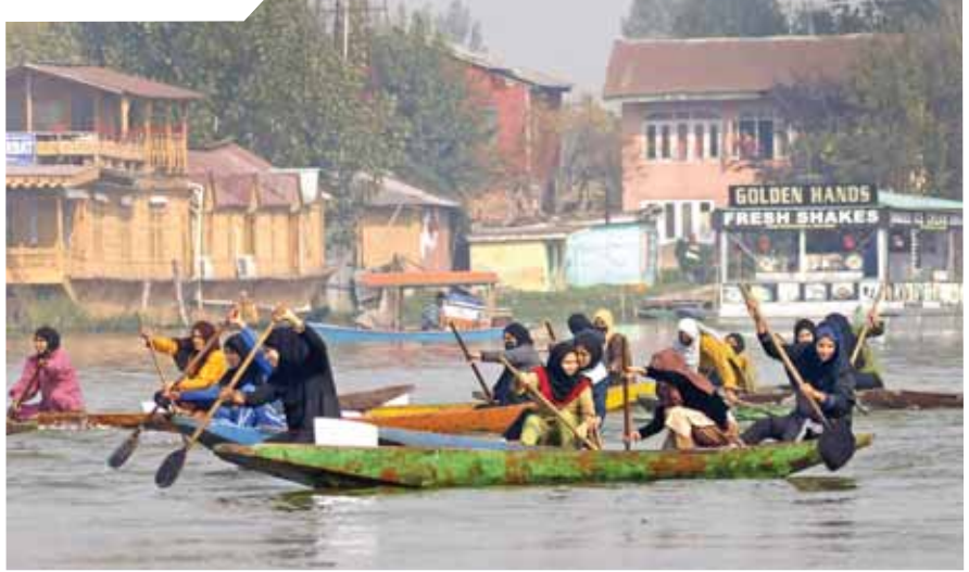
Women compete in a boat race at the Dal Lake, in Srinagar