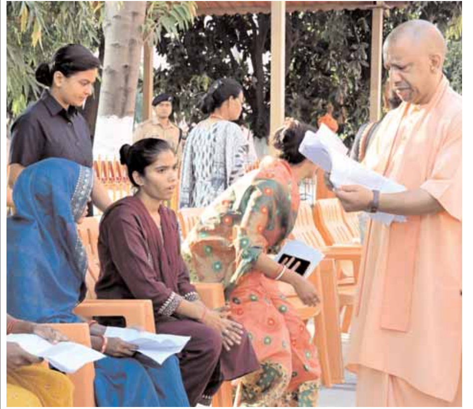
Chief Minister Yogi Adityanath during Janata Darshan held in front of the Mahant Digvijaynath Smriti Bhawan on Gorakhnath temple premises on Sunday

During the Janata Darshan, Chief Minister Yogi warmly interacted with young children accompanying some women, affectionately handing out chocolates to them.