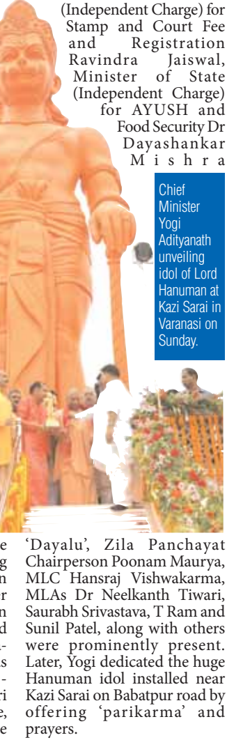
Chief Minister Yogi Adityanath unveiling idol of Lord Hanuman at Kazi Sarai in Varanasi on Sunday.