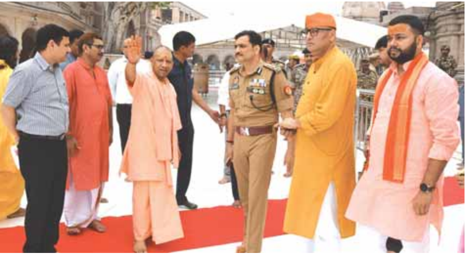
CM Yogi Adityanath giving instructions to administrative and police officers at KVC in Varanasi on Sunday.