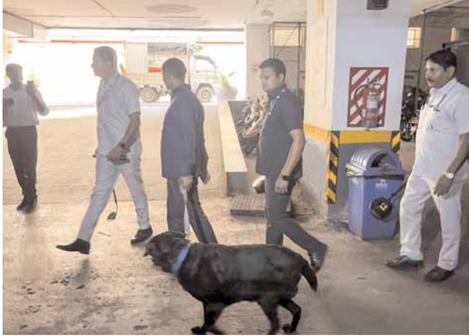
Bomb disposal squad at a hotel that received bomb threats via email, in Hazratganj area of Lucknow, on Sunday