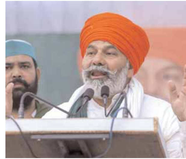
Bharatiya Kisan Union leader Rakesh Tikait addresses the Kisan Majdoor Mahapanchayat, in Prayagraj on Sunday

Amidst reports of a threat to Bollywood star Salman Khan's life from the Lawrence Bishnoi gang, Bharatiya Kisan Union (BKU) leader Rakesh Tikait on Sunday said the actor should apologise to the Bishnoi community because if a dispute is resolved by apologising, then there is nothing wrong in it. Tikait, who was here to take part in a farmers' 'Mahapanchayat', said this while replying to a reporter's question on jailed gangster Lawrence Bishnoi. "If any dispute ends by apologising to the Bishnoi community, then what is wrong in it? If a mistake has been made knowingly or unknowingly, then what does Salman Khan lose in apologising?" the farmer leader asked. He also alleged that the Uttar Pradesh government, which had promised free electricity to farmers, has started installing meters in their fields. "We do not know how free electricity will come from the meters," he said while talking to reporters after the "Kisan Mahapanchayat" held at Mundera here. "If meters are to be installed, then they (BJP) will have to bring it in their manifesto before the 2027 (Uttar Pradesh) Assembly polls. Otherwise a meter will not be installed in a farmer's field," Tikait said. Regarding the price of paddy, he alleged that the crop is being procured from farmers in Purvanchal's Jaunpur, Mirzapur and Ballia at the rate of Rs 1,200 per quintal. "The same is the case with