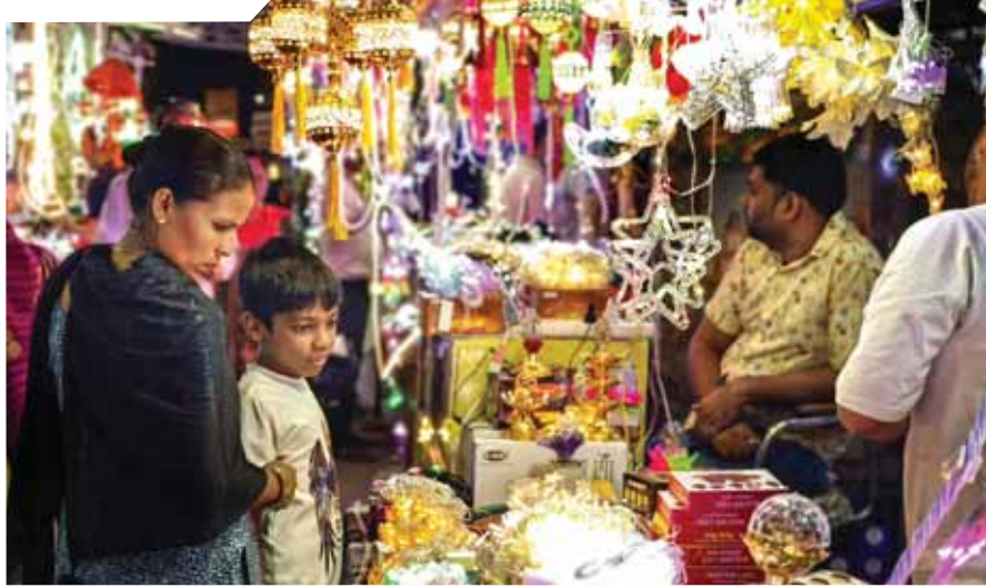
People buy decorative items at a market ahead of the Diwali festival, in Amritsar