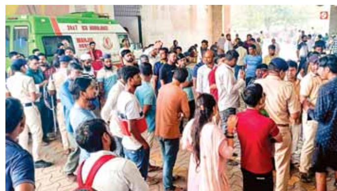
Police personnel, passengers and others at Bandra railway station after a stampede, in Mumbai, Sunday

At least 10 passengers were injured, two of whom severely, in a stampede that took place when scores of passengers rushed to board an unreserved compartment of the Gorakhpur-bound Antyodaya Express platform number-one of Bandra Terminus (BDTS) Railway Station in the small hours of Sunday. The incident took place at around 2.45 am, when the 22921 Antyodaya Express was slowly moving onto platform no 1 from the yard to head to Gorakhpur. A large number of passengers made headway into one of the unreserved compartments, leading to utter chaos and consequent stampede. "On 27.10.2024 at about 02.45 hrs, passenger train number 22921 Antyodaya Express was slowly being placed on platform number 01 from the BDTS yard, when some passengers present on the platform tried to board the moving train and 02 passengers fell and got injured," the Western Railway said in a statement issued here.