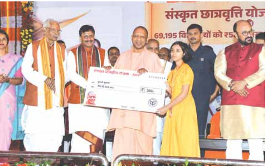
Chief Minister Yogi Adityanath giving scholarship to a Sanskrit student at SSU in Varanasi on Sunday.