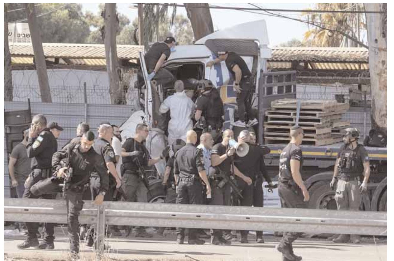
Israeli police climb on a truck that rammed into a bus stop near the headquarters of Israel's Mossad spy agency, wounding dozens of people, according to Israel's Magen David Adom rescue service in Tel Aviv, Israel, Sunday.

Ramat Hasharon (Israel) (AP) Protesters disrupted a speech by Israeli Prime Minister Benjamin Netanyahu at a ceremony Sunday remembering the victims of Hamas' attack on southern Israel last year. People shouted "Shame on you" and made a commotion, forcing Netanyahu to stop his speech shortly after it began. The major commemorative event is being broadcast live around the country. Many Israelis blame Netanyahu for the failures that led to Hamas' Oct 7, 2023, attack and hold him responsible for not yet bringing home the remaining hostages held by the militant group in Gaza.