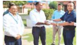
Winner Union office-bearer being felicitated at NTPC Auraiya.