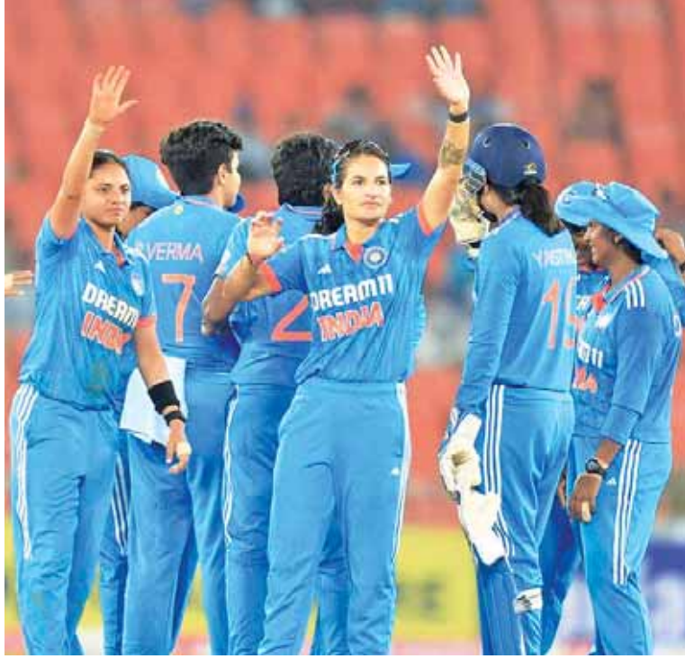
form in this format. On the other hand, New Zealand's severe blow as talismanic all-rounder Amelia Kerr was ruled out of the series with a left quadriceps muscle tear that