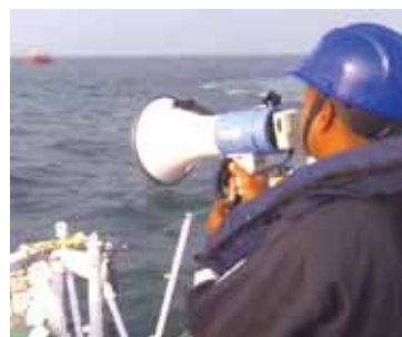
An Indian Coast Guard official during preparations ahead of the landfall of Cyclone Dana

As cyclone 'Dana' barrels toward the Odisha coast, threatening to impact nearly half the state's population, the government is racing against time to execute a massive evacuation plan aimed at relocating around 10 lakh people in 14 districts to safety.