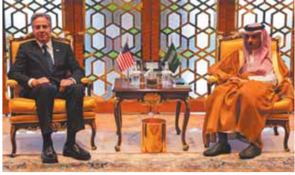
US Secretary of State Antony Blinken (left) meets Saudi Foreign Minister Prince Faisal bin Farhan in Riyadh, Saudi Arabia, on Wednesday.

Secretary of State Antony Blinken said Wednesday that Israel needs to pursue an "enduring strategic success" after its tactical victories against Hamas, urging it to seek a deal that would end the war in the Gaza Strip and bring back dozens of hostages. He spoke before travelling from Israel to Saudi Arabia on his 11th visit to the region since the outbreak of the war. Air raid sirens sounded in Tel Aviv shortly before his departure as Israel intercepted two projectiles fired from Lebanon, and a puff of smoke could be seen in the sky from Blinken's hotel. "Israel has achieved most of the strategic objectives when it comes to Gaza," Blinken told reporters before boarding his plane. "Now is the time to turn those successes into an enduring strategic success." "There really are two things left to do: Get the hostages home and bring the war to an end with an understanding of what will follow," he said. The United States sees a new opportunity to revive cease-fire efforts after the killing of top Hamas leader Yahya Sinwar by