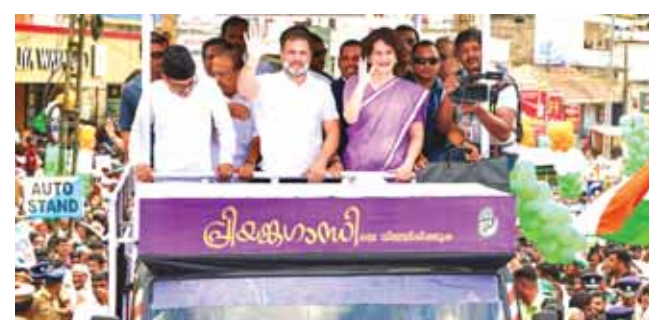
Congress leader and Leader of Opposition in Lok Sabha Rahul Gandhi with party leader and candidate from Wayanad constituency Priyanka Gandhi Vadra during a roadshow before filing her nomination for the upcoming Lok Sabha bypoll, in Wayanad, Kerala, Wednesday

Priyanka Gandhi Vadra commenced her electoral journey on Wednesday from Wayanad Lok Sabha constituency by filing her nomination papers for the by-election necessitated by the resignation of Rahul Gandhi, her brother who is also the Leader of the Opposition.