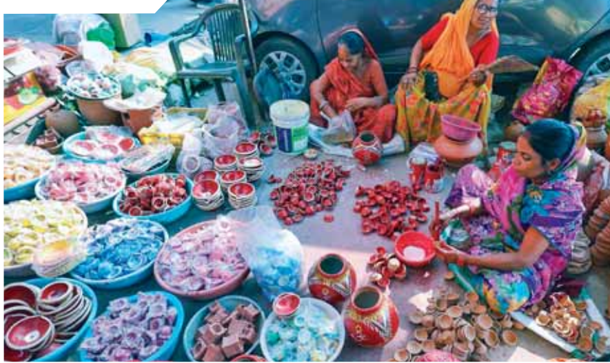
Women colour earthen lamps at a roadside shop ahead of the Diwali festival, in Jaipur