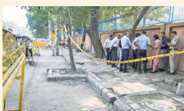
NIA and Delhi Police officials investigate at the site where a blast occurred on Sunday, near a CRPF school at Prashant Vihar, in Rohini area of New Delhi