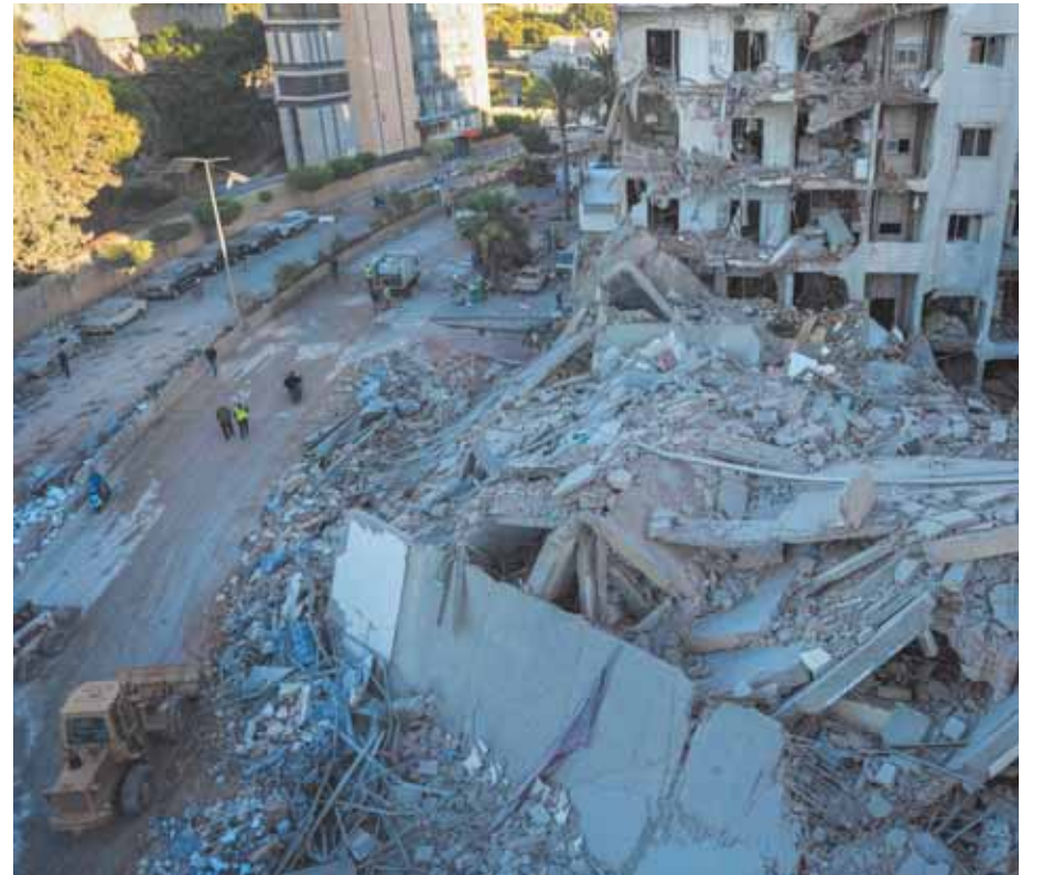
Rescue workers use a bulldozer to remove rubble of destroyed buildings at the site of an Israeli airstrike on Sunday night that hit several branches of the Hezbollah-run Qard al-Hassan Association in Beirut's southern suburb, Lebanon, on Monday.

urged Israel to scale back some strikes, especially in and around Beirut. In a separate development, the Israeli military apologised for a strike on Sunday in southern Lebanon that killed three Lebanese army soldiers. It said it targeted a vehicle in an area that Hezbollah had recently used for attacks without realising it belonged to the Lebanese military. The military said it is "not operating against the Lebanese Army and apologises for these unwanted circumstances". Lebanon's army is a respected institution within the country, but it is not powerful enough to impose its will on Hezbollah or defend Lebanon from Israel's invasion. The army has largely kept to the sidelines as Israel and Hezbollah have traded blows over the past year.