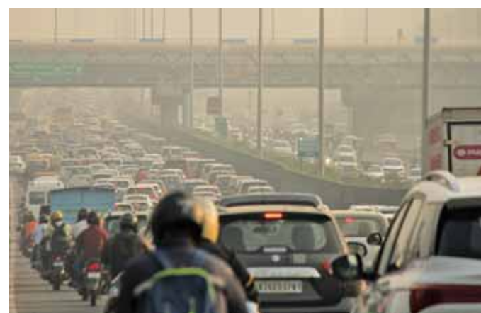
Heavy evening traffic moves amidst a blanket of smog, in Gurugram, Monday

These stretches are the busiest roads known for heavy traffic flow during the week. Lakhs of people commute in and from Delhi to Gurugram, Noida, Faridabad and Ghaziabad daily. Neighbouring Noida has been consistently contributing between 10 and 11 per cent to Delhi's pollution, while Ghaziabad's share ranges from 5 to 10 per cent, as per the DSS -