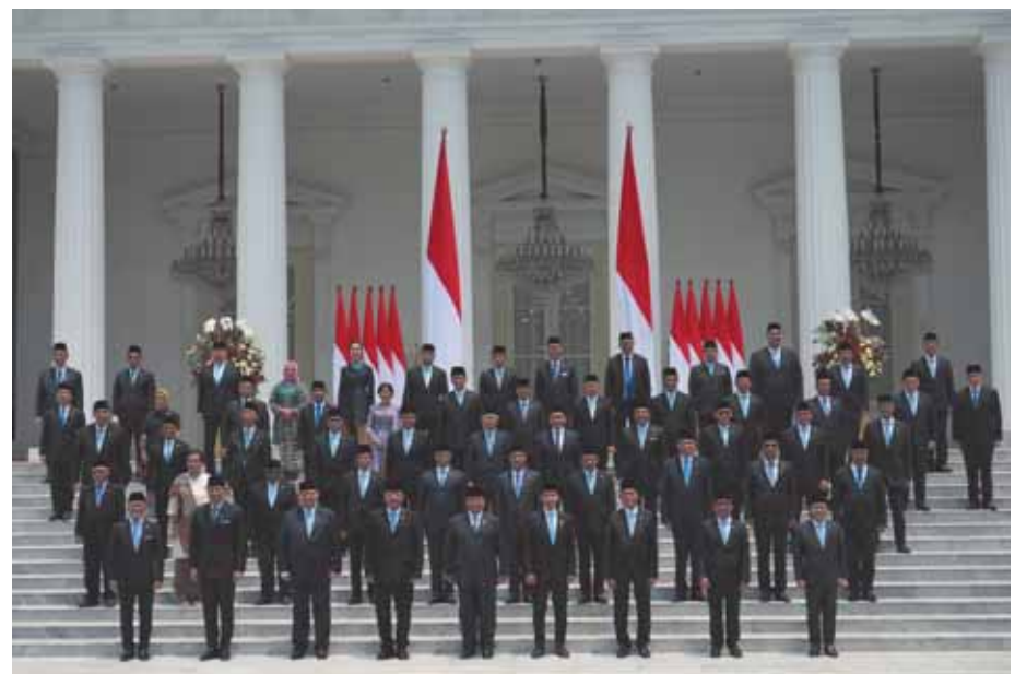
Indonesian President Prabowo Subianto, front centre, and Vice President Gibran Rakabuming Raka, front row fourth from right, pose for a group photo with newly-appointed cabinet ministers after their swearing-in ceremony at Merdeka Palace in Jakarta, Indonesia, on Monday.

Newly inaugurated President Prabowo Subianto swore in Indonesia's largest Cabinet since 1966 on Monday, with 109 members representing his pledge for a strong government. He announced the lineup late Sunday and named his Cabinet of ministers, vice ministers and head of national agencies the "Red and White Cabinet," referring to the colours of Indonesia's flag. Subianto became the eighth president of Southeast Asia's largest economy on Sunday. The Cabinet of Subianto's predecessor, Joko Widodo, had 34 ministers and head of government agencies. Subianto's Cabinet is the largest since 1966 when Indonesia's first President Sukarno formed a lineup of 132 ministers in an extremely tense political situation after a failed 1965 coup.