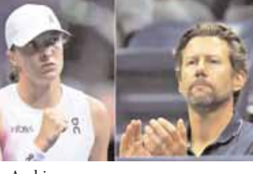
Arabia. "As you know, I'm preparing for the WTA Finals but my perspective is, as always, long-term, not short-term. I said many times that my career is a marathon for me, not a sprint, and I'm working, operating and making decisions with this approach," Swiatek wrote on Thursday. "I want to say that I'm very excited and looking forward to working with Wim. He seems to have a great attitude, vision and huge experience at a very top level of tennis. It's always crucial to try and get to know each other better but we're off to a good start and I can't wait to

Iga Swiatek is hiring Wim Fissette to be her new coach, announcing via social media that she is bringing aboard someone who has worked with a long list of top players that includes Naomi Osaka, Kim Clijsters and Victoria Azarenka. "I'm excited and motivated to start a new chapter," posted the No. 1-ranked Swiatek, who parted ways with Tomasz Wiktorowski two weeks ago after three years together. Swiatek hasn't competed since Sept. 4, when she lost in the U.S. Open quarterfinals to eventual runner-up Jessica Pegula. Since then, Swiatek withdrew from the China Open and Korea Open. Next up for Swiatek is the season-ending WTA Finals, which will be held in November in Riyadh, Saudi