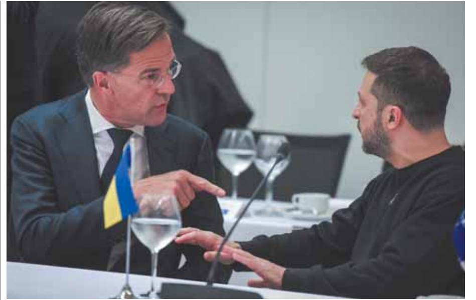
NATO Secretary General Mark Rutte (left) speaks with Ukraine's President Volodymyr Zelenskyy during the NATO-Ukraine Council working dinner at NATO Headquarters in Brussels on Thursday.