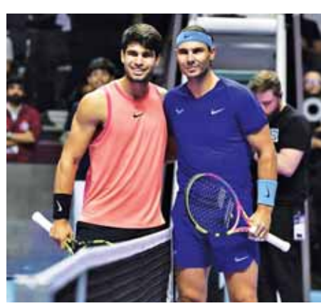
against an animal like him. But it was a positive match for me and I'm happy." Nadal will play Djokovic on Saturday in a third-place match before Sinner faces Alcaraz. The top-ranked Sinner was cleared in a doping case shortly before winning last month's U.S. Open, although the World Anti-Doping Agency has appealed that exoneration. Djokovic and Sinner met for real on Sunday, when the Italian won in straight sets for the Shanghai Masters title.

With an eye on the Davis Cup, Rafael Nadal said he was pleased with his performance despite losing 6-3, 6-3 to Carlos Alcaraz at the Six Kings Slam. Jannik Sinner beat Novak Djokovic 6-2, 6-7 (0), 6-4 in the other semifinal at the exhibition event that awards money but no ATP ranking points and is Saudi Arabia's latest foray into tennis. The match against Alcaraz was Nadal's first since he announced last week that he would be retiring after playing for Spain in the Davis Cup next month. Nadal and Alcaraz played doubles together at the Paris Games and could team up again for the Davis Cup. "I have the Davis Cup in front (of me) in a month so every day is an opportunity to be better and better and be ready for this final tournament of my tennis career," Nadal said. "I want to try my best to be ready for that and help the team in some way." Thursday's match was the first contest for Nadal since his exit at the Paris Olympics in July. "Carlos was too good. I haven't been on the competitive stage since a couple months ago," Nadal said. "So yeah I think it was a good performance, even if it was not enough to play