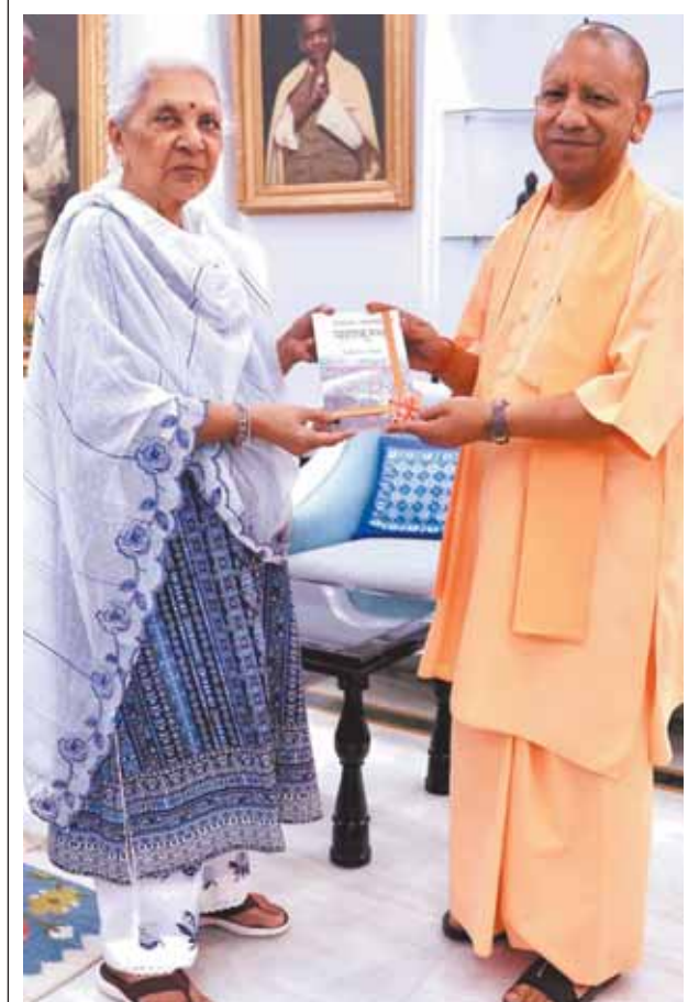
Chief Minister Yogi Adityanath called on Governor Anandiben in Lucknow on Friday and also presented her a book on the occasion.