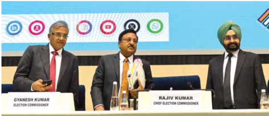
Chief Election Commissioner Rajiv Kumar with Election Commissioners Gyanesh Kumar and Sukhbir Singh Sandhu.