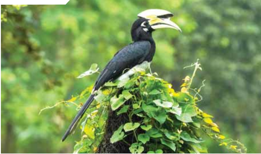
An oriental pied hornbill at Ponitara Wild Life Sanctuary, in Morigaon