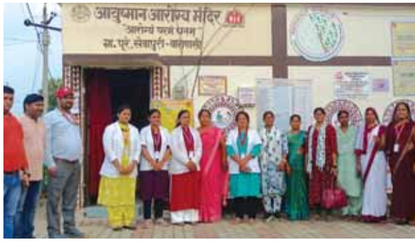
A Health and Wellness Centre of the district which got NQAS certificate.

The medical and health facilities are being continuously expanded and strengthened at the community level in Varanasi, the parliamentary constituency of Prime Minister Narendra Modi. Keeping in mind Arogyam Paramam Dhanam the reach of better health services is being increased in the community through Ayushman Arogya Mandirs (Health and Wellness Centres) being operated near home. Recently, the Government of India has given National Quality Assurance Standards (NQAS) certificate to seven Ayushman Arogya Mandirs (HWCs) of the district as which include Hathi Bazar, Pure and Kalkadham of Adarsh block Sewapuri, Mohansarai of Araziline, Raunakhard of Cholapur, Jalhapur of Chiraigaon and Garthama of Pindra block. Expressing happiness, Chief Medical Officer