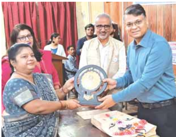
Speakers being felicitated at a motivational talk organised at Christ Church College on Tuesday.