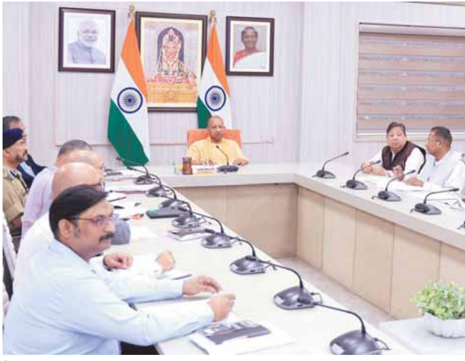
Chief Minister Yogi Adityanath in the meeting held in Lucknow to discuss measures to prevent food adulteration

He further noted that the law should prevent anti-social elements from adulterating food and beverages with harmful