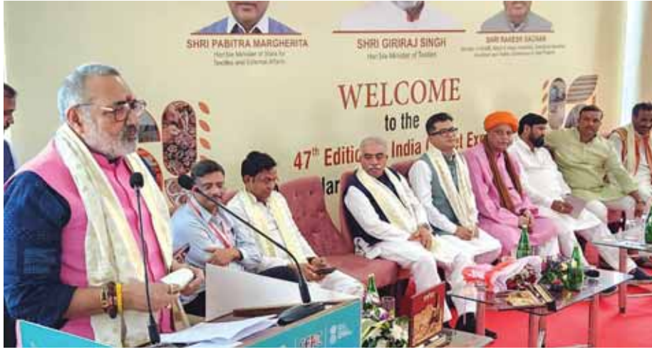
Union Textiles Minister Giriraj Singh addressing inaugural function of Carpet Expo at Bhadohi on Tuesday.

Union Textiles Minister Giriraj Singh said that the textile industry in India is expected to grow to US $ 350 billion by the year 2030 and there will be an unprecedented increase in employment. He was speaking during the inauguration of the 47th Carpet Expo Mart in Bhadohi on Tuesday. The minister said that as the Central government has set a target of export of 100 billion dollars by 2030, the role of carpet industry will be important in achieving this target. The four-day fair in Bhadohi is being organised by the Carpet Export Promotion Council (CEPC) in collaboration with the Ministry of Textiles, Minister of State for Textiles and External Affairs Pabitra Margherita and Uttar Pradesh Minister Rakesh Sachan were also present during the inauguration programme of the expo. Addressing the inaugural ceremony, Giriraj Singh said that at present the textile industry is worth $ 170 million, which will be brought to $ 350 billion by 2030. He said this increase in the Textile Ministry will require 20 lakh million tonne of yarn. "This will increase the demand for natural viscose