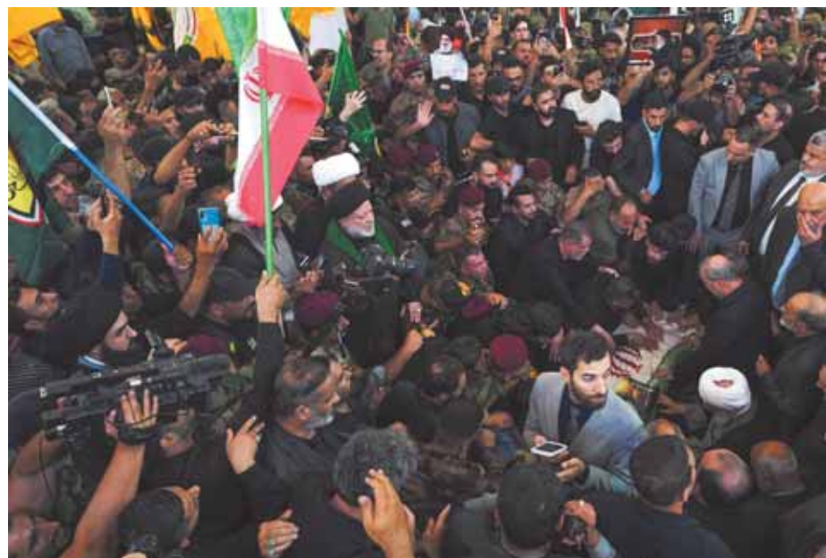
Mourners pray near the coffin of Iranian Revolutionary Guards' deputy commander Brigadier Gen. Abbas Nilforushan who died in an Israeli airstrike that killed Hezbollah leader Hassan Nasrallah in Beirut last month during his funeral in Karbala, Iraq.

In solidarity with Hamas, Lebanese militant group Hezbollah has exchanged cross-border fire with Israel almost daily for the past year. Israel escalated its campaign against the group in recent weeks.