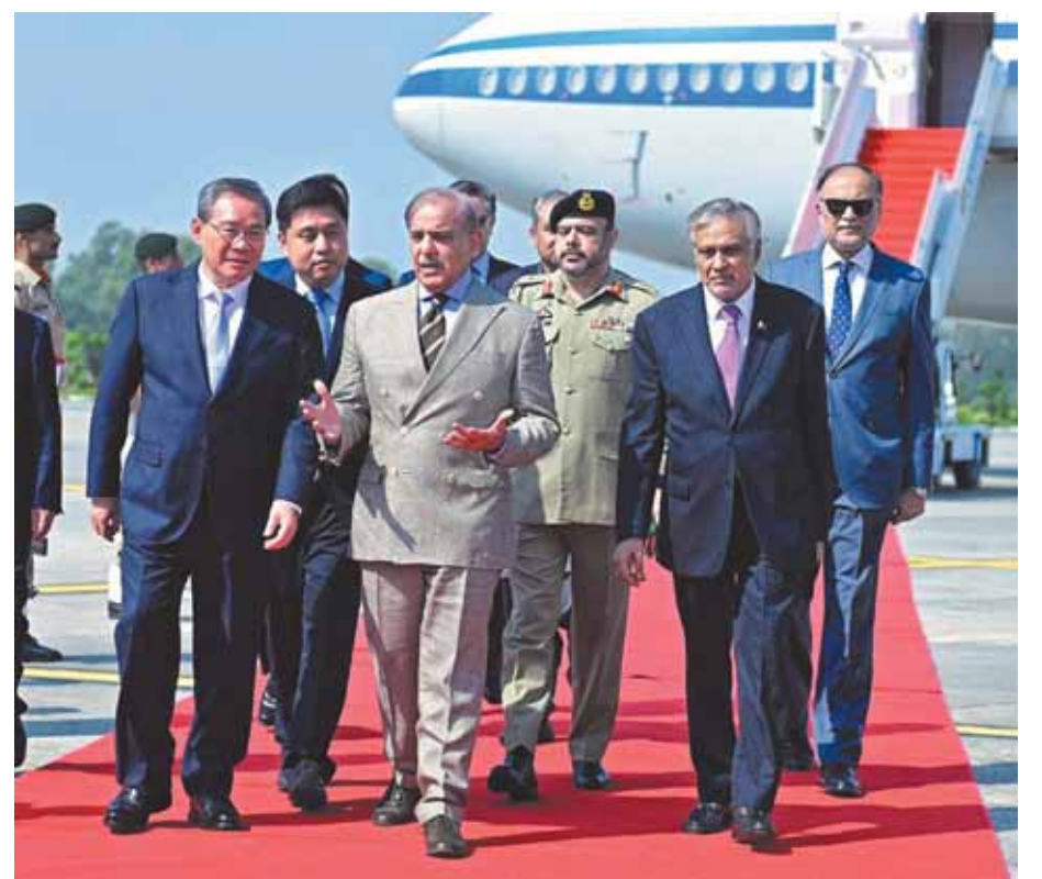
China's Premier Li Qiang (left) walks Pakistan's Prime Minister Shehbaz Sharif (second left) upon his arrival at an airbase in Rawalpindi, Pakistan on Monday.

Government (CHG) meeting of the Shanghai Cooperation Organisation (SCO) here to discuss the ongoing cooperation in economy, trade and environment. The CHG meeting will discuss ongoing cooperation in the fields of economy, trade, environment, socio-cultural linkages and review the performance of the Organisation. The leaders will adopt important organisational decisions to further enhance cooperation among SCO member States and approve the budget of the Organisation. Prime Minister Shehbaz Sharif, in his capacity as the current Chair of the CHG, will preside over the upcoming CHG meeting. According to the Foreign Office, the SCO member States will be represented by the Prime Ministers of China, Russia, Belarus, Kazakhstan, Kyrgyzstan, Tajikistan and Uzbekistan as well as the First Vice President of Iran apart from Jaishankar.