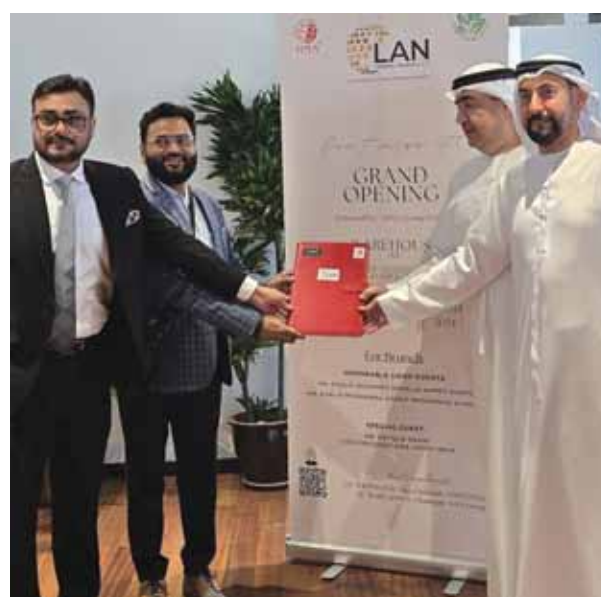
HMA Group India of Unnao entering into agreement with Dubai-based Snack Foodstuffs Trading LLC.