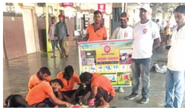
A contest being held at a station of Varanasi division of NER.