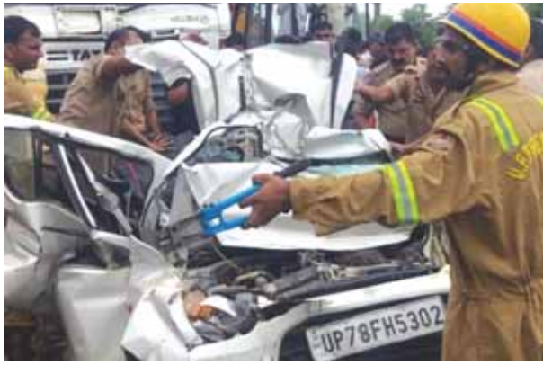
The damaged car after the accident on Monday morning

FARMER MURDERED: Following a dispute over tying buffalo on disputed land, a farmer was killed