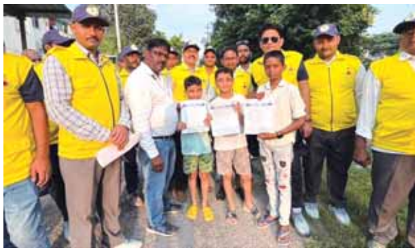
Cleanliness awareness drive being held at BLW in Varanasi on Monday.

Scouts and Guides distributed pamphlets in Western Colony, St John's Ambulance Brigade volunteers in Kakaramta Colony and Civil Defence Organisation in Kanchanpur