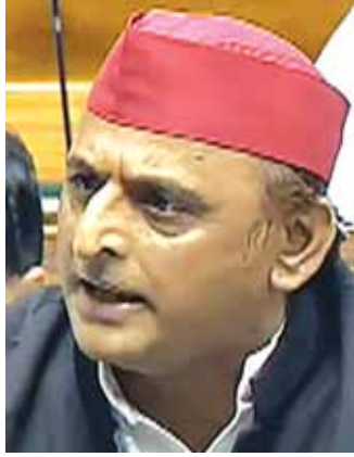
over the songs that were played on loudspeakers during the idol immersion on Sunday and said the government should have taken