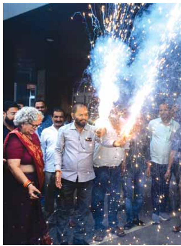
BJP workers in Kanpur burst crackers and dance as they celebrate the party's victory in Haryana Assembly poll on Tuesday. PTI