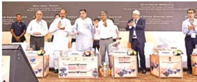
The Union Minister of Road Transport and Highways, Shri Nitin Gadkari launching the 'Humsafar Policy' 2024 at The Ashok Hotel, in New Delhi