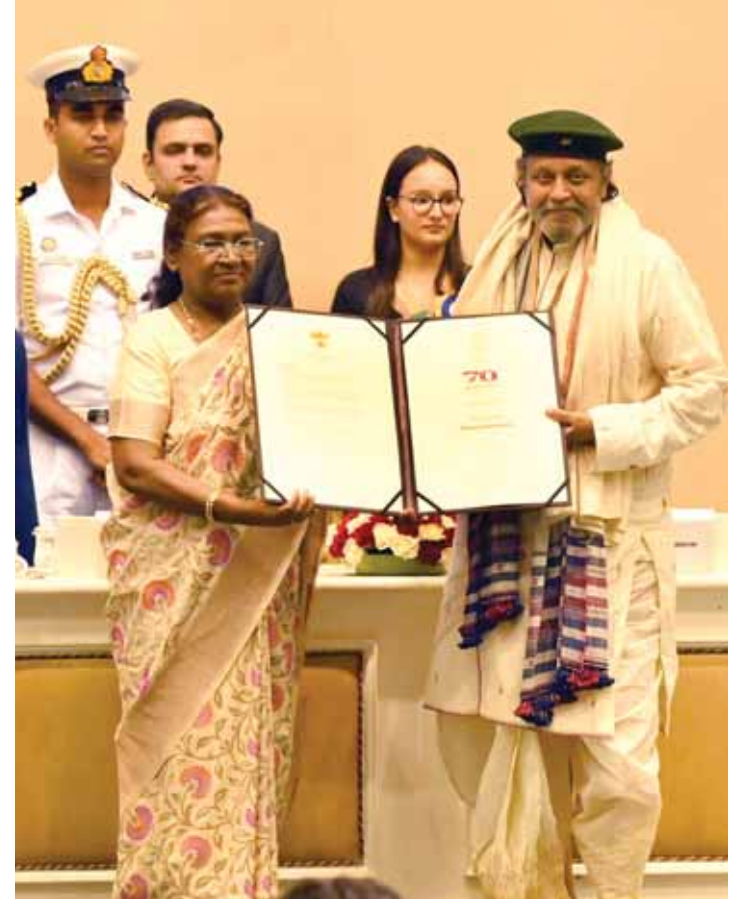
President Droupadi Murmu presents the Dadasaheb Phalke Award to veteran actor Mithun Chakraborty during the 70th National Film Award ceremony at Vigyan Bhawan, in New Delhi, Tuesday