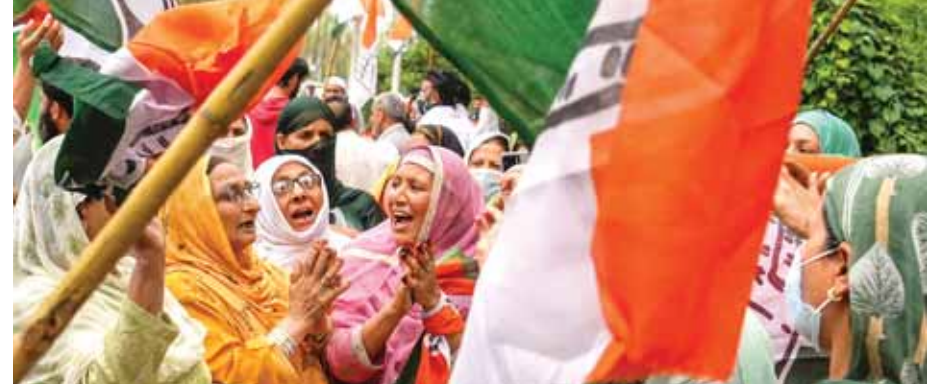
Supporters of Congress and National Conference (NC) celebrate as the Congress-NC alliance leads during the counting of votes of Jammu & Kashmir Assembly elections, in Srinagar, Tuesday

Bharatiya Janata Party (BJP), despite winning the highest tally of 29 Assembly seats in its strong bastion of Jammu, is left stranded staring at the prospect of occupying the Opposition benches. Meanwhile, J&K BJP Chief Ravindra Raina lost his seat in the Nowshera Assembly segment. He was defeated by Surinder Choudhary of the Jammu and Kashmir National Conference by a margin of over 7000 votes. The party won 10 out of 11