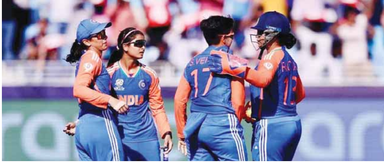
The Indian team relies heavily on Deepti Sharma in the spin department but she hasn't quite managed to hit her strides in the tournament so far. Young off-spinner Shreyanka

While Shafali scored just 2 and 32 in the first two games, Mandhana also fared poorly managing 12 and 7 runs. And it's time the duo fires in unison to ease the pressure on the middle-order. To make matters worse for India, skipper Harmanpreet Kaur, who scored 15 and 29 retired hurt, is doubtful for the match against Sri Lanka after suffering a neck injury while batting against Pakistan. The likes of Jemimah Rodrigues, Deepti Sharma and Richa Ghosh too need to step up with the bat and share the burden of responsibility. While medium pacer Arundhati Reddy sparked against Pakistan with the ball, returning with figures of 3/19, she would look for more support from the likes of fellow pace colleagues Renuka Singh and Pooja Vastrakar, who didn't play the previous game because of an injury.