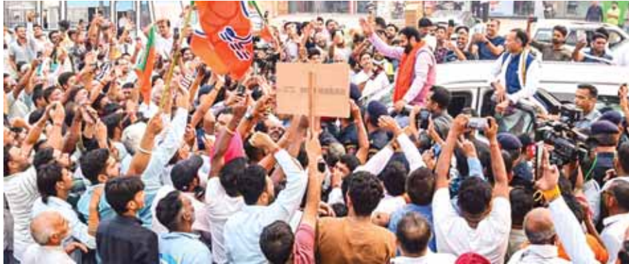
Haryana Chief Minister Nayab Singh Saini greets supporters after winning the Assembly elections from Ladwa constituency, at Ladwa, in Kurukshetra district, Tuesday

Among prominent candidates, Chief Minister Nayab Singh Saini, Congress leader Bhopinder Singh Hooda, and his new party colleague Vinesh Phogat won, as did Independent candidate Savitri Jindal. The INLD's Abhay