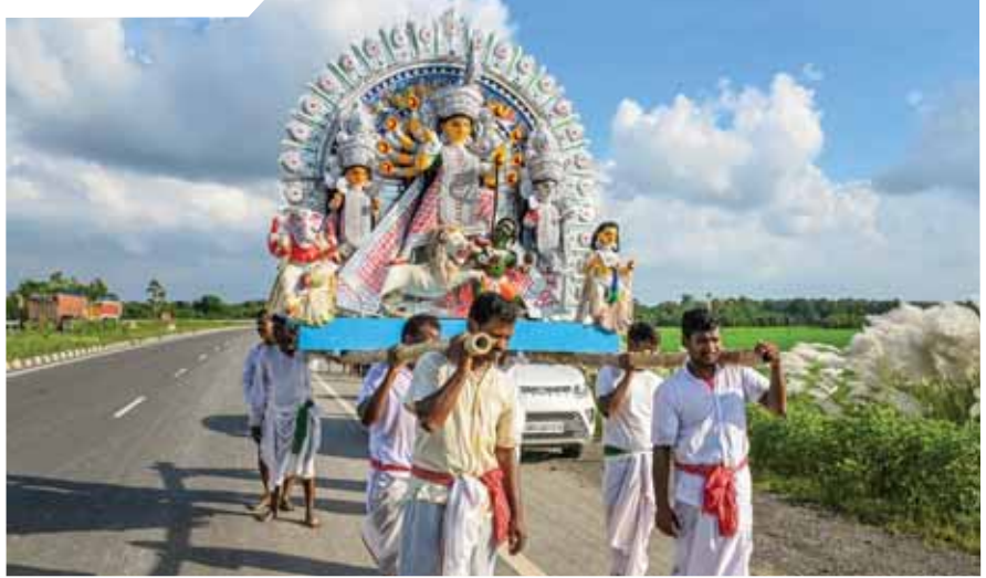
Devotees carry an idol of Goddess Durga to a puja venue, in Nadia