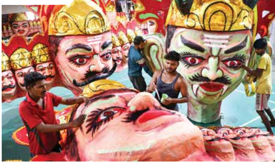
An artisan gives finishing touches to effigies of Ravana and Meghanad ahead of the Dussehra festival, in Nagpur