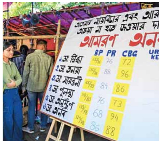
A chart shows medical parameters of some junior doctors protesting against the RG Kar Medical College and Hospital rape and murder incident, in Kolkata.