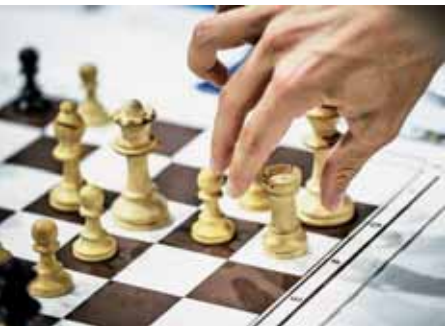
LONDON

PBG Alaskan Knights narrowly defeated Alpine SG Pipers with a 9-7 score to continue their unbeaten run at the Global Chess League here. Alaskan Knights won all their five of encounters after 15 matches, the halfway stage of the tournament.