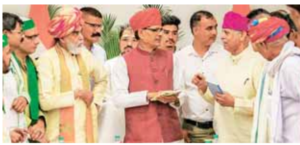
Union Minister for Agriculture and Farmers Welfare Shivraj Singh Chouhan during a meeting with farmers.