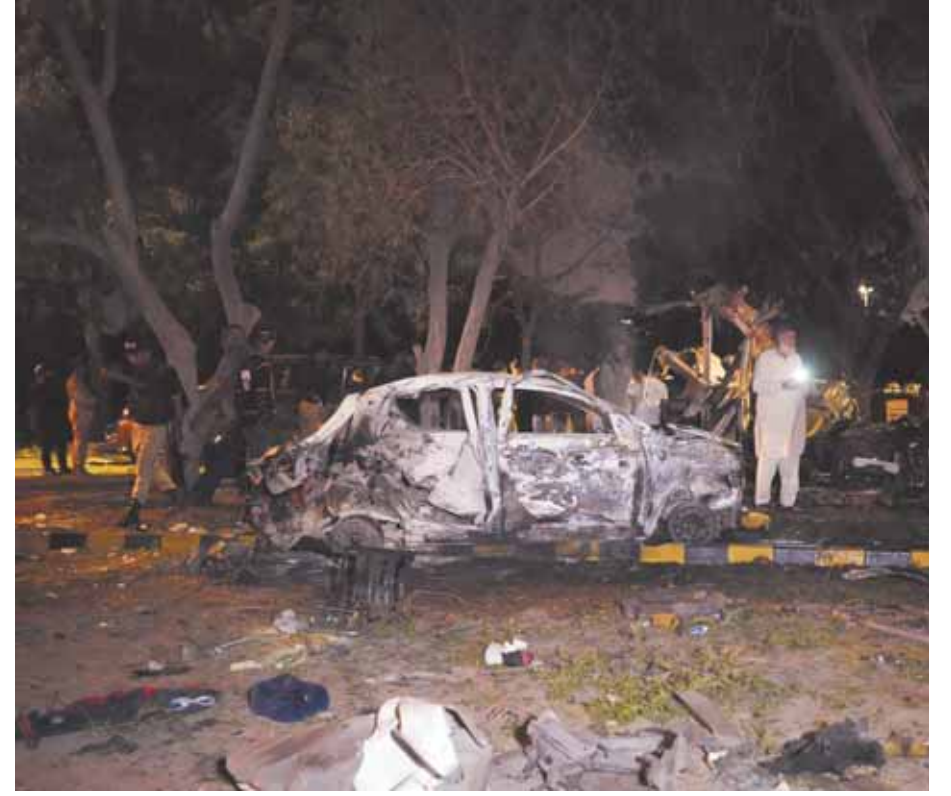
Security officials examine the site of an explosion that caused injuries and destroyed vehicles outside the Karachi airport, Pakistan, early Monday.

incident. Flight schedules at the airport are continuing as normal. Balochistan, bordering Iran and Afghanistan, is home to a long-running violent insurgency. Baloch insurgent groups have previously carried out several attacks targeting CPEC projects. The BLA accuses China and Islamabad of exploitation of the resource-rich province, a charge rejected by the authorities. It has fought a long-running insurgency for a separate homeland. The group in the last two years carried out similar suicide bomb attacks in Karachi targeting foreign nationals. The BLA in March this year claimed responsibility for an attack on a Pakistani naval air base near China-run Gwadar port. In April 2022, the group killed three Chinese tutors and a Pakistani driver in a suicide bombing near Karachi University's Confucius Institute. In November 2018, gunmen killed at least four people in an attack on the Chinese consulate in Karachi.