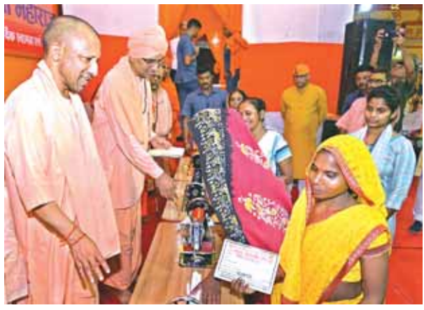
Chief Minister Yogi Adityanath distributes sewing machine to women during Durga Puja festival in Varanasi on Monday.

shopping complex etc. "Ensure fast progress in the construction work by removing the obstacles/hindrances coming in the construction of the ropeway", Yogi instructed the officers stressing on making a concrete action plan and starting the work by holding meetings with the heads of all the departments concerned for channelisation and other works of Varuna river. He instructed the police officers to run maximum awareness programmes to deal with cyber crimes in the district. For this, awareness pro-