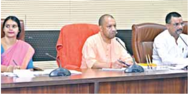
Chief Minister Yogi Adityanath reviewing progress of projects and law and order situation at the Circuit House in Varanasi on Monday.

"Ensure special cleanliness at idol immersion sites/ponds, repair roads and all proper arrangements. Ensure adequate security arrangements in view of festivals", he said, instructing Nagar Nigam, Varanasi Development Authority (VDA) and Electricity department to make proper arrangements for cleanliness, electricity supply etc and laid emphasis on making the city plastic free. Yogi directed the departmental officers and engineers of the implementing agencies to complete the ongoing projects with quality by running a campaign on a war footing. "Delay at any level in com-