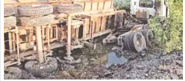
The overturned dumper after colliding with another dumper in Etawah

A dumper driver and a cleaner were killed when their vehicle collided with another dumper on Farrukhabad highway in Etawah late on Saturday night. Both the injured were taken to the Safai Institute of Medical Sciences where the doctors declared them dead. Reports said that around 2.30