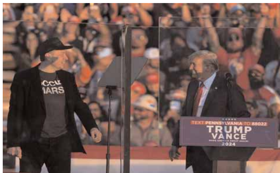
Elon Musk jumps on the stage behind Republican presidential nominee former President Donald Trump during a campaign rally at the Butler Farm Show, Saturday in Butler, Pa.

first one out, 22 candidates, and she never made it to Iowa. She quit before Iowa, and now she is running. And that is okay. But, you know, we spent USD 150 million beating Biden, and as soon as he was down and out for the count, they said, let us take him out. We will give somebody else to run. Never happened before," he said. "She is a person that rated even worse in every statistic than any other senator. She was rated at the bottom of the US Senate. She has destroyed everything she touched," Trump said. The former president said if elected, on the first day of his presidency, he would seal the border and stop the migrant invasion into the country. "We will begin the largest deportation operation in the history of the United States," he said, adding that 2024 is the most important election in the history of the country. "Here are the facts. My opponent, Kamala Harris, is the most incompetent and far-left nominee ever to run for pres-