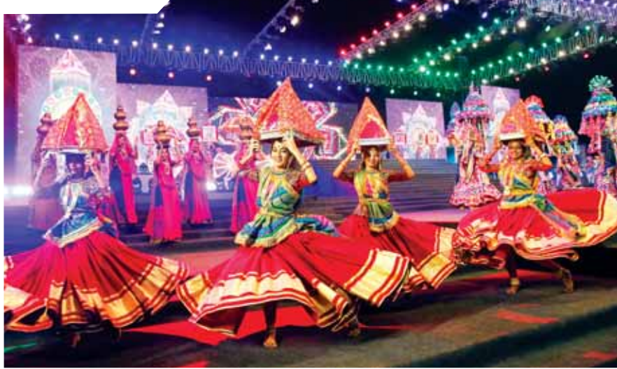
Artistes take part in 'Garba', in Ahmedabad