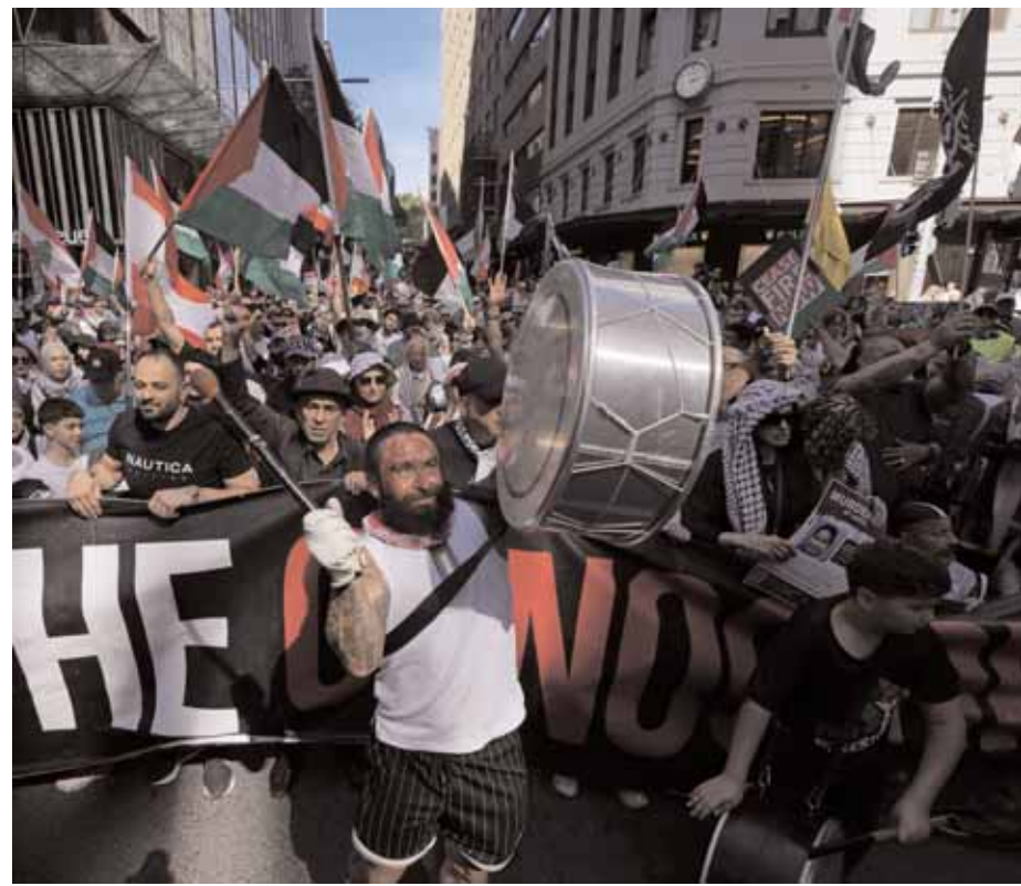
A man bangs a drum during a march as pro-Palestinian supporters rally in Sydney, Sunday.

eral other cities in the United States as well as in other parts of the world, including Denmark, Switzerland, South Africa and India. In the Philippines, dozens of left-wing activists protested near the U.S. Embassy in Manila, where police prevented them from getting closer to the seaside compound. Pro-Israeli demonstrations are expected to be held Sunday because Jews across the world are still observing Rosh Hashana, or the Jewish new year. This year, emotions will be high for many given that the midpoint of the 10 days spanning Rosh Hashana and Yom Kippur is Oct. 7 — the one-year anniversary of the Hamas attack that killed 1,200 Israelis and triggered the ongoing war in Gaza. Security forces in several countries warned of heightened levels of alert in major cities, amid concerns that the escalating conflict in the Middle East could inspire new terror attacks in Europe or that the protests could turn violent.