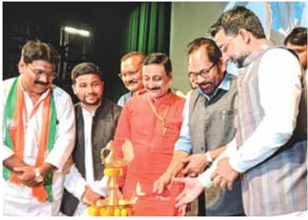
Ex-Union Minister MA Naqvi inaugurating BJP membership campaign of Minority Morcha in Varanasi on Sunday.

Former Union Minister Mukhtar Abbas Naqvi said that 'allergy' to Bharatiya Janata Party (BJP) becomes the energy of the opposition but Muslims do not get any benefit from it because Congress and Samajwadi Party (SP) consider Muslims only as vote bank and use them for their political benefits. While addressing the gathering at the BJP membership campaign conference-2024 organised by BJP Minority Morcha at Rudraksh Convention Centre in Sigra area here on Sunday, Naqvi said that today the whole world is trusting the efficient leadership of Prime Minister Narendra Modi but the opposition is instigating the Muslims of India against PM. He said the Modi government never discriminated against the Muslim community and the maximum benefits of all the schemes of the central and state governments were given to the Muslims. "Since the Muslim community is a large section, the SP and Congress work to provoke and mislead them whereas the truth is that