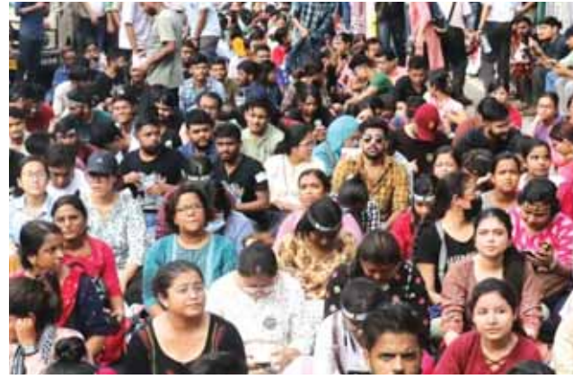
Representative file photo

Der lokkho taka nin aar kete poron (Have Rs 1.5 lakh and get lost). That is what the parents of a rape victim was told by the cops of Narendrapur Police Station in South 24 Parganas after the girl committed suicide failing to bear the ignominy and harassment of her parents who ran from pillar to post spending Rs 9 lakh for two years to get justice. All this while, the rapists who roamed freely — after obtaining bail — threatened the victim's family and even got her house robbed when they did not withdraw their complaints. The police simply looked the other way. The teenager was raped in 2020 and she ended her life in 2022 as her parents failed to get her justice. The incident — dating back two years — that was nearly dead and forgotten suddenly rematerialised on Saturday after an 11-year-old girl was raped and murdered at Mahishmari village in Joynagar sub-division once again in South 24 Parganas district. Not wholly out of coincidence perhaps, the Saturday's victim and the previous one who committed suicide happened to be first cousins. "We have no security ... is this the price of being born a girl in