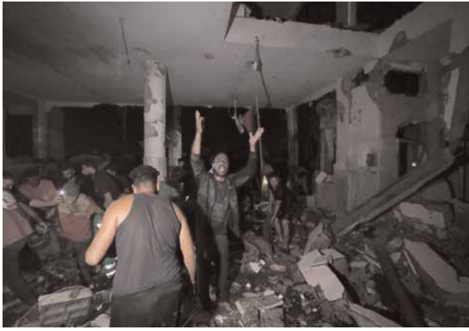
Palestinians search for survivors and bodies in the rubble of a mosque destroyed in an Israeli airstrike in Deir al-Balah, Sunday.

An Israeli strike on a mosque in the Gaza Strip early Sunday killed at least 19 people, Palestinian officials said, as Israel intensified its bombardment of northern Gaza and southern Beirut in a widening war with Iran-allied militant groups across the region. Displaced people were sheltering at the mosque that was struck near the main hospital in the central town of Deir al-Balah. A further four people were killed in a strike on a school sheltering displaced people near the town. The Israeli military said both strikes targeted militants, without providing evidence. An Associated Press journalist counted the bodies at the Al-Aqsa Martyrs Hospital morgue. Hospital records showed that the dead from the strike on the mosque were all men.