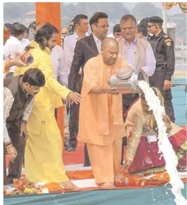
Chief Minister Yogi Adityanath performs 'Ganga puja' during his visit to review preparations for the Maha Kumbh Mela 2025 in Prayagraj on Sunday.

Chief Minister Yogi Adityanath, on Sunday, said that preparations for the Maha Kumbh-2025 were in full swing, with projects exceeding Rs 5,600 crore aimed at transforming Prayagraj into a grand and beautiful destination. The previous Kumbh in 2019 attracted around 25 crore devotees from across the globe, participating in this significant spiritual and cultural event. Diplomats from nearly 100 countries also joined the festivities, gaining insights into India's rich spiritual heritage. Addressing the journalists and taking stock of the preparations, the Chief Minister said, "Various departments are working diligently to ensure that the upcoming Maha Kumbh-2025 is a spectacular success, showcasing the divine and innovative essence of this age-old tradition." Yogi said that the officials had been instructed to complete the preparations within the stipulated time frame. Chief Minister Yogi