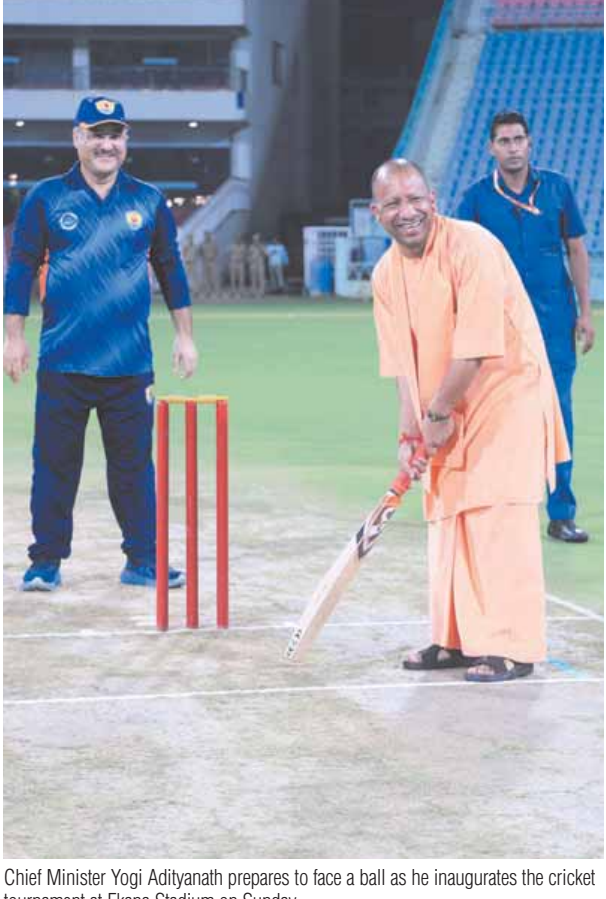
Chief Minister Yogi Adityanath prepares to face a ball as he inaugurates the cricket tournament at Ekana Stadium on Sunday.

Lucknow (PNS): Chief Minister Yogi Adityanath inaugurated the 36th All India Advocate Cricket Tournament at Atal Bihari Vajpayee Ekana Stadium in Lucknow on Sunday. He emphasised the importance of team spirit in sports, stating that collaboration enhances success. Yogi noted that both victories and defeats motivate progress, with defeats offering valuable lessons. He announced an increase in the advocate welfare corpus fund from Rs 300 crore to Rs 500 crore and raised compensation for families of deceased advocates from Rs 1.5 lakh to Rs 5 lakh. The government has disbursed Rs 134 crore in welfare funds to these families. The CM unveiled the tournament trophy and distributed kits to team captains. He encouraged participation from both the bench and the bar and discussed the motivational role of sports, citing recent successes of Indian athletes. Yogi also urged the inclusion of women advocates in future tournaments.