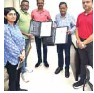
NTPC Auraiya signs MoU with Om Sai Brahm Baba Trust, Lucknow.

The NTPC Auraiya signed a MoU with Om Sai Brahm Baba Trust, Lucknow to launch a beautician course aimed at empowering the youth from project-affected villages. This initiative, part of NTPC Auraiya's CSR efforts, seeks to