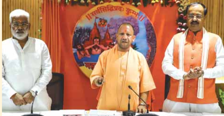
Uttar Pradesh Chief Minister Yogi Adityanath with Deputy CM Keshav Prasad Maurya unveils the logo of 'Mahakumbh Prayagraj 2025' during a meeting in Prayagraj.

Chief Minister Yogi Adityanath unveiled the new multi-coloured logo of Maha Kumbh 2025 in Prayagraj on Sunday. The logo symbolises religious and economic prosperity, with the depiction of the Amrit Kalash, a sacred vessel from the mythological ocean churning. The design features a temple, a seer, an urn, the Akshayvat tree, and an image of Lord Hanuman, representing the confluence of nature and humanity in the Sanatan civilisation. It also embodies the continuous flow of self-awareness and public welfare, serving as an inspirational emblem of Maha Kumbh 2025. Kumbh Mela, recognised by UNESCO as an 'Intangible Cultural Heritage of Humanity', is regarded as the world's largest peaceful gathering of pilgrims. With the motto "Sarvasiddhipradah Kumbhah" (Kumbh bestows all types of spiritual powers), the Maha Kumbh stands as a profound symbol of spiritual significance. The logo of Maha Kumbh, one of the largest festivals globally, has been crafted to reflect its diverse and far-reaching impact, capturing both its spiritual essence and cultural grandeur. Sadhus and saints from all sects across the country participate in the Maha Kumbh in large numbers, symbolised in the logo by a sadhu blowing a conch. Additionally,