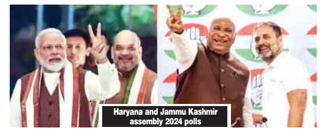
Haryana and Jammu Kashmir assembly 2024 polls

With Haryana and Jammu and Kashmir polls becoming crucial and a matter of prestige for both the major political parties — BJP and Congress — the duo soon after the Exit Poll predictions huddled for the Government formation in both the places with 90 members of Assembly each. While Congress exuded confidence and rallied behind the exit polls saying they shall better the mark even more, BJP which is in power in Haryana for last 10 years rejected exit poll predictions. BJP, Congress, the INLD-BSP and the JJP-Azad Samaj Party alliances, and the Aam Aadmi Party are the key poll contestants. However, a direct fight between the ruling BJP and Congress was expected in most seats. Haryana Chief Minister Nayab Singh Saini claimed his party BJP will form the Government in the state with full majority for a third time when the results are announced on October 8. Congress will blame the Electronic Voting Machines (EVMs) for their defeat, he said, attacking the opposition party, which is ahead in the race, according to most exit polls. Former Haryana Chief Minister Bhupinder Singh Hooda said he was expecting a