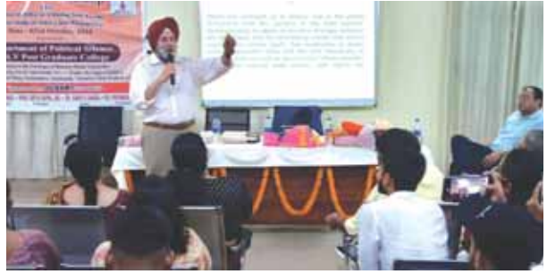
Former diplomat MS Puri addressing a seminar on G-20 at DAV College in Varanasi