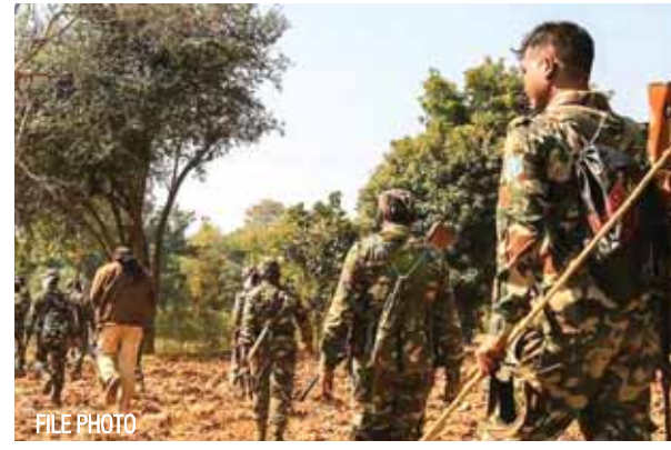
■ DANTEWADA/NEW DELHI

In the largest such operation in Chhattisgarh's 24-year history, at least 30 Maoists were gunned down in an encounter with security forces in Abujmahad, Dantewada district, on Friday. The gunfight broke out at around 1 pm in the forest between Thulthuli and Nendur villages in Abujmahad on the Narayanpur-Dantewada inter-district border, when a joint team of security personnel was out on anti-Naxal operation. According to the police, the Districts Reserve Guards (DRG) from Dantewada and Narayanpur, acting on specific intelligence inputs on the presence of Maoists in the area, set out on an operation from different police camps. The DRG is a specialised force that includes Maoists who have