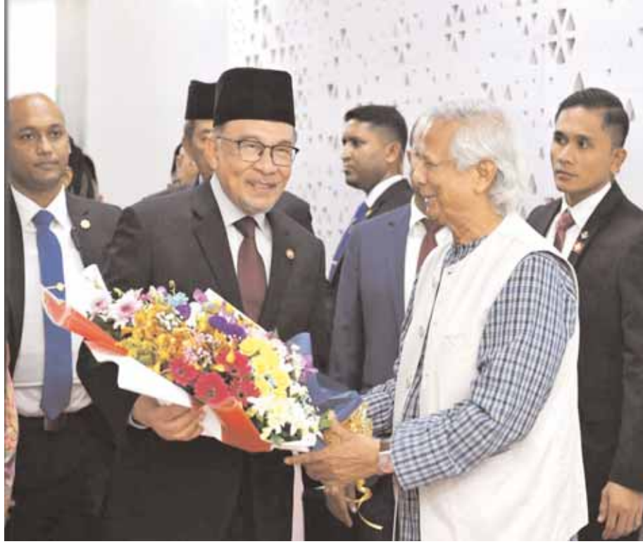
This photo provided by Bangladesh Press Information Department shows Malaysian Prime Minister Anwar Ibrahim, left, speaking with Bangladesh's interim leader Muhammad Yunus, in Dhaka, Bangladesh, Friday. AP/PTI

Bangladesh is eager to increase its trade with that region. Bangladesh is also pursuing a policy of increasingly involving ASEAN in resolving the Rohingya refugee crisis. More than 1 million Rohingya refugees from Myanmar live in camps in Bangladesh. Bangladesh was Malaysia's second-largest trading partner in South Asia in 2023, with total trade reaching $2.78 billion, according to official figures. Malaysia is also one of the leading destinations for Bangladeshi migrant workers. About 800,000 Bangladeshi workers are employed as low-skilled workers in Malaysia's construction, manufacturing, plantation and services sectors. But the recruiting process is often corrupt, and allegations of rights violations by Malaysian employers and Bangladeshi recruiting agencies are rampant. More than 6,000 Bangladeshi students study at Malaysian higher education institutions, according to 2023 figures.