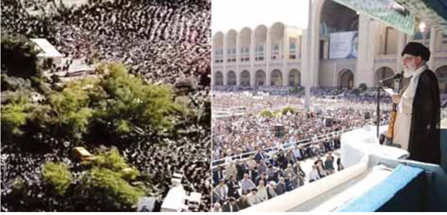
■ TEHRAN/ BEIRUT

Iran's supreme leader on Friday praised the country's recent missile strike on Israel and said it was ready to do it again if necessary, state TV reported. Ayatollah Ali Khamenei, in his first appearance as leader, in about five years, at Friday prayers, called the missile strike a "shining" job by Iran's armed forces. On the other hand Israel carried out a series of massive airstrikes overnight, hitting suburbs of Beirut and cutting off the main border crossing between Lebanon and Syria for tens of thousands of people fleeing Israeli bombardment. The Israeli military said Friday