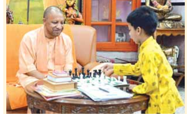
Chief Minister Yogi Adityanath plays chess with country's youngest FIDE rated player 'Little Champ' Kushagra Aggarwal during a meeting in Gorakhpur.