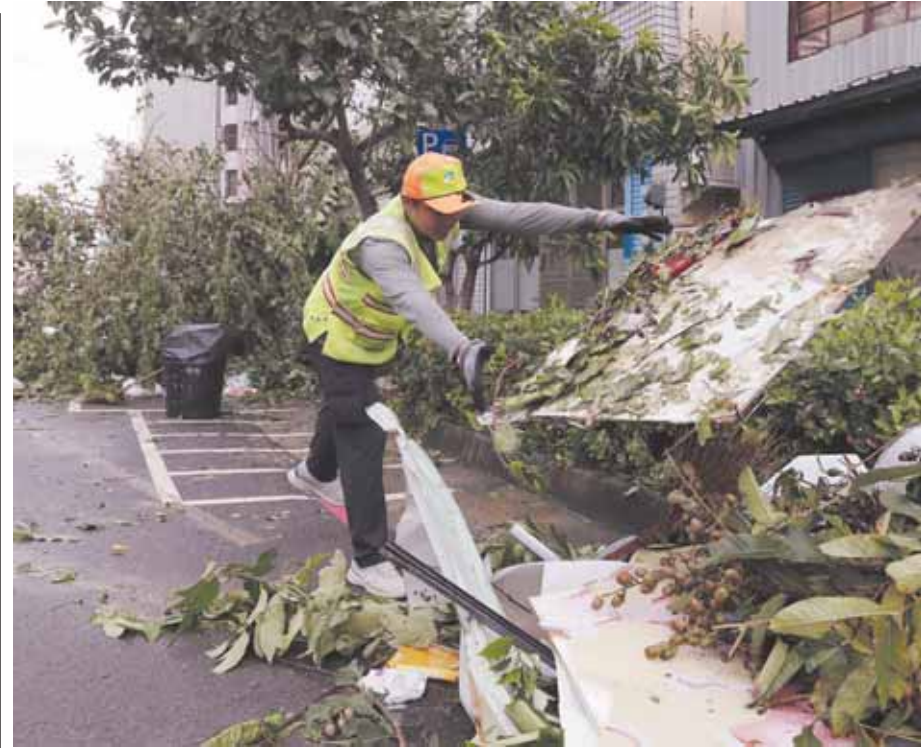
A sanitation worker of Kaohsiung city government clears debris in the aftermath of Typhoon Krathon in Kaohsiung, southern Taiwan, Friday.

electric cars jumped from 3.9% of the EV market in 2020 to 25% by September 2023, in part by unfairly undercutting EU industry prices. Brussels says companies in China accomplished that with the help of subsidies across the production chain. They ran from cheap land for factories from local governments to below-market supplies of lithium and batteries from state-owned enterprises to tax breaks and easy financing from state-controlled banks. The rapid growth in market share has sparked fears that Chinese cars will eventually threaten the EU's ability to produce its own green technology to combat climate change, as well as the jobs of 2.5 million auto industry workers and 10.3 million more people whose jobs depend indirectly on EV production.