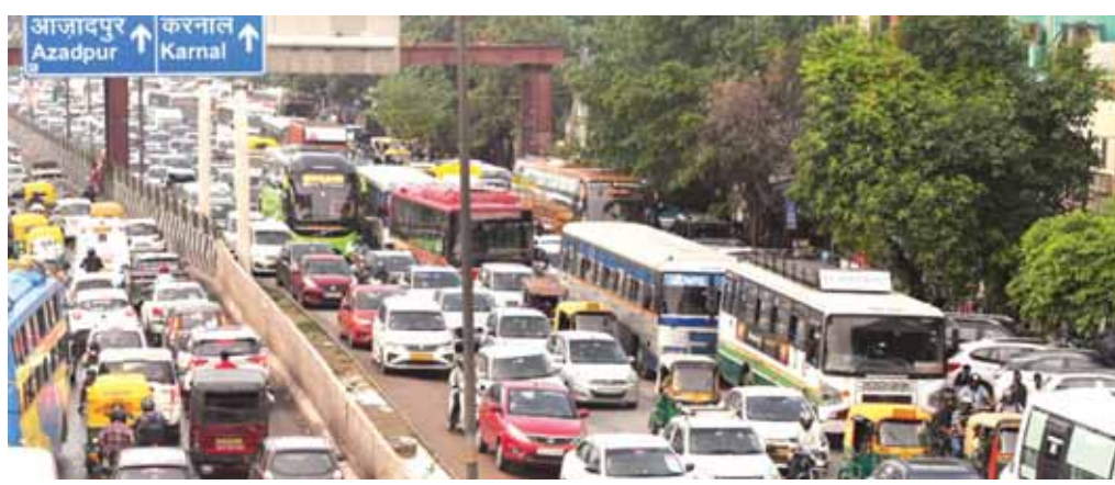
A Traffic Jam Vehicles move on road at isbt kashmiri gate