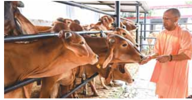
Chief Minister Yogi Adityanath feeds cows at a cowshed in Gorakhpur on Friday.

Darshan, CM Yogi Adityanath directed officials to approach every grievance with sensitivity and ensure prompt and satisfactory resolutions. He emphasised that no negligence would be tolerated in handling these issues. The CM further stated that strict legal action must be taken against anyone indulging in land encroachment or harassment, ensuring that the concerns of every victim are addressed impartially and resolved to their satisfaction. On Friday morning, while visiting the Gorakhnath temple complex, CM Yogi