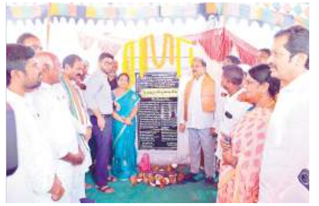
Agriculture Minister Tumma Nageswara Rao laying the foundation stone for CC road construction in Khammam on Monday