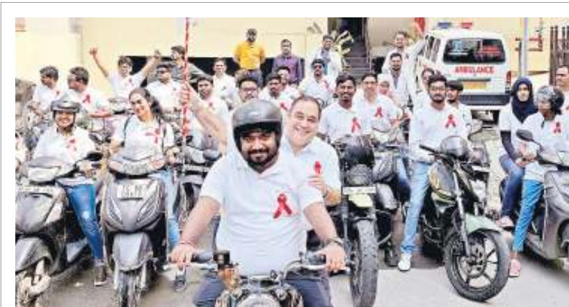
Health Care at Home India organised a walkathon and a bike rally on World Stroke Day in Hyderabad on Monday

To further raise awareness and engage the community, Health Care at Home India Pvt Ltd (HCAH) organised a walkathon and bike rally on World Stroke Day. These events were pivotal in increasing public