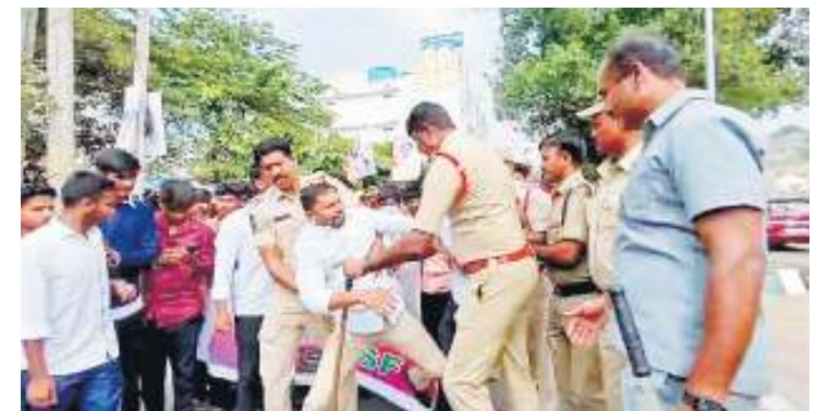
Police arresting student leaders at a protest in Hanumkonda on Monday