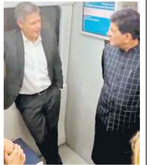
After hearing Goyal's remarks, he stood saying, "I think I should listen to you".

Habeck arrived here last week as a part of a high-level delegation led by German Chancellor Olaf Scholz. The German Vice Chancellor was sitting while Goyal was standing during the conversation.