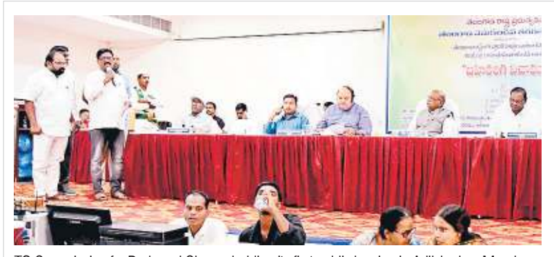
TG Commission for Backward Classes holding its first public hearing in Adilabad on Monday

Total 90 petitions, suggestions and opinions had been submitted to the Commission in the form of affidavit. The Commission received pleas that the post of Zilla Parishad chairman should be reserved for Scheduled Tribes as majority of population are tribals in the district,