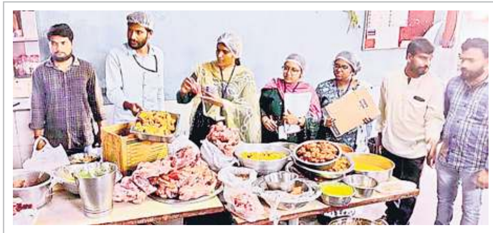
State Food Safety Task Force officials inspecting a hotel in Nizamabad on Saturday

During an inspection of a hotel, officials discovered 122 kg of meat improperly stored in plastic bags. They also identified and destroyed spoiled meat worth Rs 30,000, along with harmful coloring agents used in cooking, masala mirchi paste, and fungus-infested vegetables. Notices were issued to the hotel management by the Zonal Assistant Food