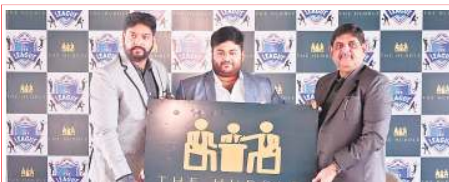
The League Hyderabad's largest sports arena was launched at Financial District Hyderabad.