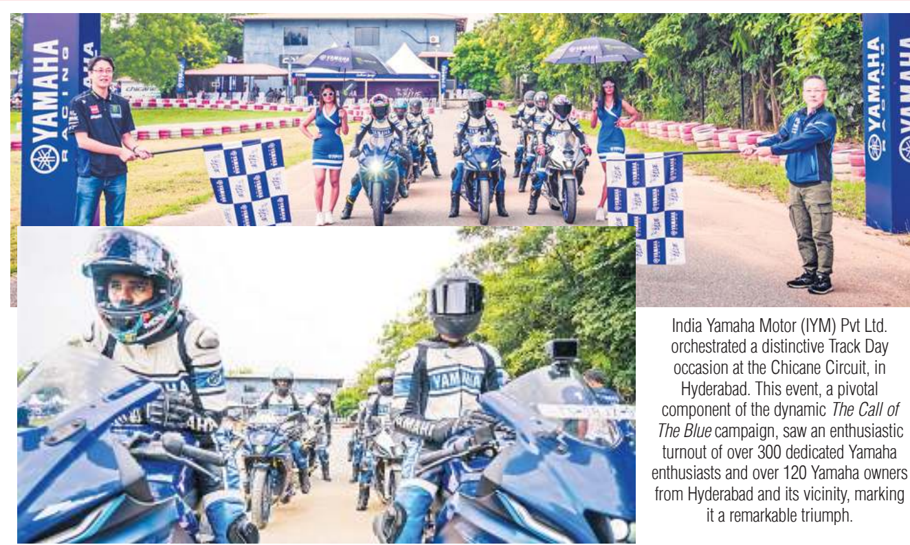
India Yamaha Motor (IYM) Pvt Ltd. orchestrated a distinctive Track Day occasion at the Chicane Circuit, in Hyderabad. This event, a pivotal component of the dynamic The Call of The Blue campaign, saw an enthusiastic turnout of over 300 dedicated Yamaha enthusiasts and over 120 Yamaha owners from Hyderabad and its vicinity, marking it a remarkable triumph.

Roots College of Hotel Management and Culinary Arts organised a heartwarming event, "Lunch with Love," at Asha Kuteer Home for the Blind on the eve of International Chefs Day. Students and faculties of the college prepared and served delicious meals to students with visual disabilities, promoting empathy and inclusivity.