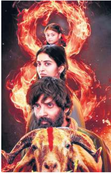
film. "I had to get the language because the story is set in the 1980s in interiors, so I did homework during dubbing to get the right slang. Another challenge was for the 'Pothuraju' get-