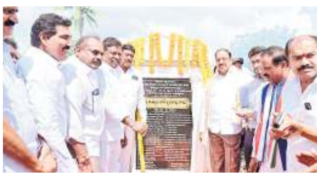
Agriculture Minister Tummala Nageswara Rao laying the foundation stone for cement concrete road works in Division in Khammam on Sunday.

He criticised the previous government for neglecting farmers' welfare for 10 years and mentioned. He highlighted the current government's commitment to