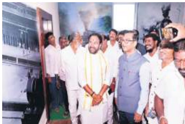
Union Minister G Kishan Reddy inspecting the newly developed satellite terminal station at Cherlapalli on Sunday

Kishan Reddy said that the government has undertaken development of various Railway projects in Telangana state on a mission mode including new lines, dou-