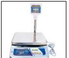
It is suspected that some unscrupulous persons are putting litre mode in electronic weighing machines instead of grams mode and it would lead to short-weight of goods. This cheating is allegedly being perpetrated and 50 to 100 grams of short-weight is reportedly observed, it is said.

In the past, there were instances where cotton traders in the Dilawarpur mandal in the district reportedly duped the farmers by short-weighting the produce by 10 to 20 kg and it led to protests by farm-