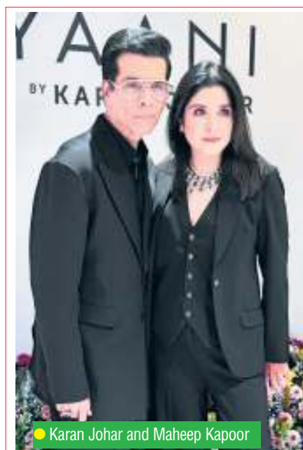
Karan Johar and Maheep Kapoor