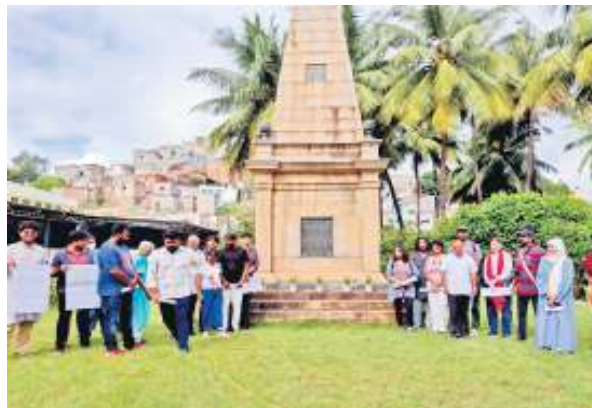
Walkers exploring monuments in Hyderabad on Sunday

These maps were created by the Hyderabad Municipal Survey between 1912 and 1915, following the devastating Musi River flood of 1908.