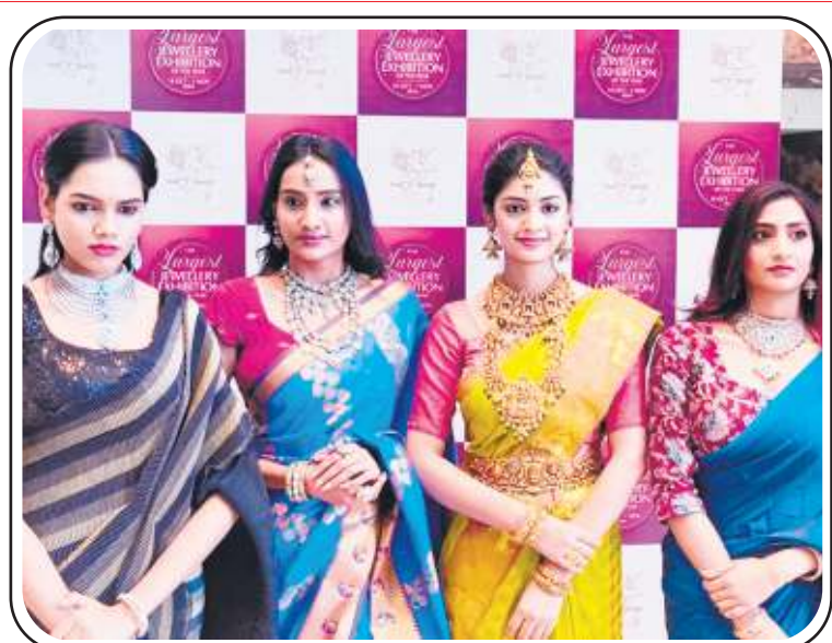
Sri Krishna Jewellers is celebrating the auspicious occasion of Dhanteras and Diwali by hosting the city's largest jewellery exhibition of the year. The exhibition will be open at their Banjara Hills store until November 1.