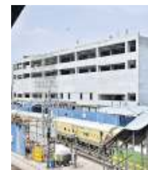
Secunderabad Railway station's major upgrades in progress

SCR announced that Modernization efforts are focused on turning these stations into growth centers for local populations. The foundation stones for these projects were laid by Prime Minister Narendra Modi in 2023, with completion expected by February 2024. This includes major upgrades at Secunderabad station and Cherlapalli terminal to ease congestion. The SCR highlighted that