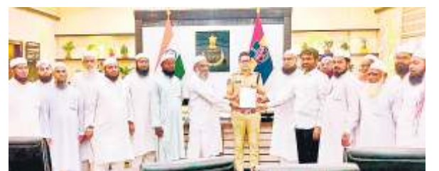
Jamiat Ulema-e-Hind representatives submitting a representation to Khammam Police Commissioner Sunil Dutt in Khammam on Saturday

The extension of this facility to mandal residents follows strong local demand, ensuring that all devotees from Yadagirigutta Mandal can now benefit from the free darshan service.