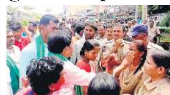
Women protesters blocking an ambulance carrying the body of tribal youth who died after a self-immolation bid in Palakurthi on Saturday.