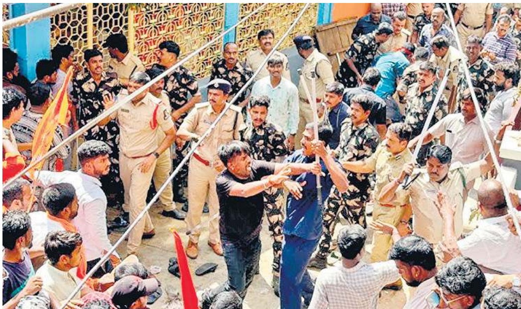
Police caning protesters at Muthyalamma temple in Secunderabad