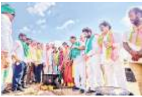
Former minister Eshwar taking part in protest at Jagagama village in Peddapalli district on Saturday

Former minister Koppula Eshwar stated that the lack of irrigation water has led to crops wilting as the harvesting season approaches. He urged the Congress government to stop making false promises and immediately release water from the Sripada Yellampalli project to save the crops.