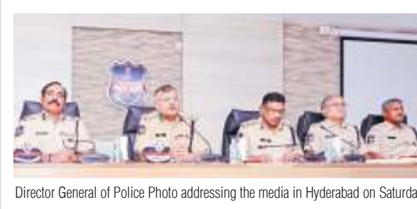
Director General of Police Photo addressing the media in Hyderabad on Saturday

In Telangana, the Commemoration Period will be observed from October 21 to October 31 culminating in