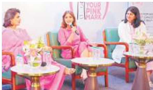
Actress and cancer warrior Sonali Bendre addressing the breast cancer awareness programme at GVK Health Hub in Hyderabad on Saturday

A series of bomb threats have been received by various airlines on domestic and international routes. Most threats were received through social media and most of them turned out to be hoaxes.