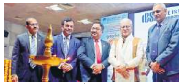
Governor Jishnu Dev Varma at the 16th conference of SIRC of Practising Company Secretaries in Hyderabad on Friday

Addressing the attendees after the inauguration, Governor Jishnu Dev Varma emphasised that intelligence is the key driver of progress and lauded the theme as timely and relevant. He acknowledged the vital role company secretaries play in promot-