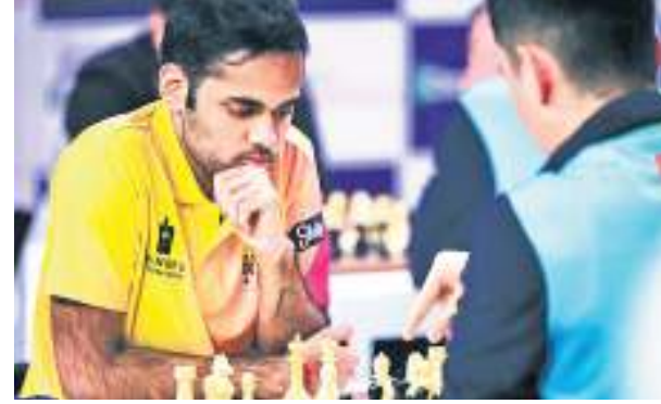
the World number four Indian but eventually crumbled in the Armageddon.