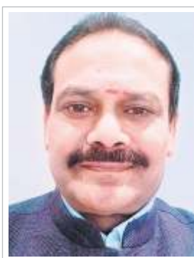
DR. ARJA SRIKANTH (Former Special Secretary, Government of Andhra Pradesh)

neighbouring states for cheaper, untaxed alcohol. Smuggling networks thrived, and the state's attempt at controlling the liquor trade crumbled under the weight of its own restrictions. This time, Andhra Pradesh is hoping to avoid the pitfalls of its earlier policy by handing the reins back to private players. Under the new policy, 3,736 liquor shops will be opened up for private ownership, with each licence requiring a non-refundable fee of Rs 2 lakh per shop. There is no limit on how many licences an individual can hold, which could either democratize the market or lead to monopolies. To sweeten the deal, the state is introducing low-cost liquor priced as low as Rs 99 to undercut black-market operations. Retailers are promised a 20% margin on liquor sales, but they will also face a steep annual retail excise tax (RET) ranging from Rs 5 lakh to Rs 8.5 lakh, depending on the size of the town or city. In the sec-