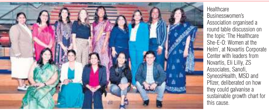
Healthcare Businesswomen's Association organised a round table discussion on the topic 'The Healthcare She-E-O: Women at the Helm', at Novartis Corporate Center with leaders from Novartis, Eli Lilly, ZS Associates, Sanofi, SyneosHealth, MSD and Pfizer, deliberated on how they could galvanise a sustainable growth chart for this cause.