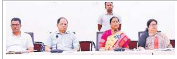
Endowments Minister Konda Surekha speaking at a media conference in Hyderabad on Friday

Stating that the Vemulawada Temple has 5,000 kilos silver and 65 kilos gold, Endowment Minister Konda Surekha said and added that the silver will be used to make silver palanquin.