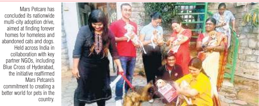
Mars Petcare has concluded its nationwide multi-city adoption drive, aimed at finding forever homes for homeless and abandoned cats and dogs. Held across India in collaboration with key partner NGOs, including Blue Cross of Hyderabad, the initiative reaffirmed Mars Petcare's commitment to creating a better world for pets in the country.