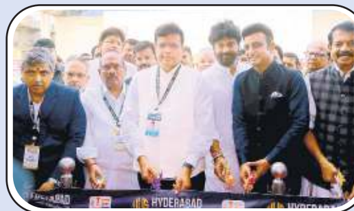
D. Sridhar Babu, Minister for Information Technology, Electronics, Communications, Industries & Commerce, Govt. of Telangana, inaugurated the Hyderabad International Jewellery Show (HIJS), in HITEC Exhibition Centre, Hitech City Hyderabad. The show will end on Oct 20.