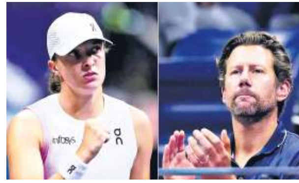
and making decisions with this approach," Swiatek wrote on Thursday. "I want to say that I'm very excited and looking forward to working with Wim. He seems to have a great attitude, vision and huge experience at a very top level of tennis. It's always crucial to try and get to know each other better but we're off to a good start and I can't wait to compete soon."