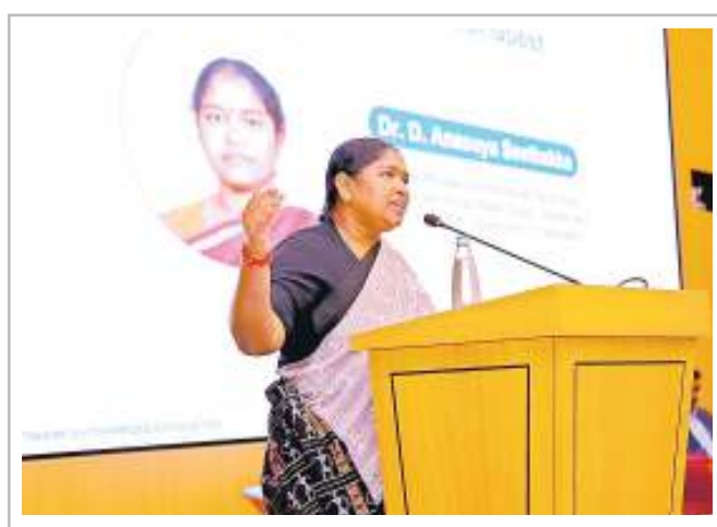
Minister Dhanasari Anasuya speaking at HYSEA Education Conclave in Hyderabad on Friday

She stressed the need for collaboration between the government, companies and NGOs to