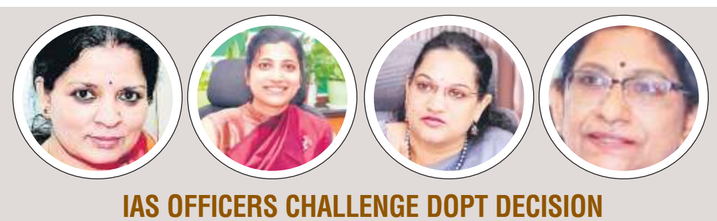
IAS OFFICERS CHALLENGE DOPT DECISION