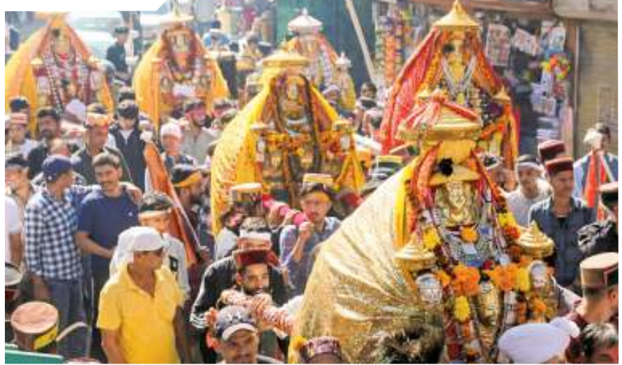
Devotees carry the palanquin of the deities to participate in the Dussehra festival, in Kullu