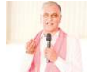
Former minister T Harish Rao speaking at a meeting in Andole on Monday

He emphasised the cultural importance of Alai Balai, where people from all castes come together to celebrate Batukamma