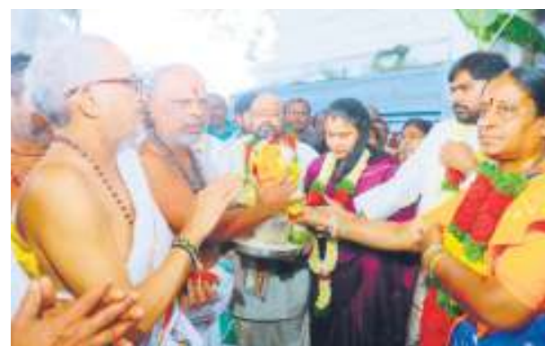
Minister for Endowments Konda Surekha offering prayers at Sri Raja Rajeshwara temple in Vemulawada on Monday

A high-level meeting on the temple's development is scheduled to take place soon under the leadership Chief Minister and the government is preparing plans based on scriptures for the temple's development.