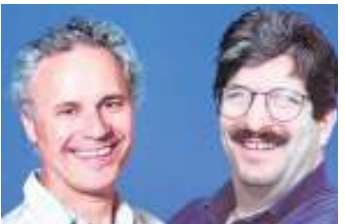
PNS ■ STOCKHOLM

The Nobel Prize in medicine was awarded Monday to Americans Victor Ambros and Gary Ruvkun for their discovery of microRNA, a fundamental principle governing how gene activity is regulated.