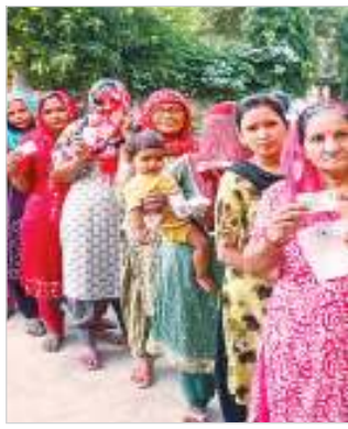
plagued the region in recent years.

A Congress victory in Haryana could be a defining moment in national politics. It would signal that the BJP's stronghold in the Hindi heartland is weakening and Jats (who have significant presence in western UP) are returning to Congress fold and non-Jats — upper castes — the traditional BJP voters are also have also splitted. Congress couldn't be happier as it could also galvanise Congress supporters across other northern states, particularly Rajasthan and Punjab, where state elections are due soon. But it would have a daunting task of keeping the rebels happy as they could turn the tables. In contrast, the outcome in Jammu and Kashmir-if a hung assembly materializes-could deepen political instability in the Union Territory. A coalition government would have to balance the diverse and often conflicting interests of Jammu, Kashmir and Ladakh, complicating governance. Moreover, this result could prompt national parties, particularly the BJP, to reassess their strategies in sensitive regions like Jammu and Kashmir, where identity politics and security concerns dominate. However, as with all exit polls, it's important to approach these predictions with skepticism, given how they have been inaccurate in past elections.