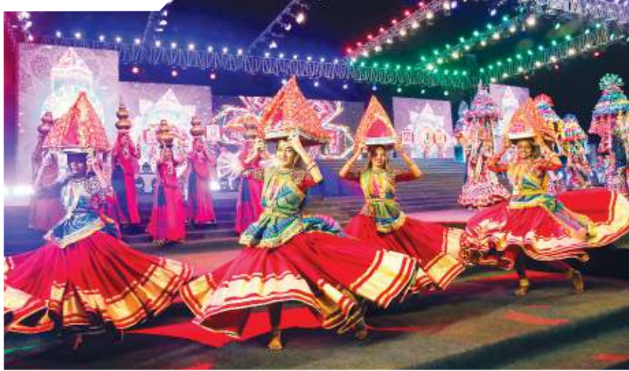
Artistes take part in 'Garba', in Ahmedabad