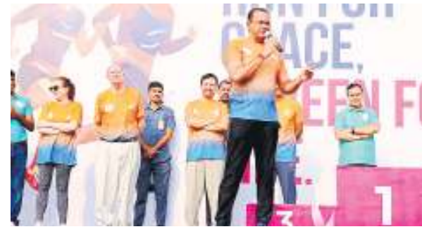
lakhs of poor people and there is a need for everyone to join hands to control cancer," he said.

"The Grace Cancer Foundation is doing a good job of creating awareness by conducting free cancer screening tests. Cancer has been affecting the lives of