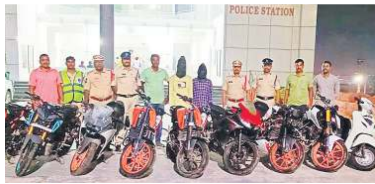
Bachupally Police arrest a group of bike offenders involved in the theft of high-end motorcycles.

In assembly also, the BJP, AMIM and other party MLAs raised this issue. The State government said that the arrears will be released. But till now, they have not released, said sources.