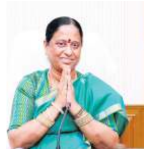
Chief Minister Revanth Reddy for final clearance.

The meeting approved the final draft of the eco-tourism policy, which will be sent to