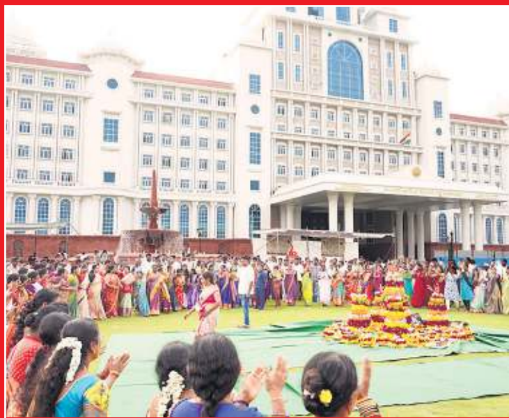
Secretariat employees celebrating Bathukamma on the Secretariate premises in Hyderabad on Saturday