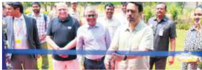
Union Minister of State for Skill Development Jayant Chaudhary inaugurating the I-Venture Immersive programme at ISB Hyderabad on Friday.

Addressing the new class of students, Jayant Chaudhary remarked that no Minister can truly be in charge of entrepreneurship.