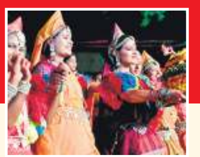
Women participating in Bathukamma celebrations at Ravindra Bharathi in Hyderabad on Saturday