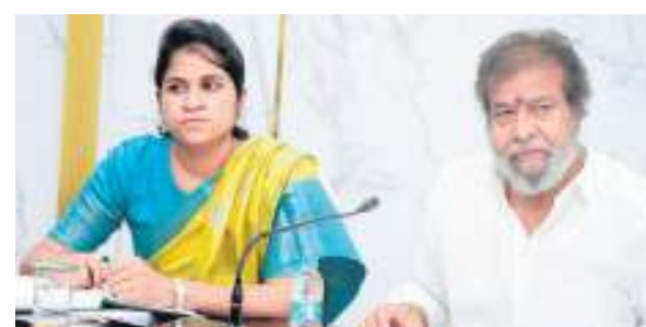
Health Minister Damodar Raj Narasimha speaking at a review meeting in Sangareddy on Saturday