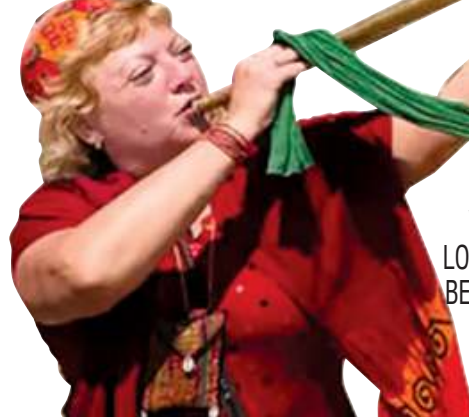
The penultimate day features the

Muhalla ceremony, an event filled with joy, music and festivity. Villagers from across Kullu gather at Dhalpur Maidan, setting aside their daily lives to participate in this lively celebration. The deities, surrounded by flags and accompanied by traditional music, pay their respects to Lord Raghunath Ji. The Muhalla is a vibrant reflection of the community spirit that defines Kullu Dussehra , where unity and togetherness are celebrated in a colourful display of devotion. Historically, Kullu Dussehra has also been a major commercial event. It once served as a trading hub where villagers would sell their crops, handicrafts and other goods. Traders from regions like Lahaul and Ladakh would bring products such as pashmina shawls, carpets and local herbs, creating a bustling marketplace. Today, this tradition continues with the Artisan Showcase, where award-winning artisans display their crafts, from textiles to woodwork. Visitors can purchase these handmade items, taking home a piece of Kullu's rich artistic heritage and supporting the local economy. For those who enjoy food, Kullu Dussehra is a culinary journey that showcases the flavours of Himachal Pradesh. The food courts at the festival serve traditional dishes such as siddu (a type of steamed bread) and madra (a rich chickpea curry), offering a taste of the region's culinary traditions. Alongside these local delicacies,