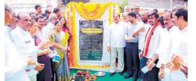
Agriculture Minister Tummala Nageswara Rao laying foundation stone for Storm-water drain in Khammam on Saturday

Agriculture Minister Tummala Nageswara Rao has said that the people of the city will be healthy only when the city is clean. The Minister was speaking after laying the foundation stone for the Rs 10-lakh storm-water drain and cement concrete roads in Raparti Nagar located in 58th Division of the city with TUFIDC funds. New colonies are being developed and construction activity has been taken up in 58th division of the city. Therefore, measures would be initiated to develop roads and drains in the division, he said. The government sanctioned Rs 1 crore for development of amenities in Dorai colony, he said asking the authorities to use the funds for public purpose. The Minister asked the engineers, contractors and municipal commissioners to start the works first in the areas where the people have been