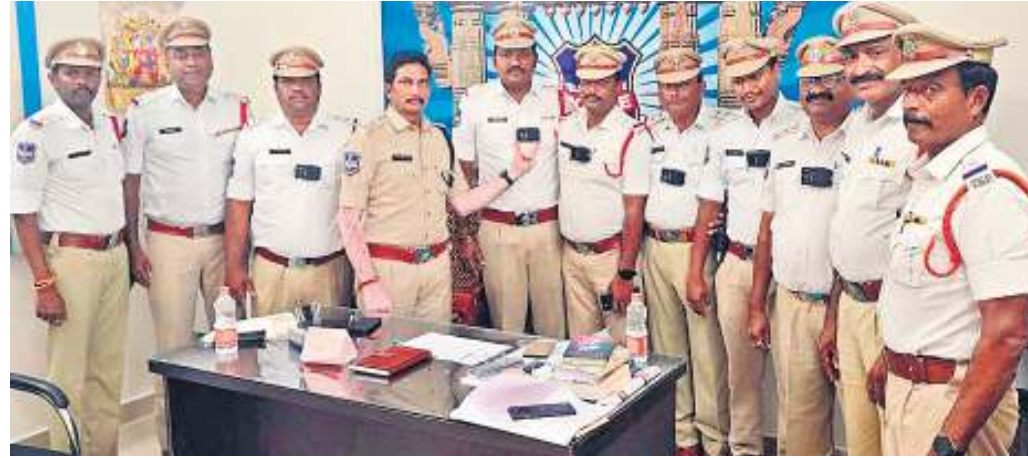
Warangal Police wearing body-worn cameras in Warangal on Saturday

Adopting the modern technology, the city police have been using body-worn cameras to capture images of those who create nuisance on public roads and obstruct the police in the discharge of their duties. In the trities of Warangal-Hanamkonda-Kazipet, the traffic police have been wearing these body cameras on their shirts while discharging their duty. The camera has also the facility to capture the live video footage. With the help of these cameras, the police have been submitting necessary evidence in courts and ensuring the accused in various get punished. In the region of the three cities, measuring over 407.71 square kilometers, at least 11 lakh people reside there. Moreover the city is expanding rapidly in all directions for the past five or six years. There are three traffic police stations in the city. There are hundreds of colleges located in the city. The roads become crowded during the morning peak traffic hour time. Besides these, protests, sit-ins are staged at one place or the other daily. During the drive against the