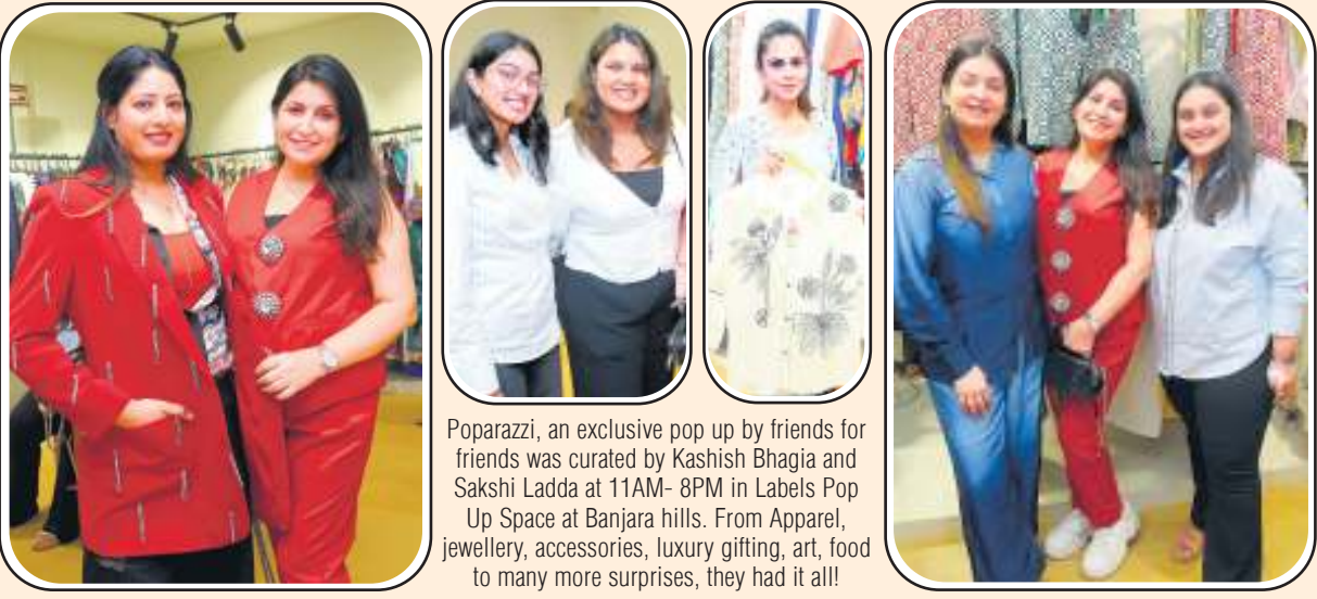
Poparazzi, an exclusive pop up by friends for friends was curated by Kashish Bhagia and Sakshi Ladda at 11AM- 8PM in Labels Pop Up Space at Banjara hills. From Apparel, jewellery, accessories, luxury gifting, art, food to many more surprises, they had it all!