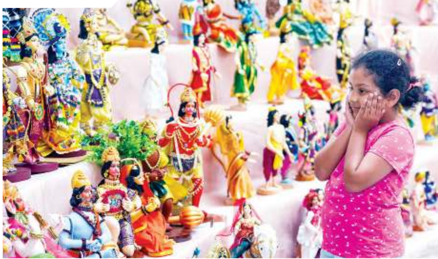
A child looks at dolls depicting scenes from Ramayana during the Dussehra Doll festival, in Bengaluru