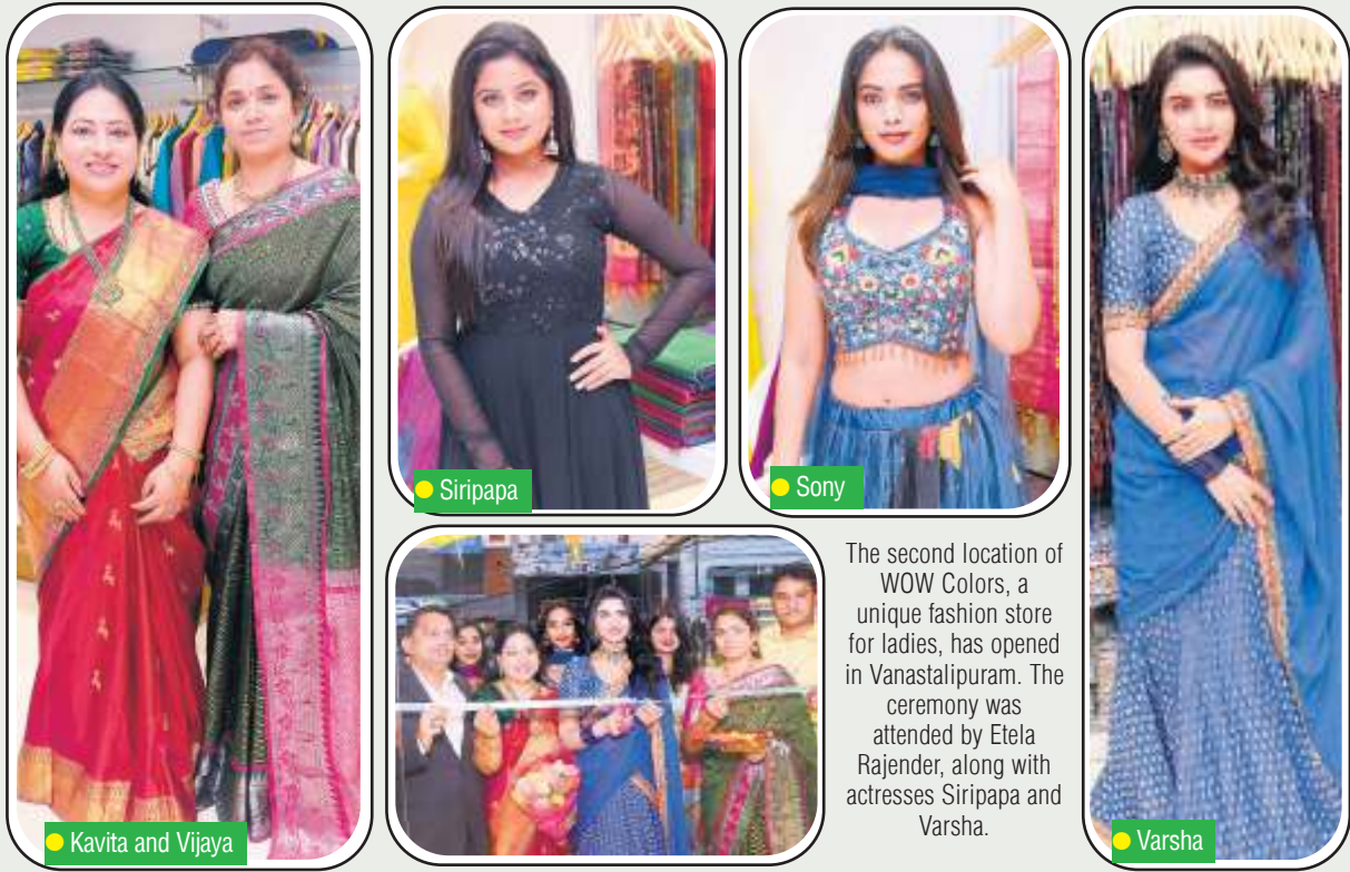
The second location of WOW Colors, a unique fashion store for ladies, has opened in Vanastalipuram. The ceremony was attended by Etela Rajender, along with actresses Siripapa and Varsha.