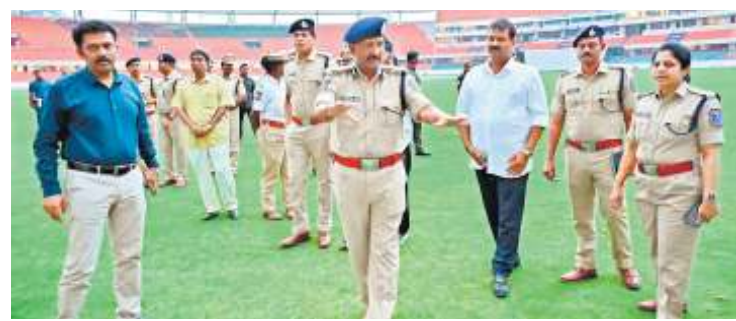
Rachakonda Commissioner of police Sudheer Babu, along with other department officials reviews the security arrangements for the India vs Bangladesh Twenty20 match

The starting price of tickets is Rs 750 and the maximum price is Rs 15,000. Tickets booked online should be redeemed at Gymkhana Stadium from October 8th to 12th October, said the HCA president.