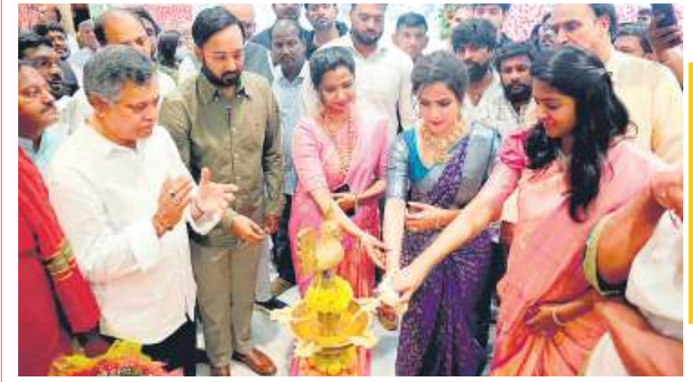
Actress Vaishnavi Chaitanya marked her presence at the store launch of Chandana Brothers Shopping Mall (CBS) at Nallagandla.