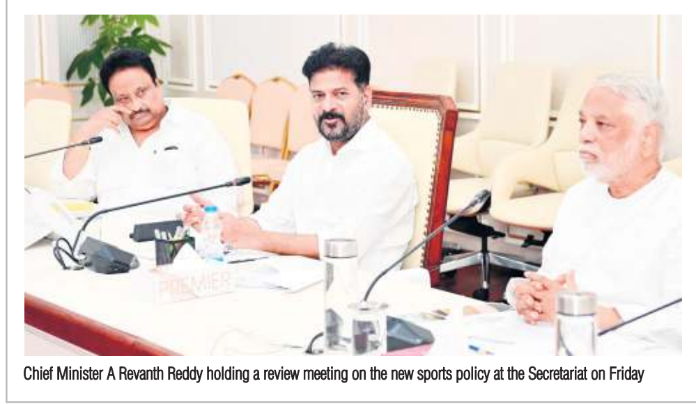
Chief Minister A Revanth Reddy holding a review meeting on the new sports policy at the Secretariat on Friday

The CM suggested upgrading these facilities to meet future needs. Additionally, he ordered the integration of Hyderabad's key sports complexes and stadiums, such as LB Stadium, Hakimpet Sports School, Kotla Vijay Bhaskara Reddy Indoor Stadium, Saroor Nagar Indoor Stadium, and University Cycling Velodrome, into a single sports