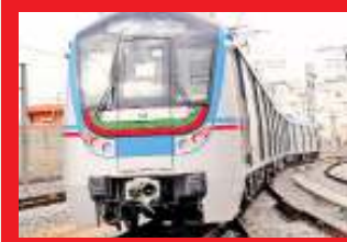
The popular customer offers have been extended until March 31, 2025. Super Saver Offer-59; Unlimited travel for Rs 59 on listed holidays; Student Pass Offer: 30 trips for the price of 20; Super Saver Off-Peak Offer: 10% discount on Contactless Smart Cards during off-peak hours