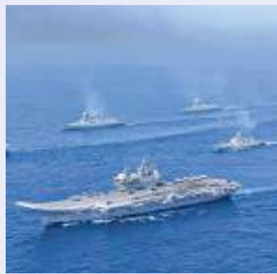
The Australian think tank 'Lowy Institute' ranked India as the third strongest Asian power in the Asia Power Index. US and China occupied the first and second position

followed by India in the third place. Considering the economic growth, future potential and the diplomatic influence of India on an improvement, India successfully managed to rank better with passing years than the countries like Japan, Australia and Russia. The improvement from the side of India is particularly welcoming because India strives to make continuous improvement in its performance in all respects and also ensure holistic growth of Asia for a better future together.