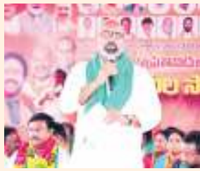
the policies of the KCR admin, he said. He said that KCR was like a tiger during the Telangana movement but now he has become a cat. KCR submerged

The BRS became a scapegoat for KCR's corruption. The Congress came to power 10 months ago but it is following