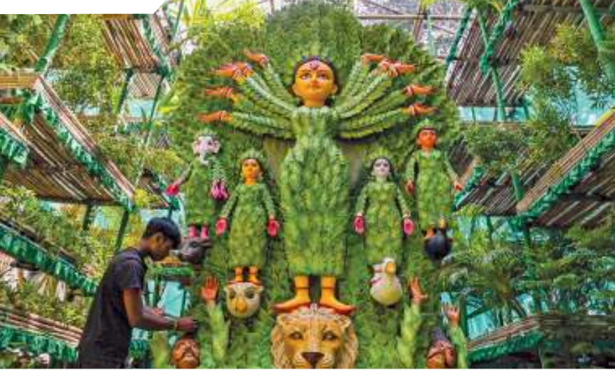
An artist prepares an environment friendly puja pandal ahead of Durga Puja festival, in Kolkata