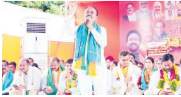
HYDRAA victims and demanded that the government should announce a roadmap on the Congress government's assurances. He also demanded that the