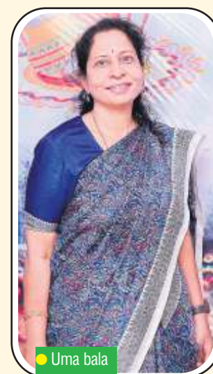
● Uma bala