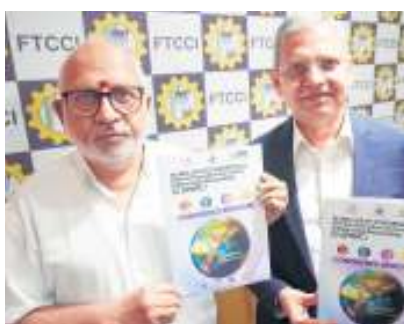
the Prayaan Sustainable Health Outcomes Foundation (PRASHO) said that the objective of the conference is to