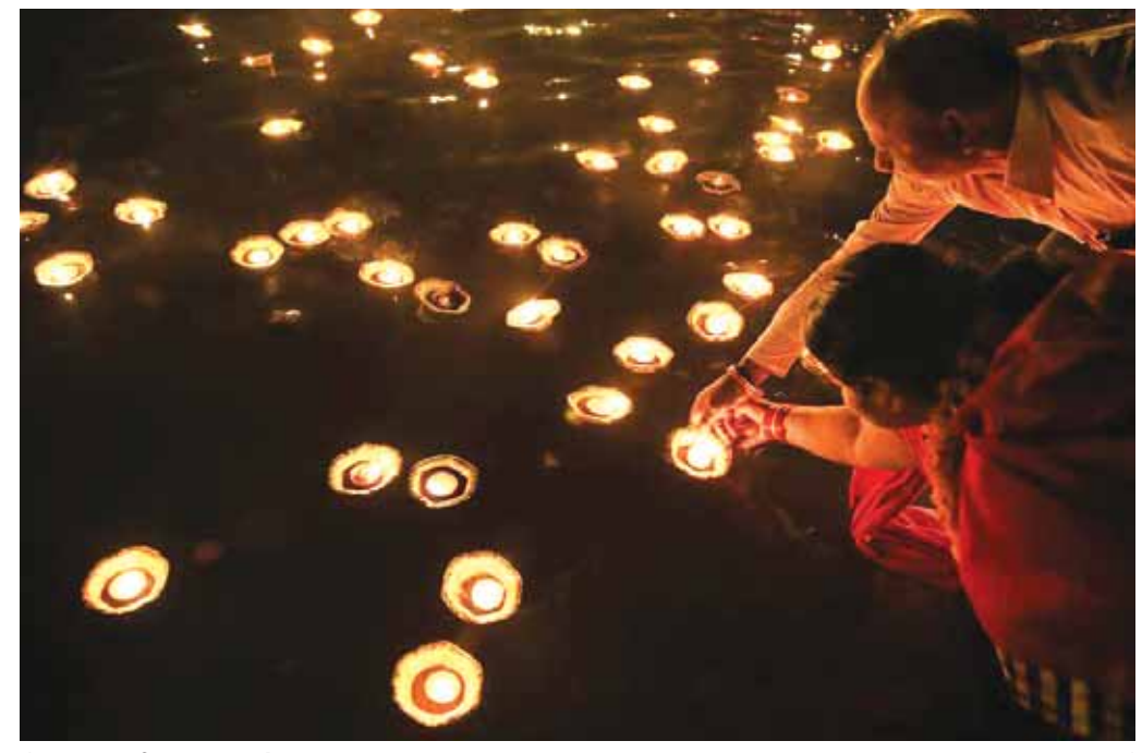
A view of the Saryu river on Deepawali eve