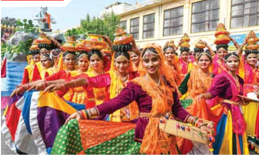
Artists dance on the Rampath ahead of Deepotsav celebrations, in Ayodhya