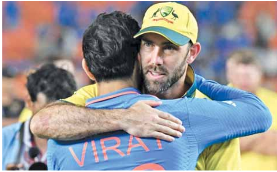
spent a fair bit of time training together as you do," Maxwell said during the Willow Talk podcast on LiSTNR Sport. "So, I go to his social media (to) follow him. Didn't even think about it before that. Never really crossed my mind. I was like, 'I can't find him.' 'I'm sure he's on social media somewhere, so I didn't think anything of it. Not really that

PTI ■ MELBOURNE Australian all-rounder Glenn Maxwell has revealed that Virat Kohli had blocked him on Instagram after he mocked the Indian batting maestro following his shoulder injury during the 2017 Border-Gavaskar Trophy. Kohli and Maxwell were not the best of friends until the Australian joined IPL franchise Royal Challengers Bengaluru in 2021 for a whopping Rs 14.25 crore. Maxwell said that he tried to follow Kohli on Instagram, only to discover that he had been blocked by the former India captain. "When I knew I was going to RCB, Virat was the first guy to message me and welcome me to the team. When I turned up for the pre-IPL training camp, we obviously got chatting and