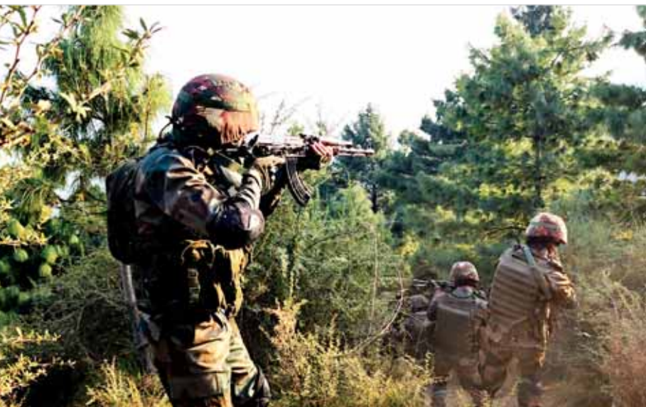
Indian Army's Ghatak team carrying out an extensive search operation in the dense forest of 'Dehra Ki Gali', in Rajouri district, Jammu and Kashmir