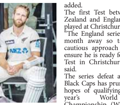
NZ head coach Gary Stead said in a media release. "While things are looking promising, we think the best course of action is for him to stay in New Zealand and focus on the final part of his rehabilitation so he'll be good to go for England," Stead

PTI ■ NEW DELHI Senior batter Kane Williamson will miss the third Test against India at Mumbai to ensure full recovery from a groin injury ahead of the home series versus England, starting from November 28. Williamson did not play in the first two Tests against India, which the Kiwis won to take an unassailable 2-0 lead in the three-match series. It also ended India's 18-series winning streak at home dating back to 2012. The final Test of the rubber will be played at the Wankhede Stadium from November 1. "Kane continues to show good signs, but isn't quite ready to jump on a plane and join us,"