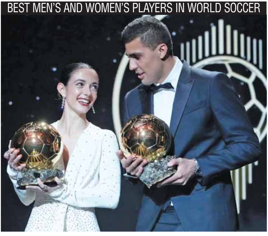
BEST MEN'S AND WOMEN'S PLAYERS IN WORLD SOCCER

a person who works with Vinicius and spoke to The Associated Press on condition of anonymity because he wasn't authorized to speak about the player's whereabouts publicly. Vinicius finished second in the voting, with Bellingham third. Neither Messi nor Cristiano Ronaldo - winners of the prestigious individual award a combined 13 times - were in the running for this year's prize - the first time that's happened since 2003. While Rodri is not a flamboyant player or a prolific scorer like Messi and Ronaldo, he had a huge influence on City's team with his ability to protect the defense and distribute passes cleanly from the back. "I try to be a leader and try to improve every day from the best," Rodri said. City looked unbeatable at times with him in the side, while his excellent technical ability enabled him to slot smoothly into the quick-passing style made so effective