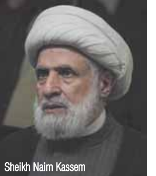
Sheikh Naim Kassem

Palestinian territories. The agency, known as UNRWA, is the largest aid provider in Gaza. Israel has long accused it of militant ties, allegations denied by the agency. A spokesperson for the UN children's agency said the decision "means that a new way has been found to kill children." Hezbollah's new leader has vowed to keep fighting Israel: Hezbollah said in a statement that its decision-making Shura Council elected Kassem, who had been Nasrallah's deputy leader for over three decades, as the new secretary-general. Kassem, 71, a founding member of the militant group established following Israel's 1982 invasion of Lebanon, had been serving as acting leader. He has given several televised speeches vowing that Hezbollah will fight on despite a string of set-