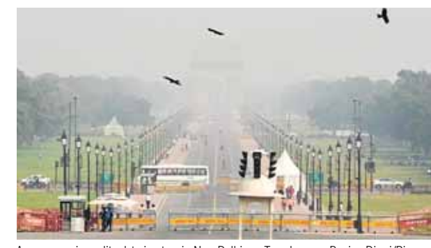
A smog as air quality deteriorates, in New Delhi, on Tuesday

Even before the arrival of winter, Delhi along with several cities of north India is gasping for clean air as air quality has degraded to alarming levels over the past few days. Based on the real time data, Delhi ranks top on the list of most polluted cities in the country. It was the second-most polluted city in the world on Tuesday, a live ranking on IQAir's a Swiss based air quality monitoring website indicated, after only Lahore in neighbouring Pakistan. AQI in Lahore recorded 394. A layer of smog engulfed Delhi and surrounding areas, including Noida, on Tuesday morning, even as the air quality plummeted to the 'very poor' category at 327, followed by Haryana's Jind where the AQI stood at 311. Meanwhile, out of 36 monitoring stations in the National Capital, 26 are in the red zone, with the AQI recorded in the "very poor" category, according to data from the Central Pollution Control Board. These stations