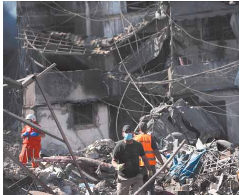
Rescue workers search for victims at the site of Israeli airstrikes that destroyed buildings facing the city's main government hospital in a densely-populated neighborhood, in southern Beirut, on Tuesday.

the US has continued what it calls "freedom of navigation" transits through the Taiwan Strait. On Sunday, the destroyer USS Higgins and the Canadian frigate HMCS Vancouver transited the narrow band of ocean that separates China and Taiwan. Germany sent two warships through the Taiwan Strait last month as it seeks to increase its defence engagement in the Asia-Pacific region. China has also exerted diplomatic pressure on Taiwan, poaching its allies. South Africa, which does not recognise Taiwan as a country, asked the island last week to move its liaison office outside the capital, Pretoria, as a concession to China. Taiwan on Monday said it would fight the request.