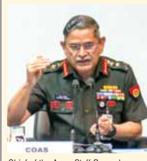
Chief of the Army Staff General Upendra Dwivedi during a press conference, in New Delhi

humanity. India is ready to provide all possible cooperation in times to come," he said. "We have the opportunity to discuss all these issues," he added. On his part, Putin noted the "good condition" of trade turnover between Russia and India. In his remarks, Modi also referred to his summit talks with the Russian leader in Moscow in July. Our annual summit resulted in strengthening cooperation in every field, he said. The Prime Minister also congratulated Putin on Russia's successful presidency of BRICS. Many countries want to join the grouping now, he added. "It is a matter of great pleasure for me to have the opportunity to visit a beautiful city like Kazan for the BRICS summit. India has deep and historical ties with this city," Modi said. "The opening of India's new consulate in Kazan will further strengthen these ties," he added. It is learnt that the Ukraine conflict figured prominently at the meeting. In the summit talks on July 9 in Moscow, Modi told Putin that a solution to the Ukraine conflict is not possible on the battlefield and peace efforts do not succeed in the midst of bombs and bullets. Weeks later he travelled to Ukraine. In his talks with Zelenskyy, Modi said both Ukraine and Russia should sit together without wasting time to end the ongoing war and that India was ready to play an "active role" to restore peace in the region. India has been maintaining that the conflict in Ukraine must be resolved through dialogue and diplomacy.