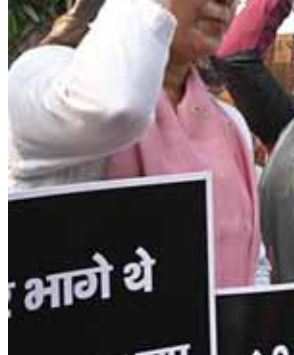
BJP leaders and workers staged protests across the city, accusing AAP supremo Arvind Kejriwal of spending taxpayers' money on personal comfort during his tenure as Delhi chief minister.

The BJP leaders alleged that Kejriwal spent crores on lavish items and modern facilities at his official residence at 6 Flagstaff Road. Kejriwal after resigning as Delhi Chief minister vacated the Flagstaff Road bungalow in Civil Lines earlier this month. In a protest near Kejriwal's current residence on Firozshah Road, Delhi BJP president Virendra Sachdeva alleged that 15 toilet seats installed at "Sheeshmahal" (Flagstaff Road bungalow) after spending lakhs of rupees were missing.