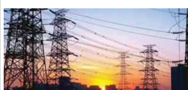
STAFF REPORTER ■ NEW DELHI

In what comes as a major relief, cutting through red tape and deliberate harassment, Delhi Lt Governor V K Saxena has directed DISCOMs to provide more than 11,000 pending electricity connections to applicants in PM-UDAY unauthorised colonies. The same will be provided within a week to 10 days. Saxena, who chaired a meeting attended by MCD Commissioner, Divisional Commissioner, Secretary (Power), Principal