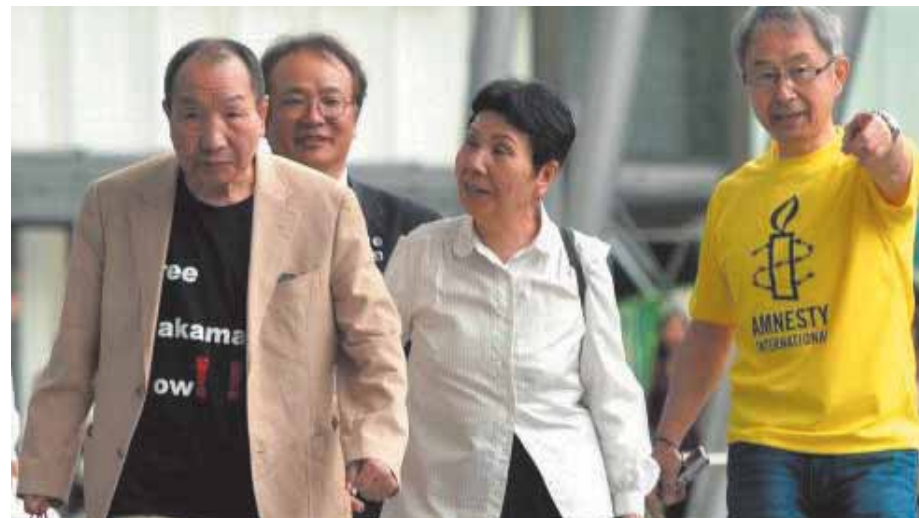
Former Japanese death row inmate Iwao Hamakada (left) on being released from prison