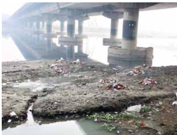
such a plight? Who had claimed to clean the Yamuna and announced to take a dip in it?"

Saxena's comments follow his earlier post on Monday, where he expressed concern over the condition of the river. Sharing a set of pictures showing froth in the river, the LG had asked, "This is the condition of Yamuna, the pain of Delhi's people; I can't see it. Who is responsible for