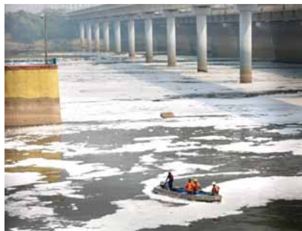
The issue is compounded as major festivals like Chhath Puja approach, when people traditionally immerse themselves in the river.

Videos circulating on social media also show the river blanketed in white foam, which dissipated later in the day.