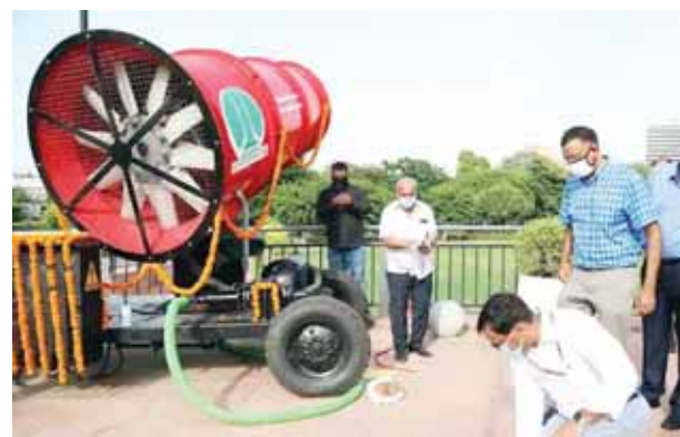
covering of all construction and demolition (C&D) sites, it reads.

To tackle dust pollution from construction activities, the NDMC has mandated the