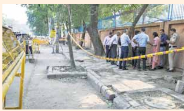
NIA and Delhi Police officials investigate at the site where a blast occurred on Sunday, near a CRPF school at Prashant Vihar, in Rohini area of New Delhi