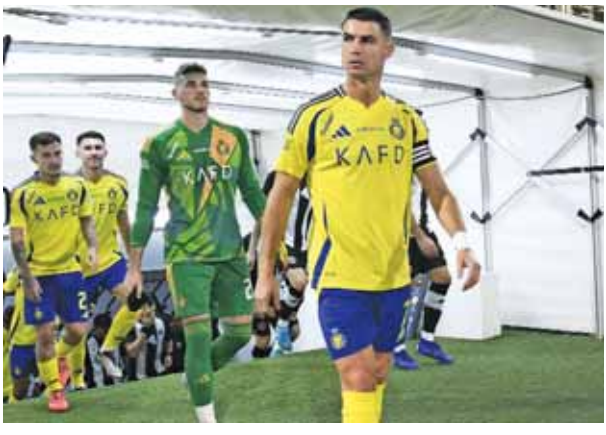
conditions in and around Iran, particularly regarding the safety of players and staff," the official added. The Indian Super League club said that it had appealed the

rescheduled or shifted venues for several games," a spokesperson for Mohun Bagan told Associated Press, adding that the confederation had taken the same geopolitical instability into account that the club had. "Failing to apply the same standard to Mohun Bagan would result in unequal treatment by the AFC." According to the spokesperson, Mohun Bagan had made a request to the AFC that the game's date or venue be changed before it decided not to travel. "We consistently communicated concerns about the volatile and unsafe