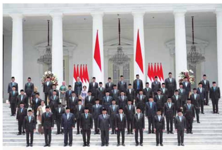
Indonesian President Prabowo Subianto, front centre, and Vice President Gibran Rakabuming Raka, front row fourth from right, pose for a group photo with newly-appointed cabinet ministers after their swearing-in ceremony at Merdeka Palace in Jakarta, Indonesia, on Monday.

Newly inaugurated President Prabowo Subianto swore in Indonesia's largest Cabinet since 1966 on Monday, with 109 members representing his pledge for a strong government. He announced the lineup late Sunday and named his Cabinet of ministers, vice ministers and head of national agencies the "Red and White Cabinet," referring to the colours of Indonesia's flag. Subianto became the eighth president of Southeast Asia's largest economy on Sunday. The Cabinet of Subianto's predecessor, Joko Widodo, had 34 ministers and head of government agencies. Subianto's Cabinet is the largest since 1966 when Indonesia's first President Sukarno formed a lineup of 132 ministers in an extremely tense political situation after a failed 1965 coup.