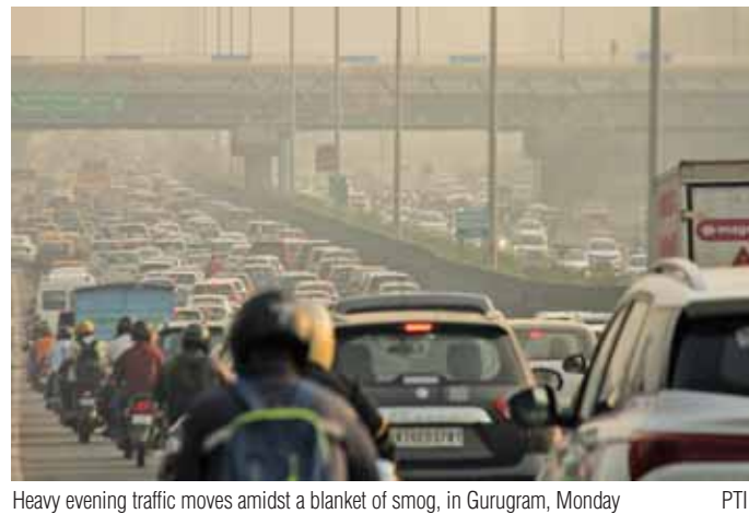
Heavy evening traffic moves amidst a blanket of smog, in Gurugram, Monday

Gate ISBT, Sadar Bazar, Chirag Dilli, roads surrounding major markets including Sarojini Nagar, Chandni Chowk, Lajpat Nagar, Kamla Nagar were among those areas witnessed heavy traffic on Monday. These stretches are the busiest roads known for heavy traffic flow during the week. Lakhs of people commute in and from Delhi to Gurugram, Noida, Faridabad and Ghaziabad daily. Neighbouring Noida has been consistently contributing between 10 and 11 per cent to Delhi's pollution, while Ghaziabad's share ranges from 5 to 10 per cent, as per the DSS -