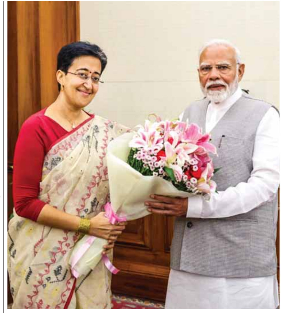
Prime Minister Narendra Modi with Delhi Chief Minister Atishi during a meeting, in New Delhi

For not implementing dust mitigation measures, construction projects with an area of less than 500 square meters will be fined Rs. 7,500 per day, while those with an area exceeding 500 square meters will face a fine of Rs. 15,000 per day. Vehicles transporting construction materials must be properly covered. A fine of Rs. 7,500 will be imposed for any violation of this rule," Rai said.