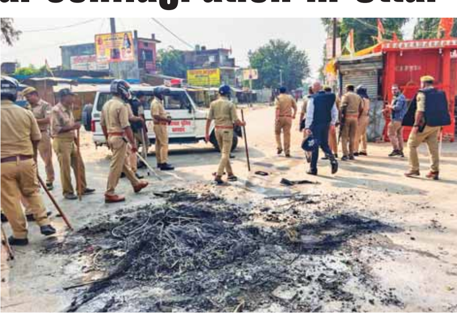
Security personnel deployed to maintain law & order in a violence-affected area, a day after a 22-year-old man was killed in communal violence during a Goddess Durga idol immersion procession, in Bahraich, Uttar Pradesh, Monday

and restore order. Shukla. Vrinda Superintendent of Police (SP) in Bahraich, confirmed that over 30 persons have been detained in connection with the violence. Police have been deployed in the affected areas to maintain order and prevent further escalation. A case has been registered against a man named Salman, from whose house, gunshots are believed to have been fired during the clash.