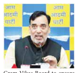
Gram Vikas Board to ensure the development of Delhi's villages. "These projects aim to improve amenities across all villages in Delhi. Additionally, department officials were instructed to process project files related to village development within the stipulated time frame," it stated. Speaking about the decision, he said, "The board has approved the installation of 100 benches in large villages and 20 benches in smaller villages. These development projects, under the Development Department, are being implemented through the Irrigation and Flood Control Department and the MCD."

Delhi Development Minister Gopal Rai on Friday said that the AAP government approved 100 projects worth Rs 93 crores in a bid to boost development in Delhi's villages. In a meeting held at the Delhi Secretariat and chaired by Rai, the Delhi Gram Vikas Board approved 100 schemes to ensure development in the capital's villages. "These include development works related to roads, drains, water bodies, community centers, parks, crematoriums, and playgrounds. The projects will be carried out in Delhi's rural areas at a cost of Rs 93 crore. During the meeting, officials were instructed to complete the village development projects within the stipulated time frame," a statement said. During the meeting, members raised concerns about pending and new proposals. In response, the senior AAP leader said that the government had established the Delhi