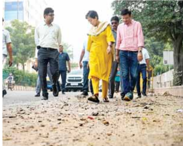
Public Works Department (PWD) in Delhi. "During the inspection, it was noted that several roads had been handed over by the PWD to the Delhi Metro and NCRTC, and many of these roads were in a dilapidated condition, requiring urgent repairs," a statement stated. It added that Atishi directed the PWD officials to coordi-

Chief Minister Atishi on Friday announced that Delhi roads will be made pothole-free by Diwali following a review meeting with officials from the Delhi Metro Rail Corporation (DMRC) and the National Capital Region Transport Corporation (NCRTC) to assess the repair work on the roads under these agencies in Delhi. In the meeting, Atishi asserted, "As a government, our priority is to provide better roads for the people of Delhi. All agencies are working at war footing to achieve this vision and are improving the city's roads." She added, "During our inspection, we found that many roads in Delhi are in a dilapidated condition, causing traffic problems due to potholes." Recently, the Delhi cabinet, along with Atishi, inspected the roads managed by the