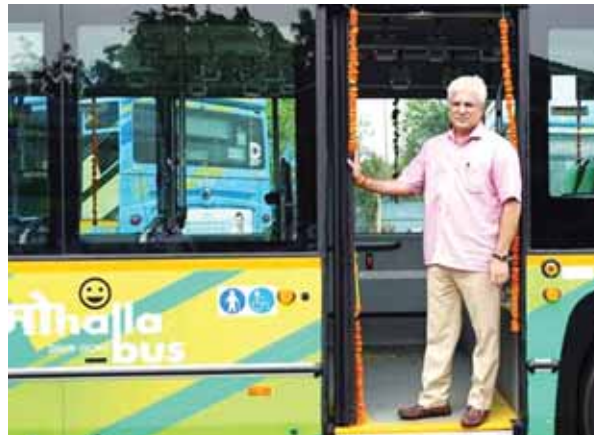
Station to PNB Gitanjali Colony, and Lok Kalyan Marg metro station to Vasant Vihar Metro station. The Mohalla Bus Scheme aims at providing feeder bus services to the Delhiites around their homes through nine-meter-long electric buses. The AAP government aims to operate 2,180 Mohalla buses by 2025. These buses will run on congested roads with limited width in areas where 12-meter buses face manoeuvring challenges. The Mohalla buses have 23 pas-