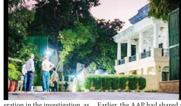
eration in the investigation, as may be required. The bungalow was at the centre of an intense tussle involving the Aam Aadmi Party (AAP), the Bharatiya Janata Party (BJP) and the LG office since former chief minister Arvind Kejriwal vacated it earlier this month. Earlier, officials Raj Niwas has stated that this bungalow was not earmarked as Chief Minister's official residence. While the Vigilance Department has stated that the bungalow can not be allotted with a completion certificate.

The Public Works Department (PWD) on Friday allotted Chief Minister Atishi the bungalow at 6, Flag Staff Road following the procedures even as the AAP and BJP attacked each other over the sealing of the residence. An offer letter issued by the PWD said the bungalow in Civil Lines has been formally allotted to Atishi, after completing the due process of handover and preparation of inventory. "The Director of Allotment, PWD, GNCTD is pleased to offer the under mentioned PWD General Pool Bungalow to Atishi, Chief Minister, GNCTD, as per the provisions of Delhi Administration Allotment of Govt. Residences (General Pool) Rules, 1977," PWD said in the letter. It added that since the said house is under investigation of CBI and other agencies for various violations, the allottee is advised to extend full coop-