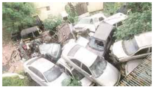
According to the latest figure, more than 55 lakh overage vehicles have been de-registered so far in the national capital. An official said that several teams of Delhi Traffic Police, Enforcement Wing of the Transport Department, MCD and other agencies will take action. The official said the "end of life" vehicles will be impounded and directly sent to the scrapping yard if they are found plying on city roads or parked in public places. According to the Transport Department's recent public notice, owners of overage vehicles have three options - keep such vehicles in a private parking space owned by the individual, not in a shared parking space, obtain a No Objection Certificate (NOC) to move the vehicle out of Delhi within one year of the vehicle's expiry date, or scrap the vehicle through a registered agency. As the winter season approaches, when pollution levels typically spike, the drive is also part of a broader strategy to improve air quality and streamline vehicle registration across the capital, an official of the Delhi Pollution Control Committee (DPCC) said.

The Delhi government Transport Department on Friday launched a fresh round of crackdown on overage vehicles, an exercise that will continue till December to combat air pollution in the national capital. The department has asked traffic police to deploy four teams in every municipal zone in coordination with its enforcement wing to impound diesel and petrol-run vehicles that are 10 and 15 years old, respectively. Similar action has also been launched against unregistered and unfit e-rickshaws across the city. Total 213 vehicles, including two-wheelers, cars, and e-rickshaws were impounded on Friday, officials said. This is the second round of city-wide crackdown on overage vehicles. In March last year, the department launched a drive to impound such vehicles. The drive continued for a few months.