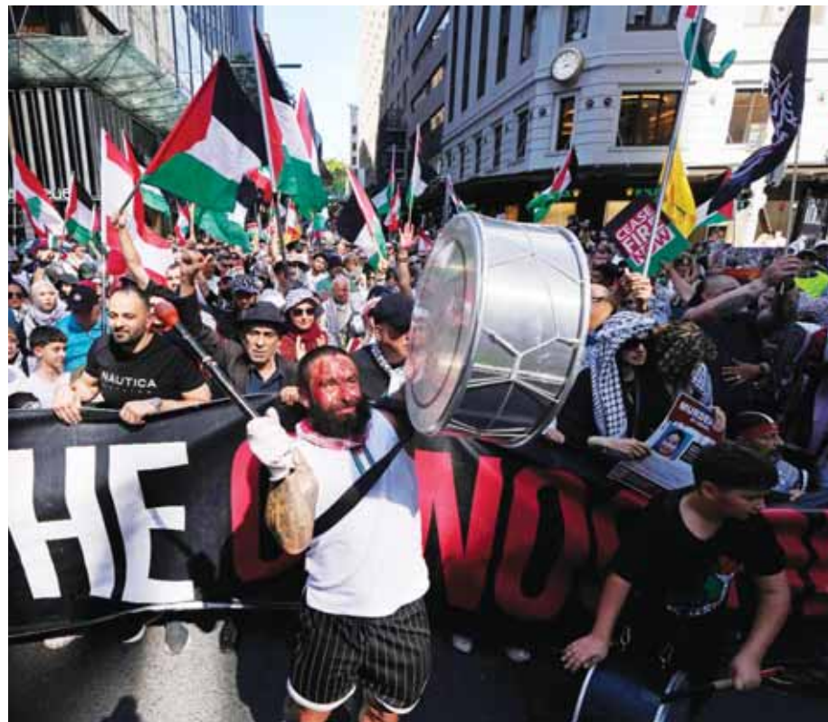
A man bangs a drum during a march as pro-Palestinian supporters rally in Sydney, Sunday.

eral other cities in the United States as well as in other parts of the world, including Denmark, Switzerland, South Africa and India. In the Philippines, dozens of left-wing activists protested near the U.S. Embassy in Manila, where police prevented them from getting closer to the seaside compound. Pro-Israeli demonstrations are expected to be held Sunday because Jews across the world are still observing Rosh Hashana, or the Jewish new year. This year, emotions will be high for many given that the midpoint of the 10 days spanning Rosh Hashana and Yom Kippur is Oct. 7 — the one-year anniversary of the Hamas attack that killed 1,200 Israelis and triggered the ongoing war in Gaza. Security forces in several countries warned of heightened levels of alert in major cities, amid concerns that the escalating conflict in the Middle East could inspire new terror attacks in Europe or that the protests could turn violent.