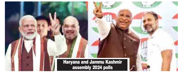
Haryana and Jammu Kashmir assembly 2024 polls

Former Haryana Chief Minister Bhupinder Singh Hooda said he was expecting a