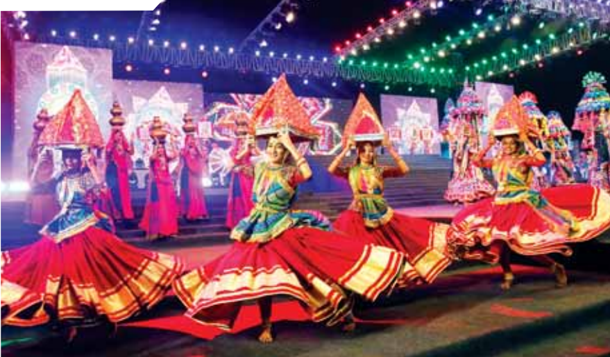
Artistes take part in 'Garba', in Ahmedabad