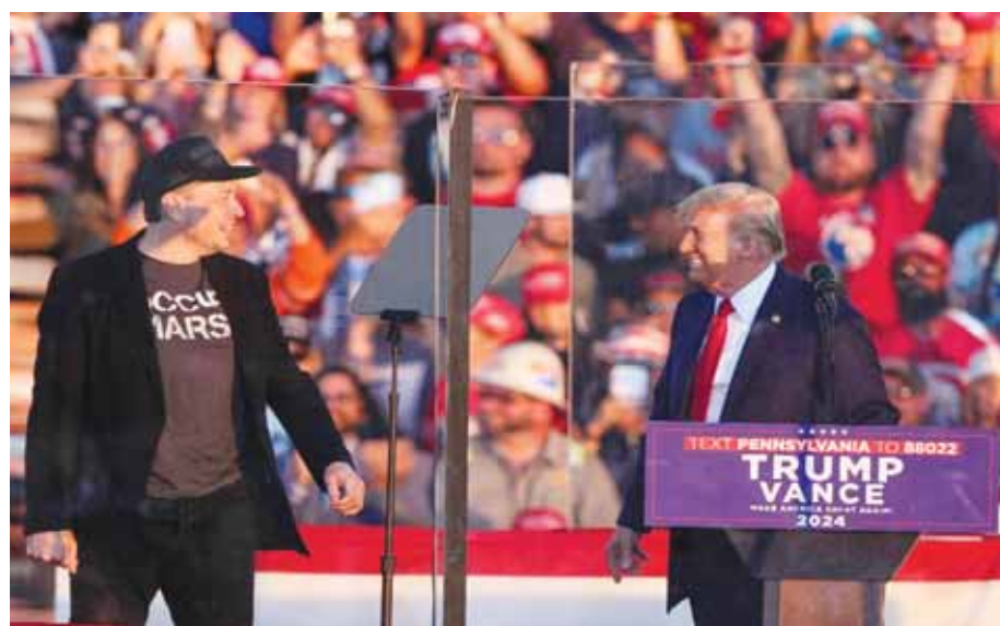
Elon Musk jumps on the stage behind Republican presidential nominee former President Donald Trump during a campaign rally at the Butler Farm Show, Saturday in Butler, Pa.

"He (Biden) got 14 million (1.4 crore) votes. If you believe in democracy or a system, he got 14 million votes. And she (Harris) got none. She was the