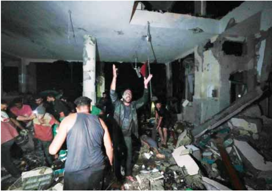
Palestinians search for survivors and bodies in the rubble of a mosque destroyed in an Israeli airstrike in Deir al-Balah, Sunday.

Israel is still battling Hamas in Gaza a year after the group's attack on Israel, and has opened a new front in Lebanon against Hezbollah, which has been trading fire with Israel along the border since the war in Gaza began. Israel has also vowed to strike Iran itself after Tehran launched a ballistic missile attack on Israel last week.