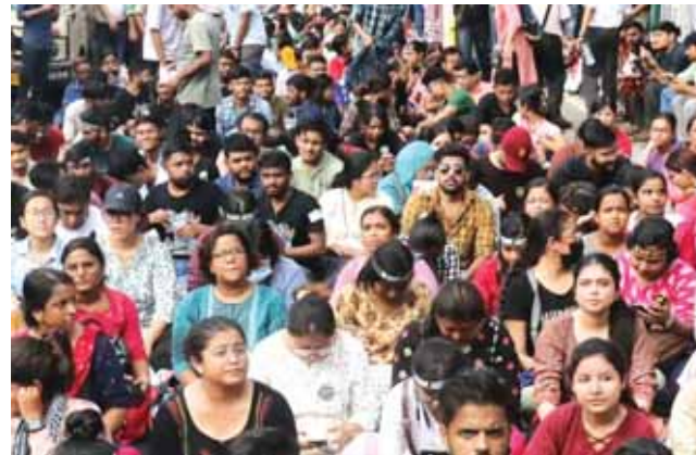
Representative file photo

"We have no security ... is this the price of being born a girl in