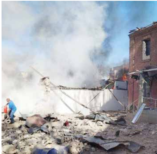
Ukrainian President Volodymyr Zelenskyy said Saturday that he will present his "victory plan" at the October 12

Another 25 drones disappeared from radar "presumably as a result of anti-aircraft missile defense," it said. The barrage comes a day after