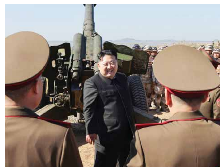
In this undated photo provided on Saturday by the North Korean government, North Korean leader Kim Jong Un, center, visits to watch an artillery exercise at an undisclosed place in North Korea. Independent journalists were not given access to cover the event depicted in this image distributed by the North Korean government. The content of this image is as provided and cannot be independently verified. Korean language watermark on image as provided by source reads: "KCNA" which is the abbreviation for Korean Central News Agency.

North Korea is locked in confrontations with the U.S., South Korea and their partners over its advancing nuclear program. Kim has said he was forced to expand both nuclear and conventional capabilities to cope with US-led security threats. On Sunday, KCNA reported that Kim oversaw a live artillery firing drill by cadets of a military academy. After watching the drill, Kim said training programs at the military academy must focus on "the guerrilla war tactics to wipe out the enemies through rapid mobile and surprise operations," according to KCNA.