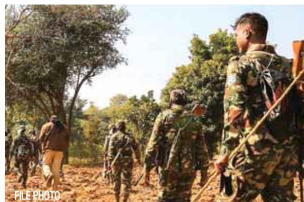
PIONEER NEWS SERVICE ■ DANTEWADA/NEW DELHI

In the largest such operation in Chhattisgarh's 24-year history, at least 30 Maoists were gunned down in an encounter with security forces in Abujhmad, Dantewada district, on Friday. The gunfight broke out at around 1 pm in the forest between Thulthuli and Nendur villages in Abujhmad on the Narayanpur-Dantewada inter-district border, when a joint team of security personnel was out on anti-Naxal operation. According to the police, the Districts Reserve Guards (DRG) from Dantewada and Narayanpur, acting on specific intelligence inputs on the presence of Maoists in the area, set out on an operation from different police camps. The DRG is a specialised force that includes Maoists who have