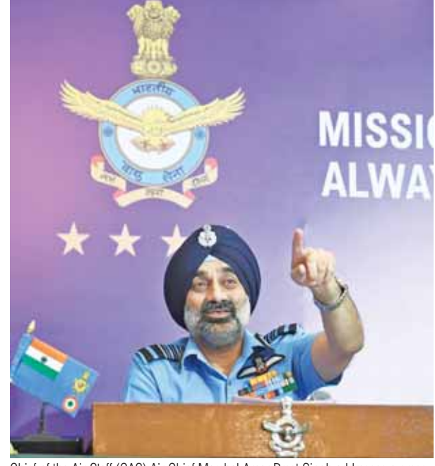
Chief of the Air Staff (CAS) Air Chief Marshal Amar Preet Singh addresses a press conference at Akash Air Force Mess, in New Delhi on Friday

China is rapidly developing infrastructure on its side across the Line of Actual Control (LAC) and India is also matching up by improving its airfields in the border areas, IAF chief AP Singh said here on Friday. He also said while India is ahead of China in terms of training, it lags behind in technology and rate of defence production and called for faster pace of developing and manufacturing weapon systems within the country. The Air Force Chief said the aim of the IAF is to achieve total self-reliance by 2047. The IAF Chief said India has the capabilities to intercept any incoming missile but lack the numbers. He made this observation when asked whether like Israel, which a few days ago intercepted most of the 200 missiles fired by Iran, India can do the same. He pointed out India is a much bigger country in terms of size compared to Israel and will prioritise in defending vital strategic installations if attacked by missiles. Making these assertions here during the annual press conference ahead of the Air Force Day on October 8, he said India is modernising its