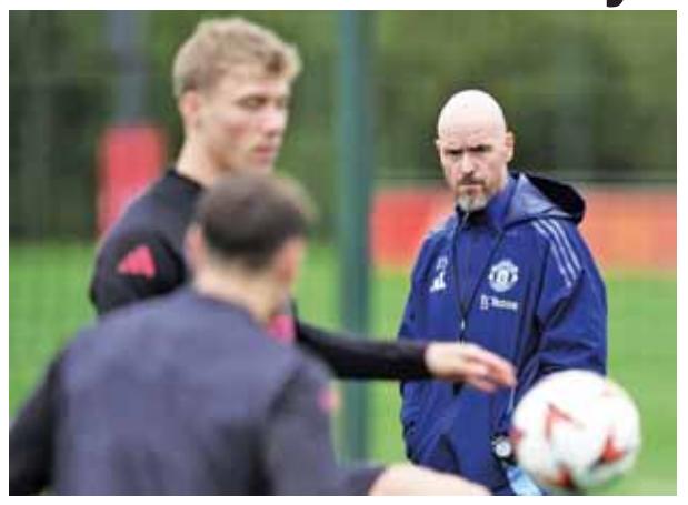
with a trophy, but the feel-good factor provided by the most recent silverware - May's FA Cup triumph against Manchester City - has long evaporated in the face of the

It feels like Groundhog Day for Manchester United and Erik ten Hag. Another season has hit crisis point after only a few games. Perhaps that's why the United manager was so dismissive of the renewed pressure on him after last week's humbling 3-0 loss to Tottenham. "Nothing is easy, but this is nothing for me to panic about because I experienced it so often with my teams during seasons that you are facing those problems," he said this week. He is right. United's record of three losses after six English Premier League games is in keeping with his two previous campaigns at Old Trafford. In 2022, he lost his opening two and three of the first seven. In 2023 it was even worse, as United lost three of five at the start. Both of those seasons ended