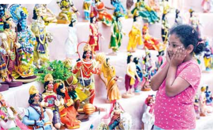
A child looks at dolls depicting scenes from Ramayana during the Dussehra Doll festival, in Bengaluru