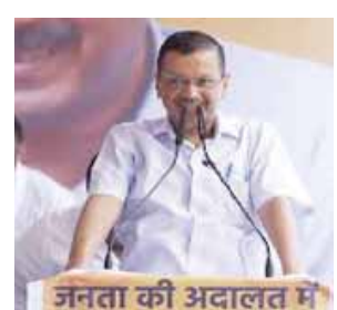
Chhatrasal Stadium in Model Town. On September 15, Kejriwal announced his decision to resign from the CM's post, saying that he needed to go to the "peoples' court", just two days after being released from Tihar

Aam Aadmi Party chief Arvind Kejriwal will address his second 'Janta Ki Adalat' rally at north Delhi's Chhatrasal stadium on Sunday, AAP's Rajya Sabha MP Sanjay Singh said. Addressing a press conference at the party headquarters on Friday, Singh expressed hope that the people of Delhi will give a massive mandate to the AAP in the upcoming assembly polls, as a "certificate of Kejriwal's honesty". He said that the AAP national convenor will address the rally at