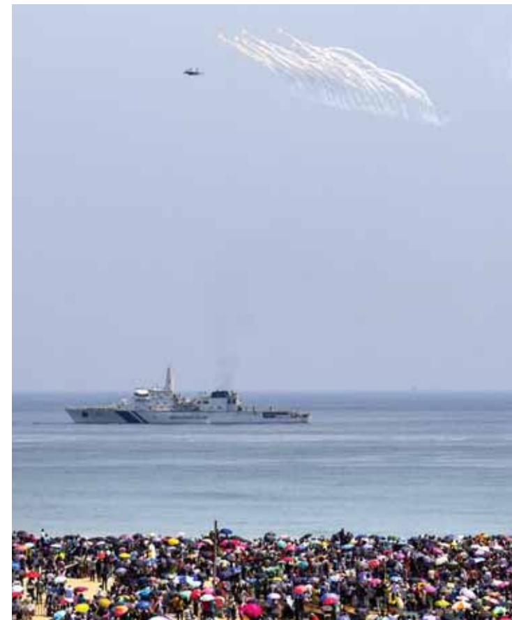
People watch the final rehearsal of Indian Air Force (IAF) aircrafts ahead of its 92nd anniversary celebrations, in Chennai