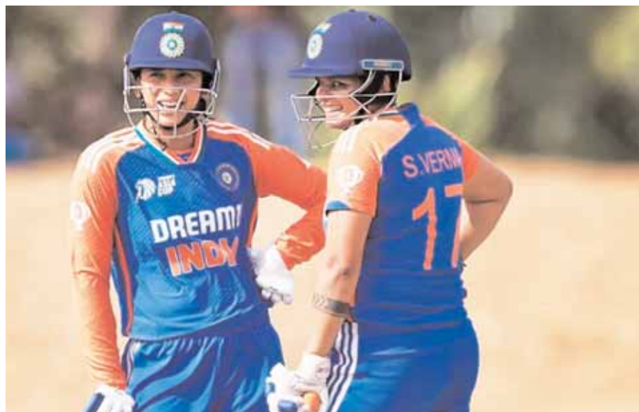
relationship with Mandhana. "We understand how important we both are to the team, especially during the

Shafali Verma, the significant other of the blockbuster Indian opening pair, says her no-holds-barred approach goes well with Smriti Mandhana's elegance and both can "sense each other's feelings just by our facial expressions" while batting. One of the factors behind the Indian women's cricket team's dominance in recent times has been the success of its openers, and Shafali admits they know how "important" they are to the team's fortunes. "I've been opening with Smriti for the past two-three years, and now we can sense each other's feelings just by our facial expressions while batting. We know each other's strengths and weaknesses, and we give each other positive vibes," Shafali told Star Sports when asked about her on-field