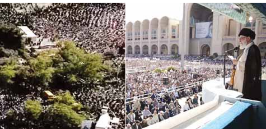
■ TEHRAN/ BEIRUT

Iran's supreme leader on Friday praised the country's recent missile strike on Israel and said it was ready to do it again if necessary, state TV reported. Ayatollah Ali Khamenei, in his first appearance as leader, in about five years, at Friday prayers, called the missile strike a "shining" job by Iran's armed forces. On the other hand Israel carried out a series of massive airstrikes overnight, hitting suburbs of Beirut and cutting off the main border crossing between Lebanon and Syria for tens of thousands of people fleeing Israeli bombardment. The Israeli military said Friday