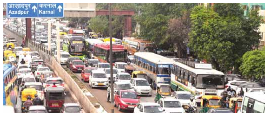
A Traffic Jam Vehicles move on road at isbt kashmiri gate