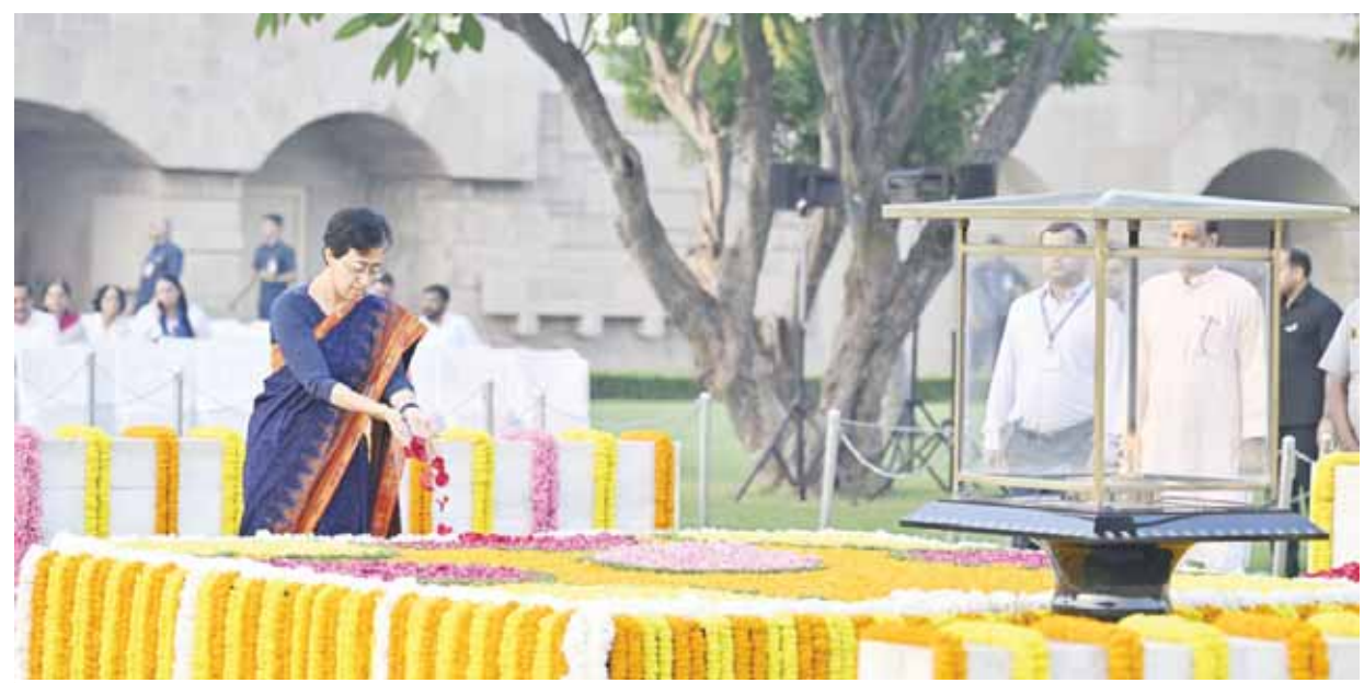
Delhi Chief Minister Atishi pays homage to Mahatma Gandhi on his birth anniversary at Rajghat