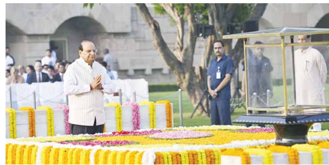
Delhi Lt Governor VKSaxena pays homage to Mahatma Gandhi on his birth anniversary at Rajghat