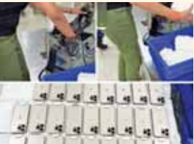
Combo photo shows 26 iPhone 16 Pro Max mobile phones seized by customs officials at IGI airport from a lady passenger travelling from Hongkong to Delhi, in New Delhi