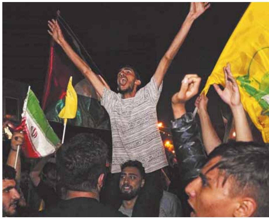
Demonstrators celebrate Iran's missile strike against Israel during a gathering in front of the British Embassy in Tehran, Iran, Tuesday.

"We stand with Israel, and we recognise her right to self-defence in the face of this aggression," he said. He called on Iran to "stop these attacks", saying it had "menaced the Middle East