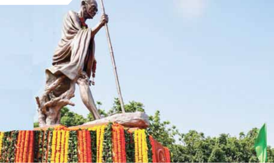
Mahatma Gandhi's statue, decorated with flower on his birth anniversary, in New Delhi