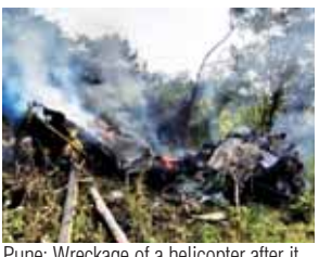
Pune: Wreckage of a helicopter after it crashed at Bavdhan area in Pune district, Wednesday, Oct. 2, 2024. Two persons are feared killed

daughters. "The situation has come to such a pass that while the High Court is expressing concerns over this, the government is filing an affidavit to deny infiltration," the Prime Minister said. He also criticised the coalition for allegedly being insensitive, citing the deaths of several aspirants during recruitment drives for excise constables. Modi said, "They want to sacrifice Jharkhand to gain power. Santhal Pargana is testimony to this dangerous gameplan where tribal population is on the decline while that of Bangladeshi infiltrators is on the rise. Do you accept this change in Jharkhand's demography and decline in population of Hindus and tribals?" He alleged that infiltrators are grabbing the land of the tribal people and targeting their