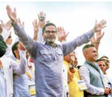
Jan Suraj founder Prashant Kishor during the formal launch of his new political party as Jan Suraj Party at Veterinary College grounds, in Patna