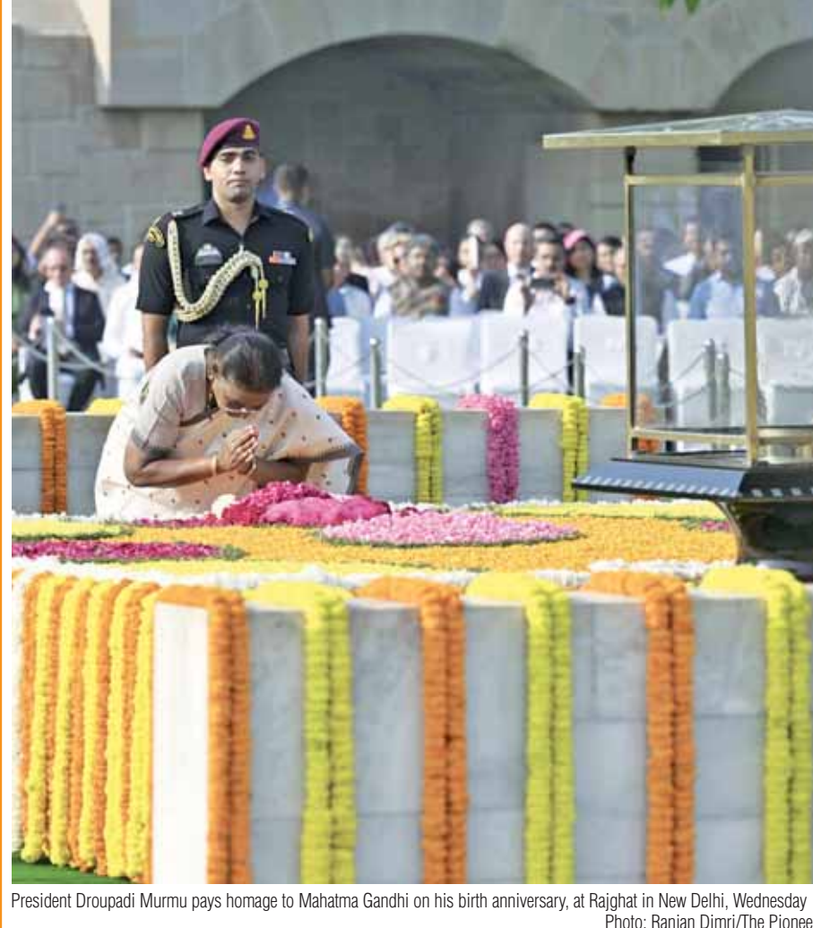
President Droupadi Murmu pays homage to Mahatma Gandhi on his birth anniversary, at Rajghat in New Delhi, Wednesday