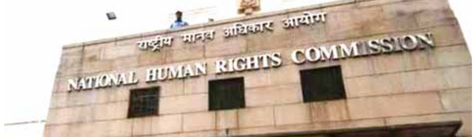
PIONEER NEWS SERVICE ■ NEW DELHI

The National Human Rights Commission (NHRC) has taken suo motu cognisance of a media report that a man bitten by a snake has lost his life as he was detained and not allowed to rush to the hospital for treatment by some policemen despite his repeated request in Kaimur district, Bihar. It has issued a notice to the Director General of Police, Government of Bihar calling for a detailed report within two weeks. It is expected to include the status of the police investigation as well as action taken against the errant police personnel. As per the media reports, the cops demanded Rs. 2000 in bribe from the man bitten by the snake forcing him to