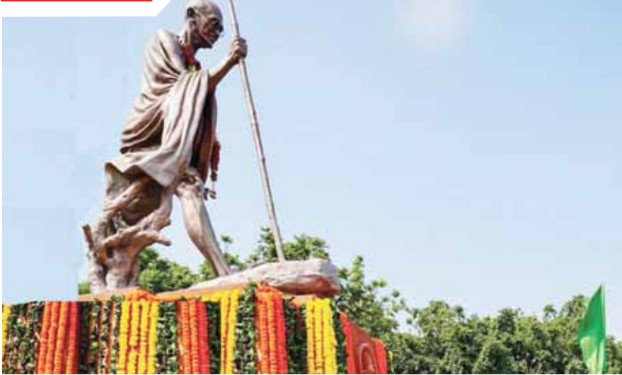
Mahatma Gandhi's statue, decorated with flower on his birth anniversary, in New Delhi