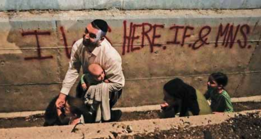
People take cover on the side of the road as a siren sounds a warning of incoming missiles fired from Iran on a freeway in Shohesh, between Jerusalem and Tel Aviv in Israel