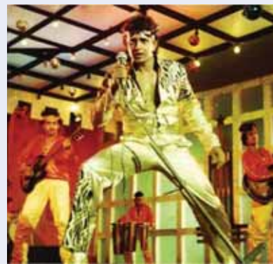
Apropos to 'Dadasaheb Phalke finally acknowledge Mrigayaa actor' published on October 1. Gouranga Chakraborty aka Mithun Da was born in Barisal, Bangladesh. He

has had his share of struggle when he had to sleep on Bombay pavements with a hungry stomach in his early life. He even assisted yesteryear's dancing sensation Helen. He is the only actor to be awarded a National award for his debut film and later he won two more National awards. He also holds a black belt in martial arts. Today it is common for chiseled body actors to flaunt their six or eight packs, but it was Mithun Chakraborty who started this trend. His super hit film 'Disco Dancer' not only became a hit movie in India but has a cult following in the former USSR, Eastern Europe, Africa and the Middle East. A Limca Book of Records in his name, 19 movies released in 1989, is still unbroken. His rise to the top is indeed a testament that one can fulfil his dreams. He truly deserves this esteemed honour.