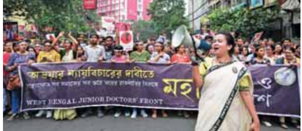
Members of Bengal Junior Doctors' Front and others take part in a mega rally on 'Mahalaya' to demand justice for the alleged sexual assault and murder of a trainee doctor at RG Kar Medical College and Hospital, in Kolkata, Wednesday