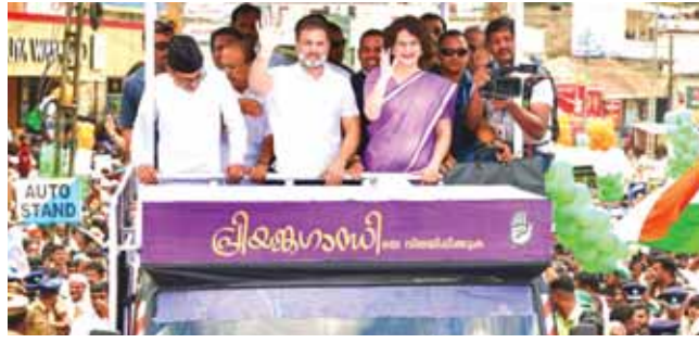
Congress leader and Leader of Opposition in Lok Sabha Rahul Gandhi with party leader and candidate from Wayanad constituency Priyanka Gandhi Vadra during a roadshow before filing her nomination for the upcoming Lok Sabha bypoll, in Wayanad, Kerala, Wednesday