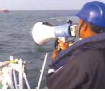
An Indian Coast Guard official during preparations ahead of the landfall of Cyclone Dana

PNS ■ BHUBANESWAR As cyclone 'Dana' barrels toward the Odisha coast, threatening to impact nearly half the state's population, the government is racing against time to execute a massive evacuation plan aimed at relocating around 10 lakh people in 14 districts to safety. The Indian Meteorological Department (IMD) on Wednesday said the cyclone is likely to make landfall between Bhitarkanika National Park and Dhamra port, around 70 km away, early Friday. It said the landfall process will start from the night of October 24 and will continue till the morning of October 25. The maximum speed during the landfall process is likely to be around 120 kmph, IMD DG Mrutyunjay Mohapatra said. He said landfall is mostly a slow process which usually takes around 5-6 hours. "Therefore, heavy rainfall, wind and storm surge will reach the peak during the landfall time which is between October 24 night and October 25 morning," he added. According to the latest IMD bulletin, the cyclone moved northwards with a speed of 13 kmph and lay centred about 490 km southeast of Paradip (Odisha), 520 km south-southeast of Dhamra (Odisha) and 570 km southeast of Sagar Island (West Bengal). During the landfall, a tidal surge of up to two metres is expected, with the cyclone reaching