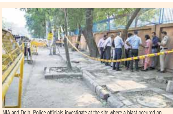
NIA and Delhi Police officials investigate at the site where a blast occurred on Sunday, near a CRPF school at Prashant Vihar, in Rohini area of New Delhi

year in Galwan. Twenty Indian army personnel including the commanding officer died in the clash while more than 40 Chinese troops were also killed. Both the sides then amassed troops and weaponry on their respective sides of the LAC. In fact, India, not willing to take any chances, also deployed its troops even during the winter months at the LAC. Earlier, the troops used to withdraw to their bases during the winters. At one point of time, more than 50,000 troops from each side were facing each other on friction points at the LAC. Given the situation, India and China, since 2020, held several rounds of talks at the military and diplomatic levels. While Corps Commanders of the two sides held military level talks, the diplomatic level talks were held under the aegis of Working Mechanism for Consultation and Coordination (WMCC) on India-China Border Affairs.