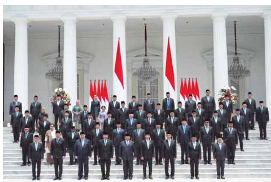
Indonesian President Prabowo Subianto, front centre, and Vice President Gibran Rakabuming Raka, front row fourth from right, pose for a group photo with newly-appointed cabinet ministers after their swearing-in ceremony at Merdeka Palace in Jakarta, Indonesia, on Monday.

Newly inaugurated President Prabowo Subianto swore in Indonesia's largest Cabinet since 1966 on Monday, with 109 members representing his pledge for a strong government. He announced the lineup late Sunday and named his Cabinet of ministers, vice ministers and head of national agencies the "Red and White Cabinet," referring to the colours of Indonesia's flag. Subianto became the eighth president of Southeast Asia's largest economy on Sunday. The Cabinet of Subianto's predecessor, Joko Widodo, had 34 ministers and head of government agencies. Subianto's Cabinet is the largest since 1966 when Indonesia's first President Sukarno formed a lineup of 132 ministers in an extremely tense political situation after a failed 1965 coup.