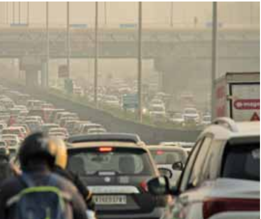
Heavy evening traffic moves amidst a blanket of smog, in Gurugram, Monday

Gate ISBT, Sadar Bazar, Chirag Dilli, roads surrounding major markets including Sarojini Nagar, Chandni Chowk, Lajpat Nagar, Kamla Nagar were among those areas witnessed heavy traffic on Monday. These stretches are the busiest roads known for heavy traffic flow during the week. Lakhs of people commute in and from Delhi to Gurugram, Noida, Faridabad and Ghaziabad daily. Neighbouring Noida has been consistently contributing between 10 and 11 per cent to Delhi's pollution, while Ghaziabad's share ranges from 5 to 10 per cent, as per the DSS -