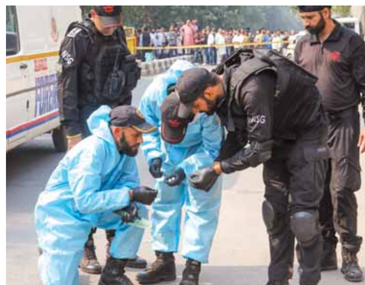
National Security Guard (NSG) personnel conduct investigations at the site of the blast at Prashant Vihar, near the CRPF school in Rohini area of New Delhi on Sunday