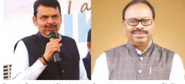
Devendra Fadnis and Chandrashekhar Bawankule

The ruling Bharatiya Janata Party (BJP) on Sunday retained 71 of its sitting MLAs, as it released its first list of 99 candidates for the Maharashtra Assembly polls that contained the names of its bigwigs like Deputy Chief Minister Devendra Fadnis, state unit President Chandrashekhar Bawankule and as many as 13 women candidates. With the Opposition Maha Vikas Aghadi (MVA) still to formalise its tie-up among its constituents and its own MahaYuti allies - the Shiv Sena (Eknath Shinde) and Nationalist Congress Party (Ajit Pawar) having not released their lists of candidates yet, the BJP became the first major political party in Maharashtra to get off the blocks for the November 20 Assembly polls. The BJP, which heads the grand ruling alliance MahaYuti, is likely to contest anywhere from 155 to 160 seats out of the total 288 seats in the 2024 Assembly polls, as against 164 seats it had contested in the 2019 Maharashtra Assembly polls. The BJP released its first list of