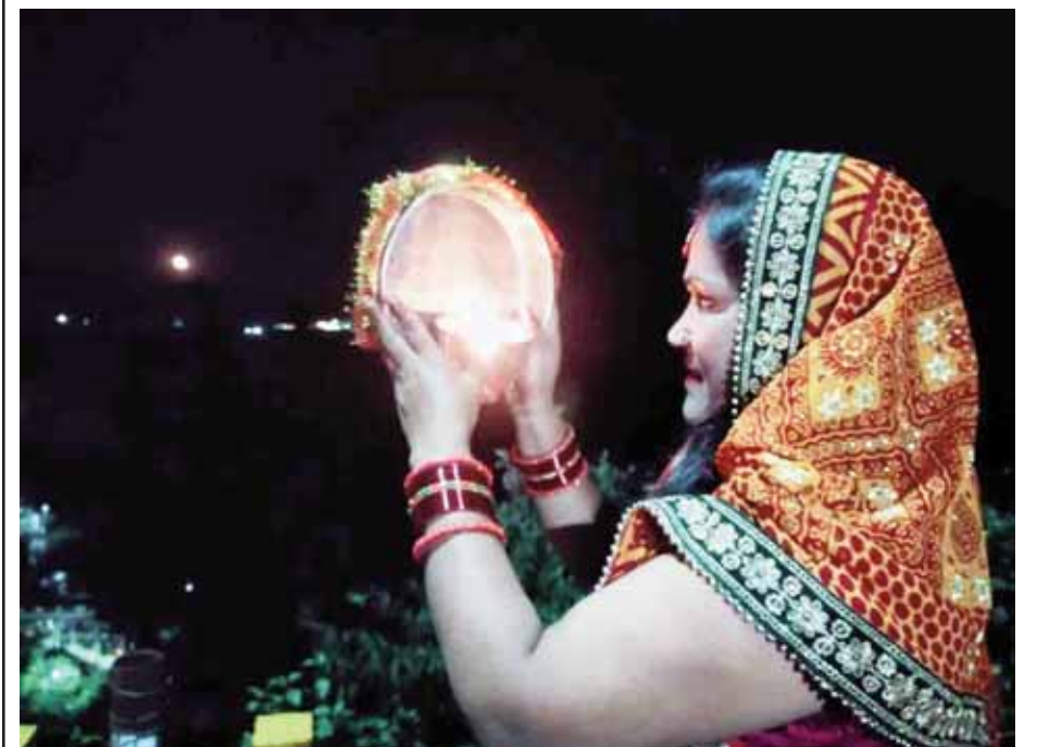
A woman looks at the moon through a sieve as part of Karwa Chauth rituals in Nainital on Sunday

Other improvements planned here include installation of a five-line train display board at the entry gate, 43-inch LED television in the waiting rooms, 65-inch LED digital signage board for train display board and PRS/UTS hall, single-line train display boards for all the five platforms, coach display guidance system and GPS clocks. CCTV cameras will also be installed at the entry and exit gates, the officials added. The completion of these works is expected to modernise the Lalkuan railway station and enhance the convenience of passengers along with safety measures.