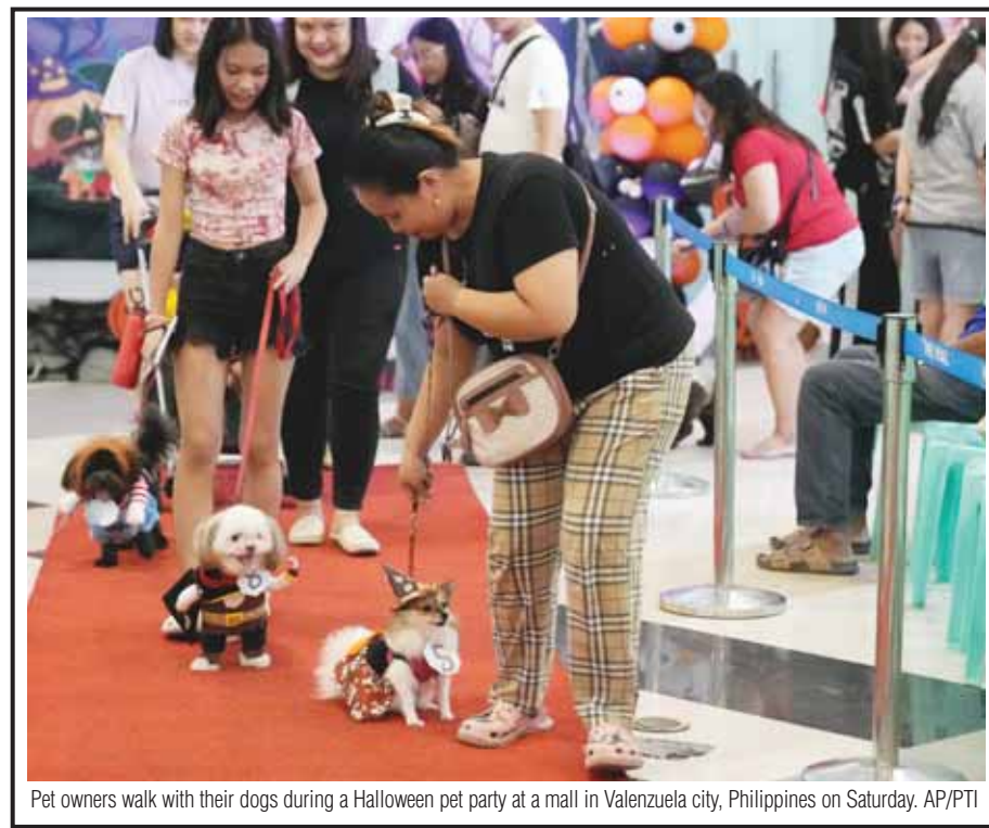
Pet owners walk with their dogs during a Halloween pet party at a mall in Valenzuela city, Philippines on Saturday.

polio eradication. Of the 37 cases detected from across Pakistan so far this year, the official said, 20 have been reported from Balochistan, 10 from Sindh, five from KP, and one each from Punjab and Islamabad. "Genetic sequencing of the cases is underway," he disclosed. "These were the first polio cases from Noshki and Lakki Marwat this year," he said, adding that both Chaman and Pishin had reported one poliovirus case each earlier as well. Officials claimed that the fight against poliovirus in Balochistan and southern KP suffered in 2023 and early 2024, as immunisation campaigns were either staggered or postponed due to localised protests.